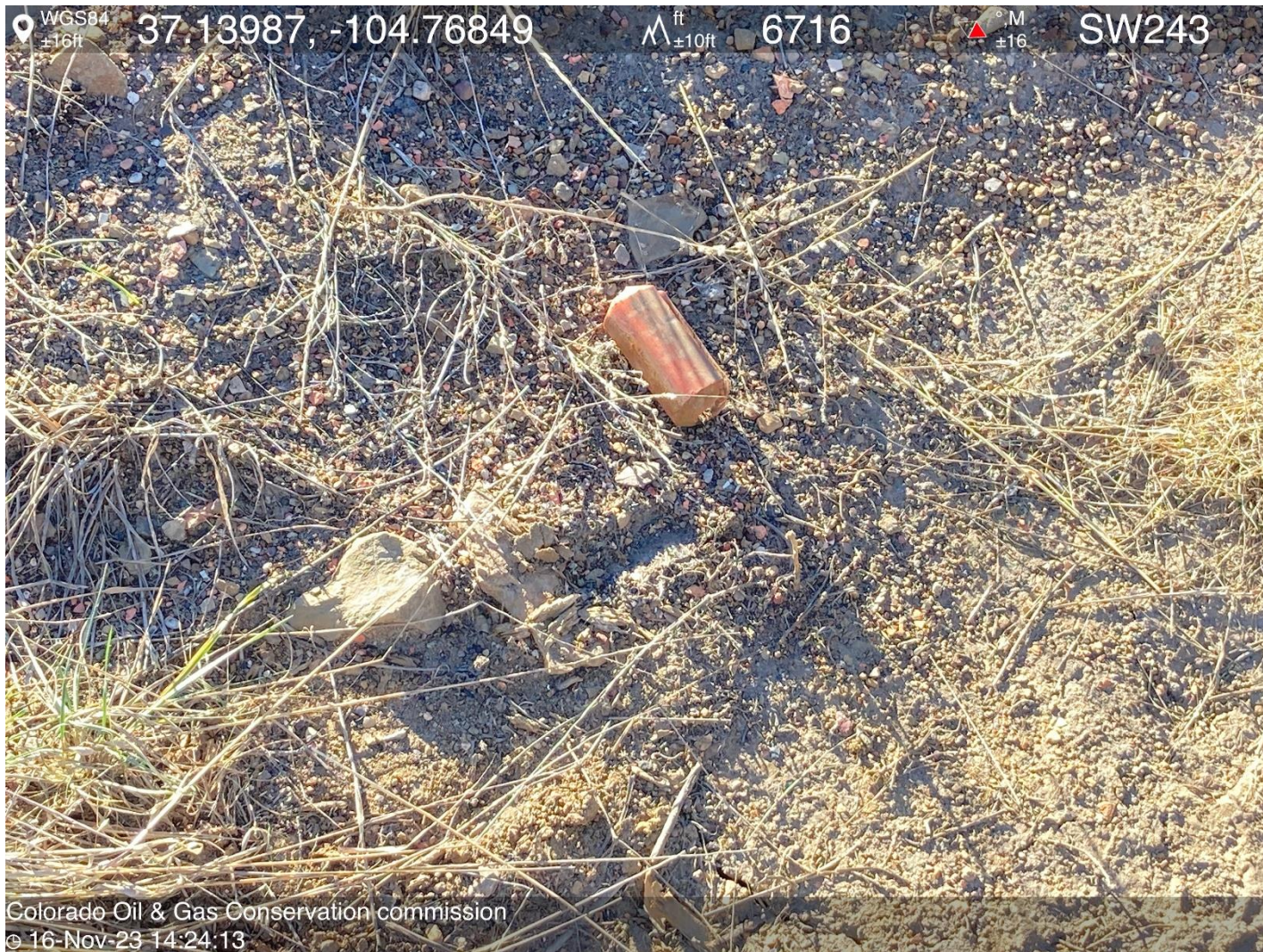
PHOTO 7: TRASH ON NORTH/ NORTHWEST SIDE OF LOCATION (NOT PHOTO WAS TAKEN ON FIRST SOUND COMPLAINT INSPECTION ON 11-21-23 DO TO WEATHER CONDITIONS ON LOCATION CA TIME FRAME HAS BEEN EXTENDED CA SHOULD BE ADDRESSED AS SOON AS CONDITIONS PERMIT) REMOVE ALL TRASH/DEBRIS PER RULE 606. CA DATE 2-20-2024.