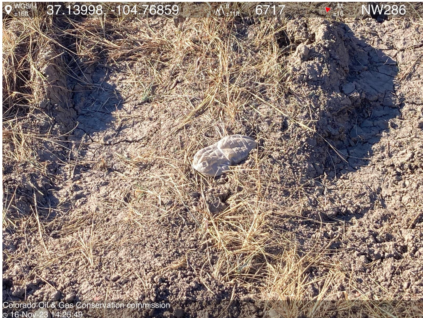
PHOTO 9: TRASH ON NORTH/ NORTHWEST SIDE OF LOCATION (NOT PHOTO WAS TAKEN ON FIRST SOUND COMPLAINT INSPECTION ON 11-21-23 DO TO WEATHER CONDITIONS ON LOCATION CA TIME FRAME HAS BEEN EXTENDED CA SHOULD BE ADDRESSED AS SOON AS CONDITIONS PERMIT) REMOVE ALL TRASH/DEBRIS PER RULE 606. CA DATE 2-20-2024.