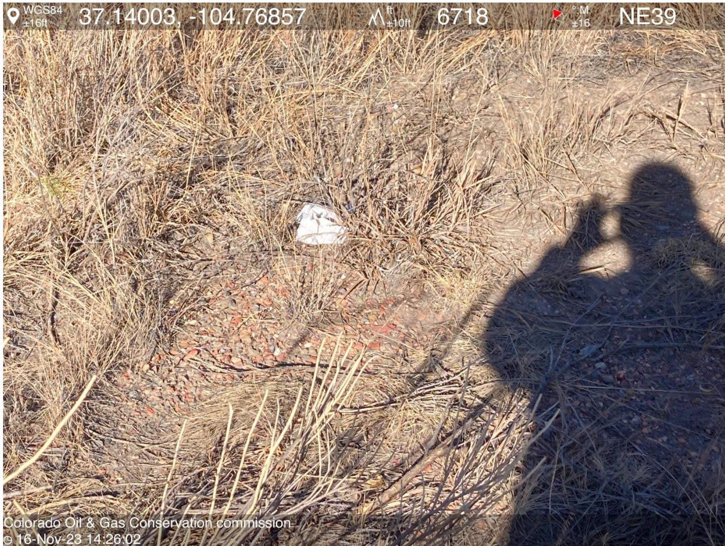
PHOTO 7: TRASH ON NORTH/ NORTHWEST SIDE OF LOCATION (NOT PHOTO WAS TAKEN ON FIRST SOUND COMPLAINT INSPECTION ON 11-21-23 DO TO WEATHER CONDITIONS ON LOCATION CA TIME FRAME HAS BEEN EXTENDED CA SHOULD BE ADDRESSED AS SOON AS CONDITIONS PERMIT) REMOVE ALL TRASH/DEBRIS PER RULE 606. CA DATE 2-20-2024.