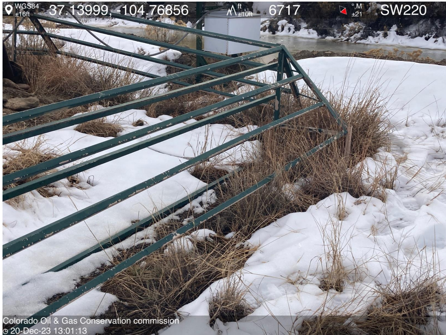
PHOTO 6: WEEDS AROUND JUMPMACK ARE OVERGROWN AND DRY. MAINTAIN WEEDS PER RULE 606. CA DATE 1-20-2024.