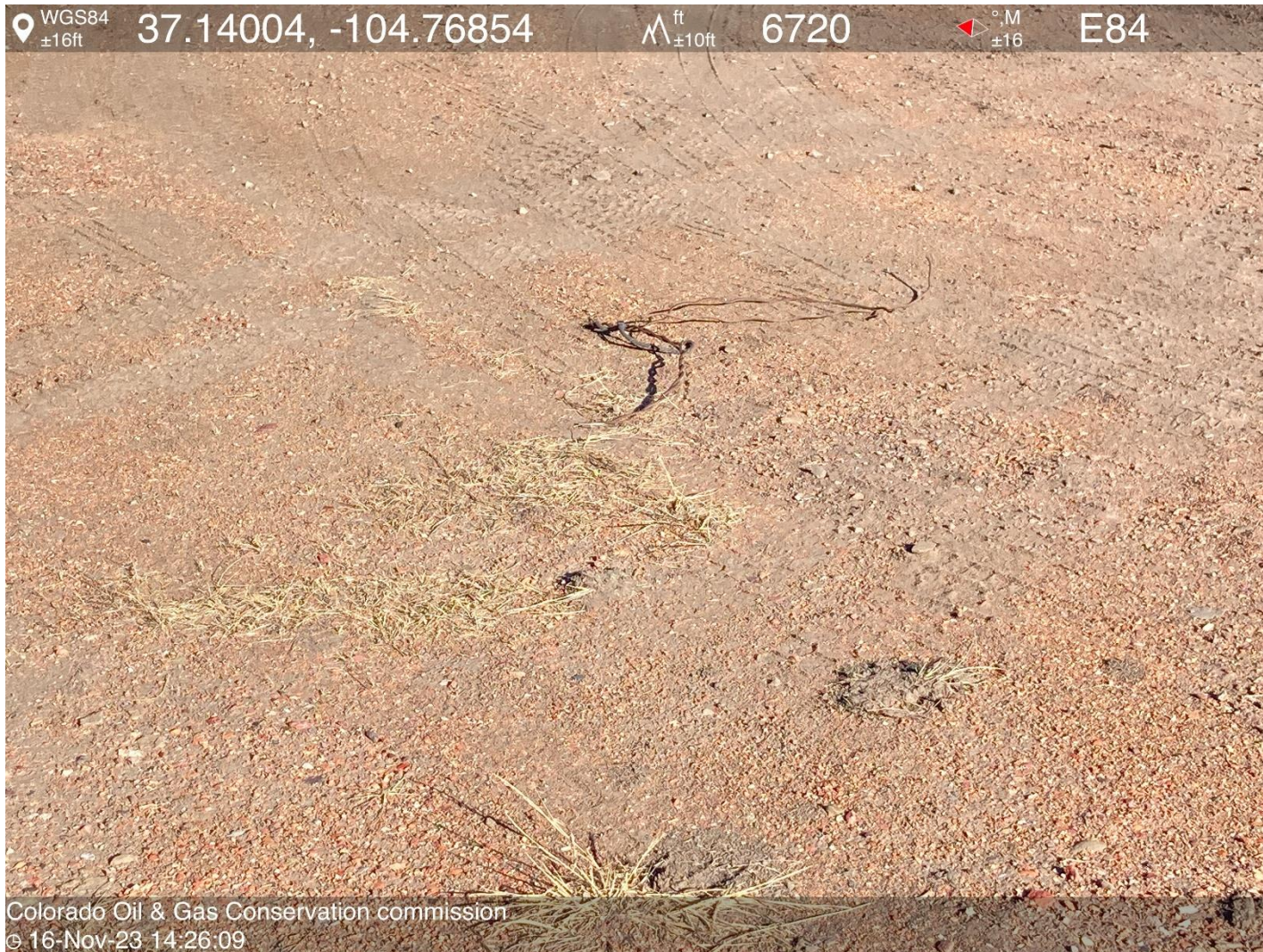
PHOTO 10: TRASH ON NORTH/ NORTHWEST SIDE OF LOCATION (NOT PHOTO WAS TAKEN ON FIRST SOUND COMPLAINT INSPECTION ON 11-21-23 DO TO WEATHER CONDITIONS ON LOCATION CA TIME FRAME HAS BEEN EXTENDED CA SHOULD BE ADDRESSED AS SOON AS CONDITIONS PERMIT) REMOVE ALL TRASH/DEBRIS PER RULE 606. CA DATE 2-20-2024.