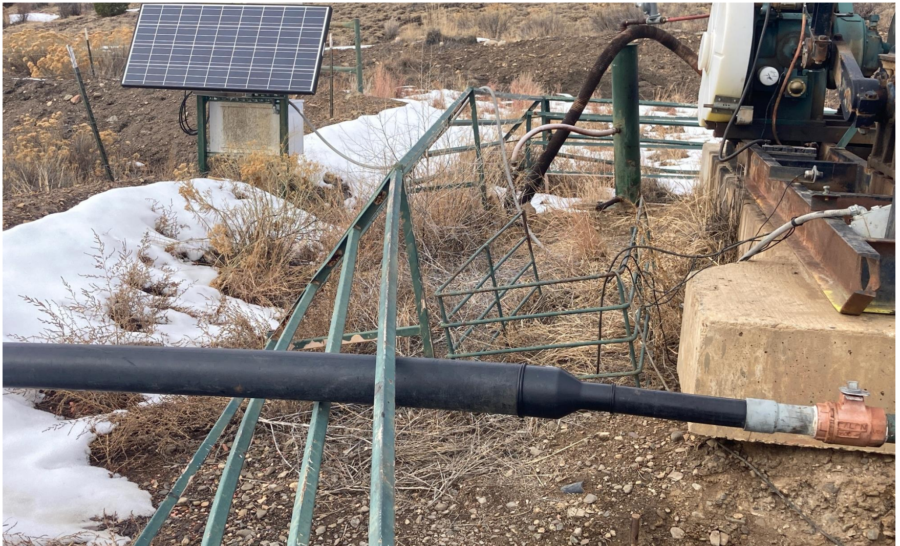
PHOTO 5: WEEDS AROUND JUMPMAT ARE OVERGROWN AND DRY. MAINTAIN WEEDS PER RULE 606. CA DATE 1-20-2024.