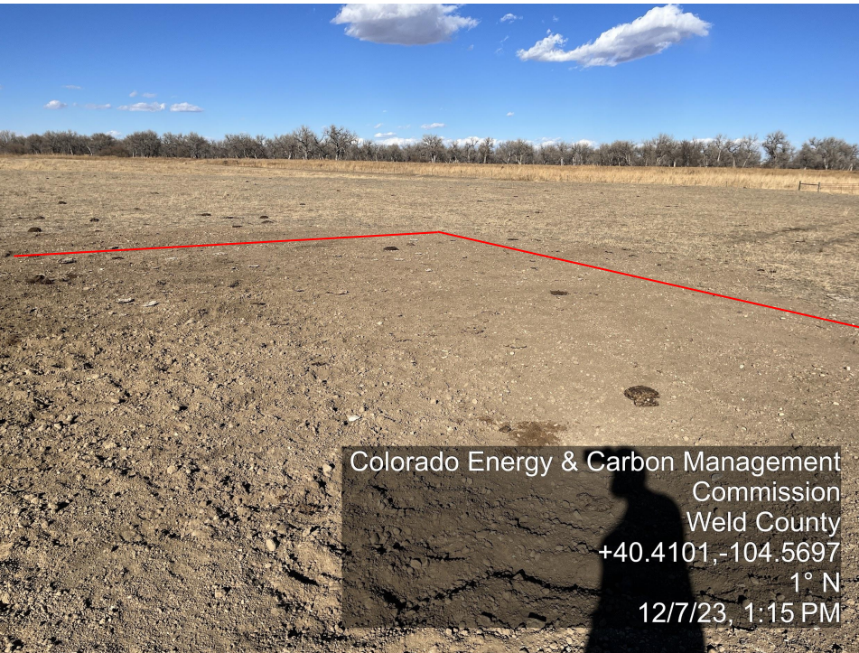
Photo 11. The photo was taken from the well location facing North. The photo illustrates the pad is cleared but not revegetated and road base still remains.