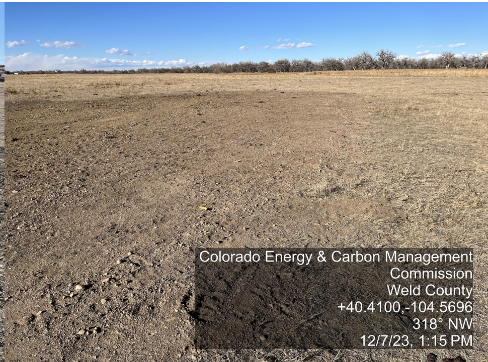
Photo 14. The photo was taken from the well location facing Northwest. Refer to the comment for photo 11.