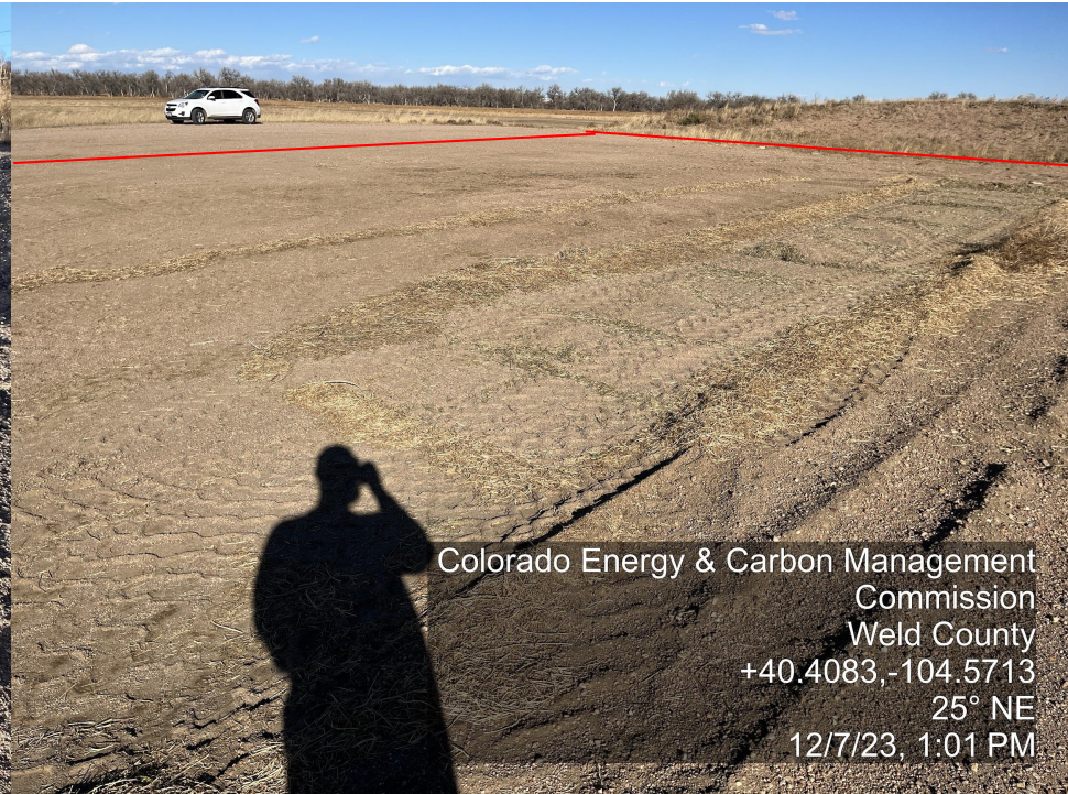
Photo 7. The photo was taken at the tank battery location facing Southeast. The photo illustrates fencing materials left on location.

Photo 8. The photo was taken at the tank battery location facing Northeast. The photo illustrates what appeared to be leftover hay from a stack that was being stored on location.