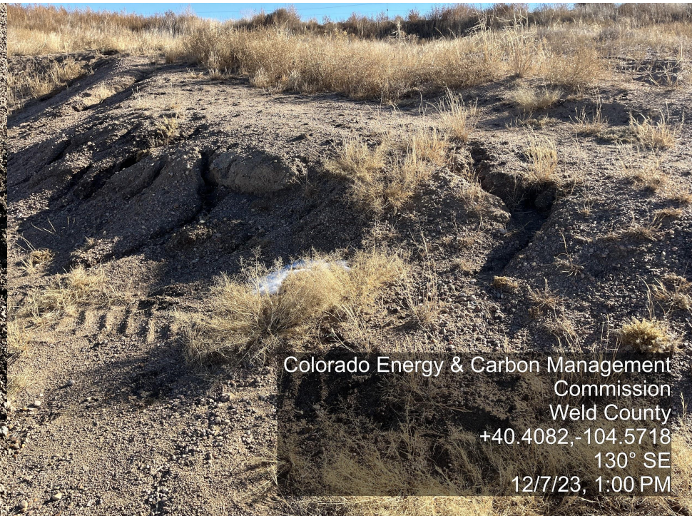
Photo 6. The photo was taken at the tank battery location facing Southeast. The photo illustrates rill erosion along the South side of the location.