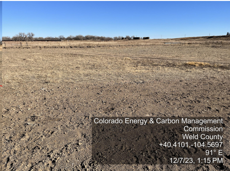
Photo 12. The photo was taken from the well location facing East. Refer to the comment for photo 11.