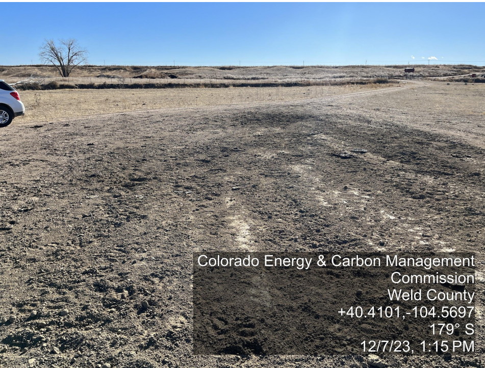
Photo 13. The photo was taken from the well location facing South. Refer to the comment for photo 11.