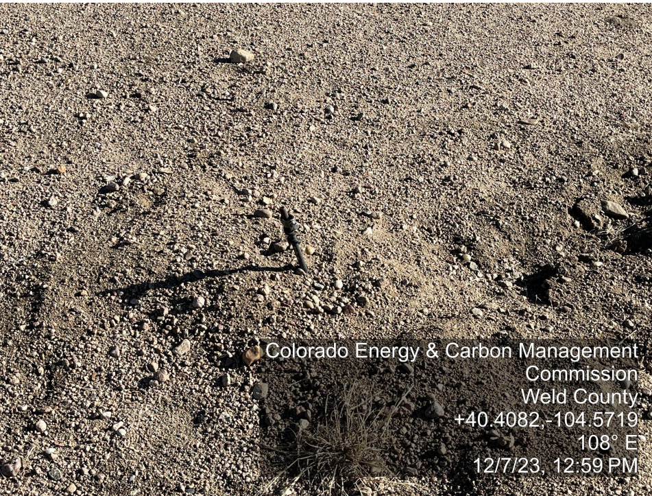
Photo 5. The photo was taken at the tank battery location facing East. The photo illustrates a grounding rod left in the ground on location.