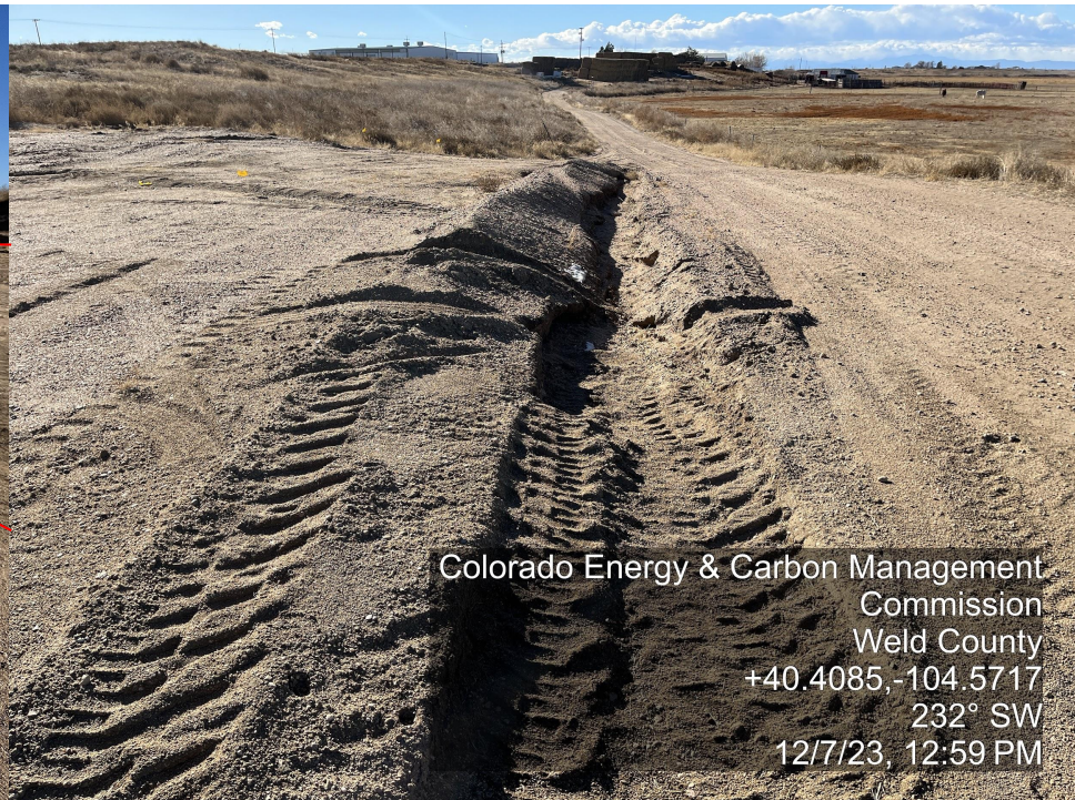
Photo 3. The photo was taken at the tank battery location facing Northeast. Refer to the comment for photo 1.

Photo 4. The photo was taken at the tank battery location facing Southwest. The photo illustrates gully erosion at the West end of the pad.