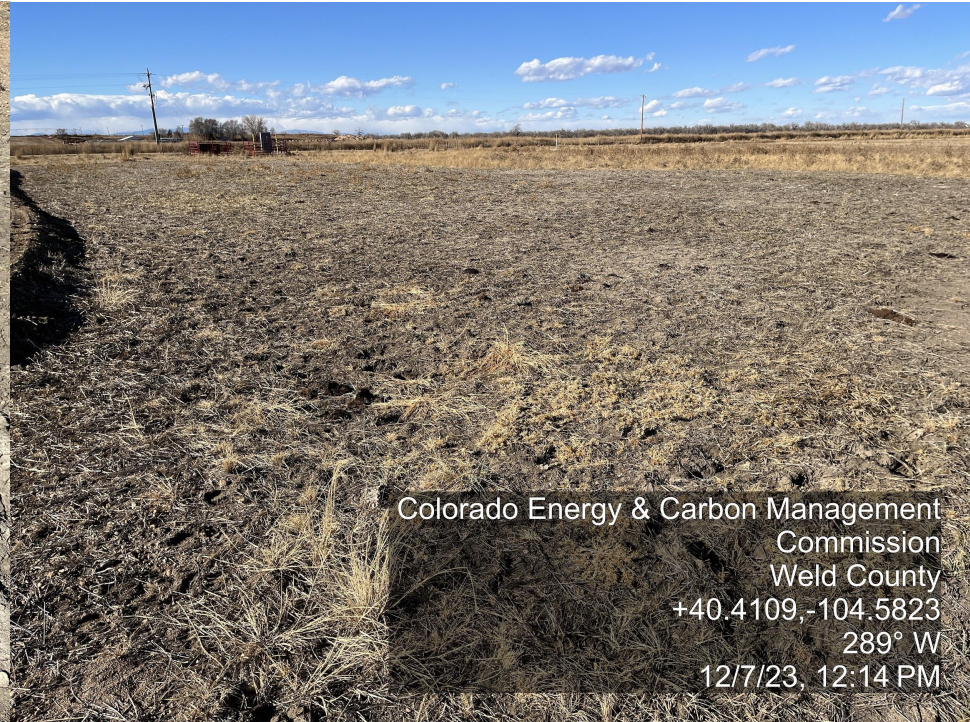
Photo 7. The photo was taken at the well location facing Northwest. The photo illustrates a temporarily stabilized outlet through the perimeter gravel berm. The BMP will need some maintenance as stakes and wattle are sedimented and beginning to fall apart potentially due to cattle.

Photo 8. The photo was taken at the well location facing Northwest. The photo illustrates a large patch of interim reclamation that still does not appear to be growing.