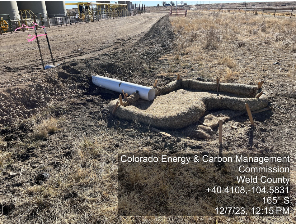
Photo 9. The photo was taken at the well location facing South. Refer to the comment for photo 7.