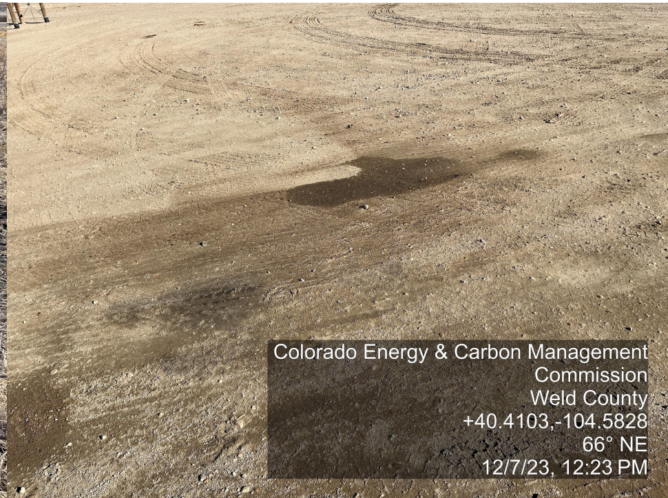
Photo 10. The photo was taken at the well location facing Northeast. The photo illustrates a small patch of stained soil that smelled of diesel.