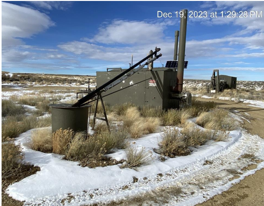
Equipment in use?