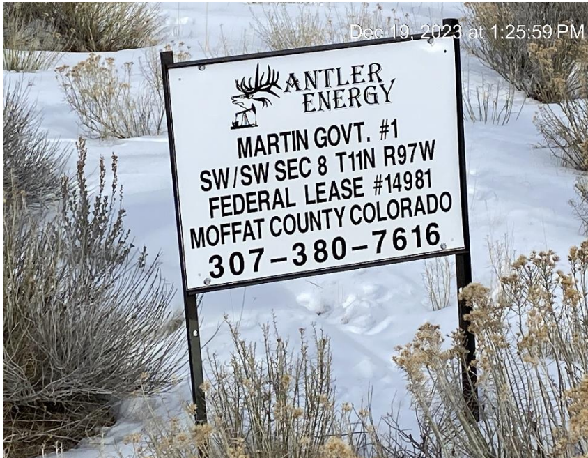
Entrance sign when replaced will need additional information