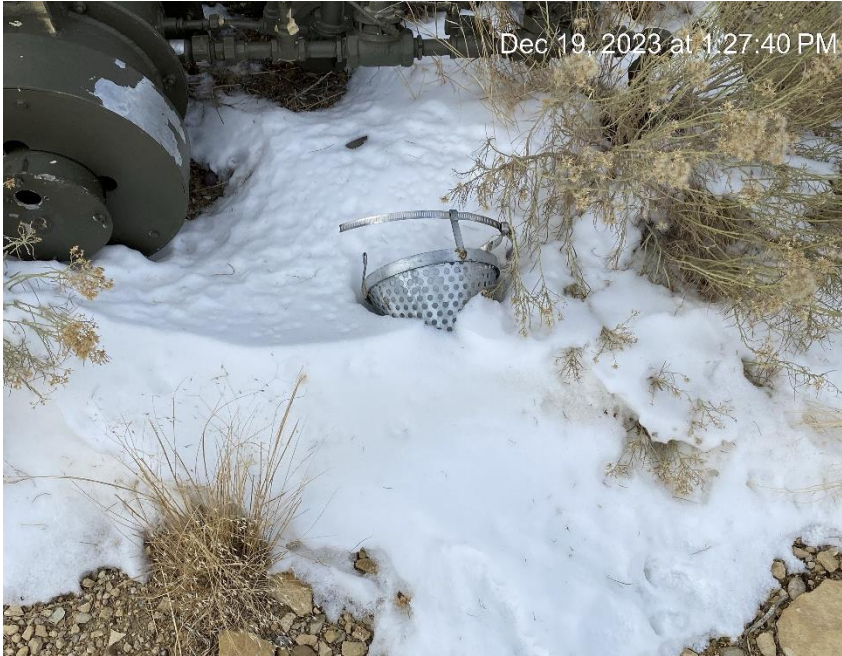
Bird cage still on the ground