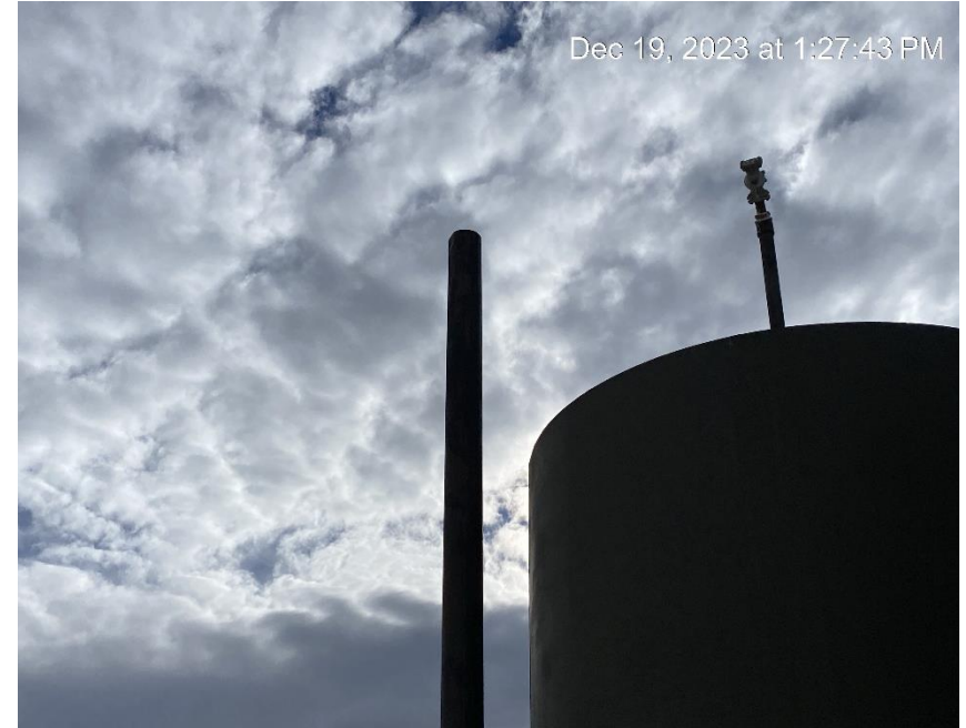
Bird cage has not been replaced