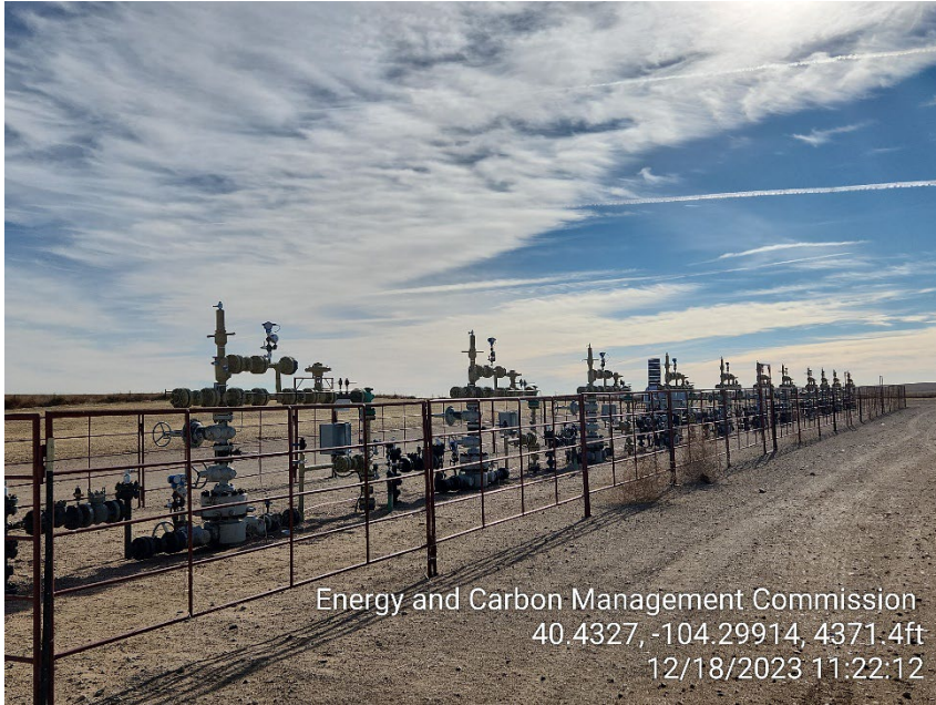
Energy and Carbon Management Commission 40.4327, -104.29914, 4371.4ft 12/18/2023 11:22:12