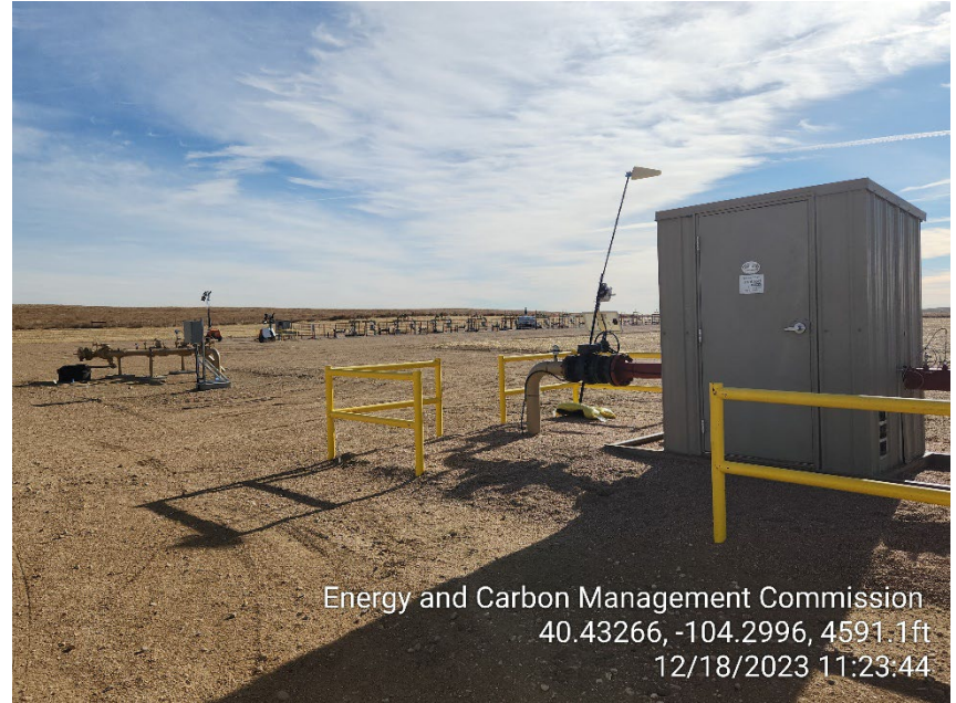
Energy and Carbon Management Commission 40.43266, -104.2996, 4591.1ft 12/18/2023 11:23:44