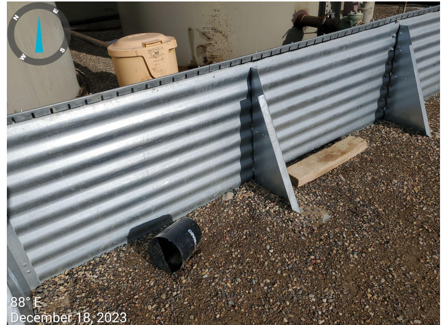
Photo 28: Various trash/debris/unused equipment/container/etc... observed improperly stored on the Location.