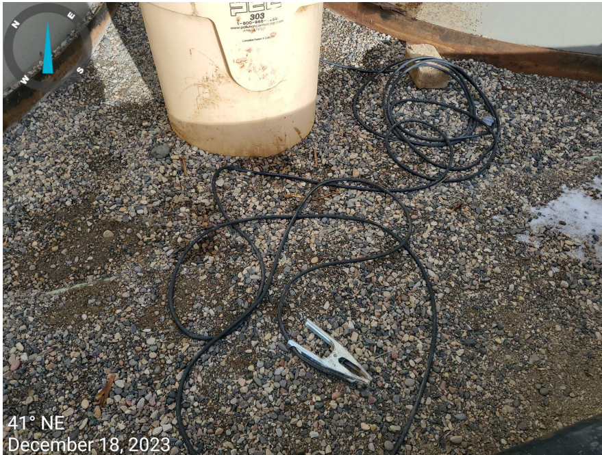
Photo 29: Various trash/debris/unused equipment/container/etc... observed improperly stored on the Location.