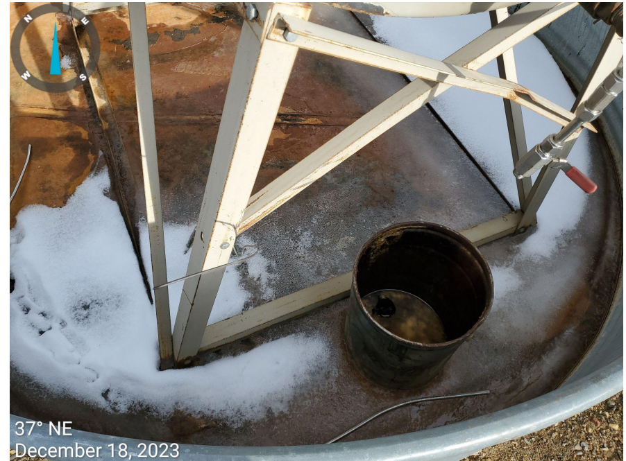
Photo 25: Various trash/debris/unused equipment/container/etc... observed improperly stored on the Location.