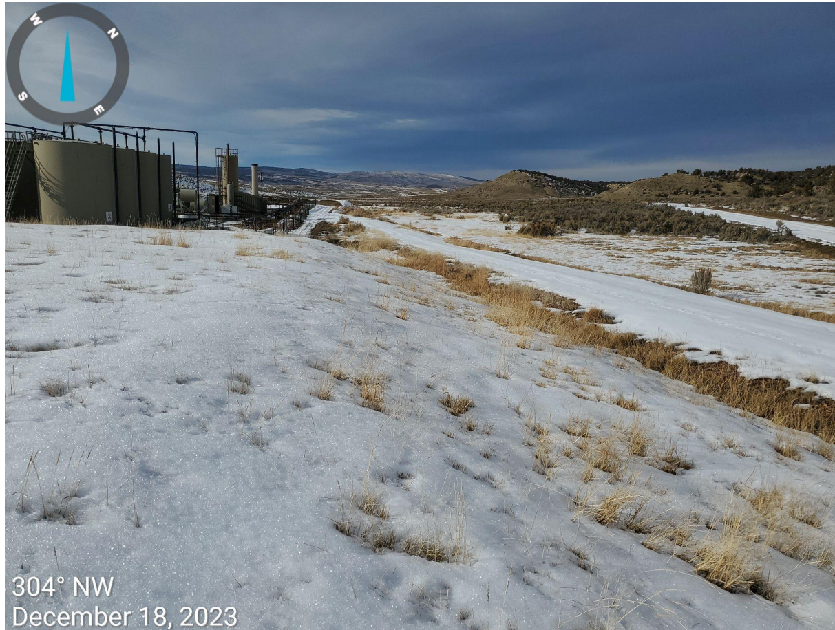
Photo 7: Photos 7-8 taken from the east ends of the Location. Photos shows a second access road constructed on the Location; Road is ~800 feet and unnecessary.