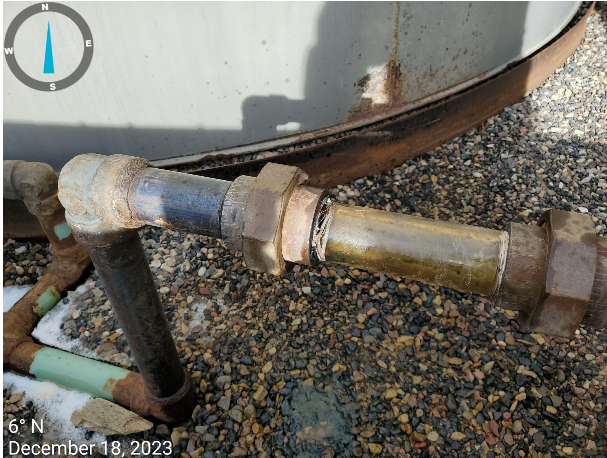
Photo 12: Photo taken from the tank battery facility. Photo shows crack at the “recycling line”, resulting in a leak/spill.