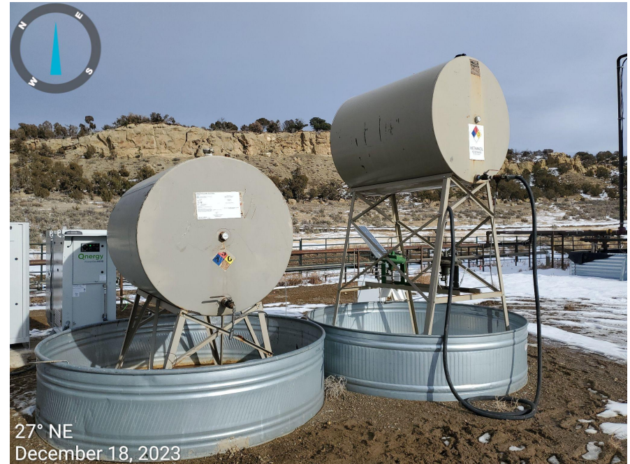
Photo 15: Photos 15-16 example showing wildlife protection measures to prevent wildlife ingress, and to allow for egress (such as netting, or escape ramps) are missing from containment measures at tanks on the Location.

Inspection Photos SCHUTZ EXPLORATION CORP #3104 Location ID: 430927