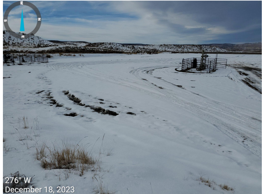
Photo 2: Photos 2-3 taken from the southeast end of the Location (Location entrance). Photos provide an overview of the Location.