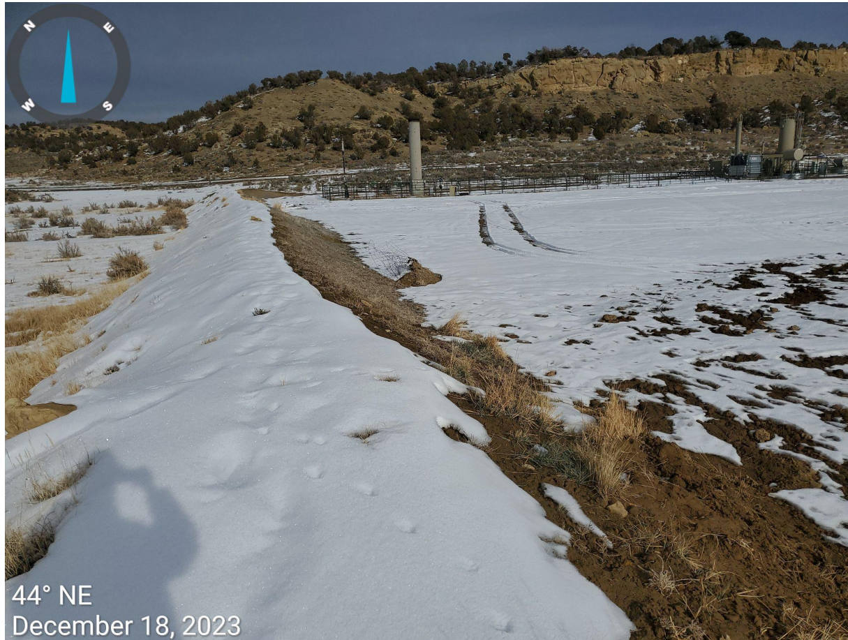
Photo 4: Photos 4-6 taken from the western corner of the current working pad surface. Photo shows areas of the Location not reasonable needed for production, requiring reclamation pursuant to Rule 1003.b. Operator is currently storing various unused equipment within these areas.