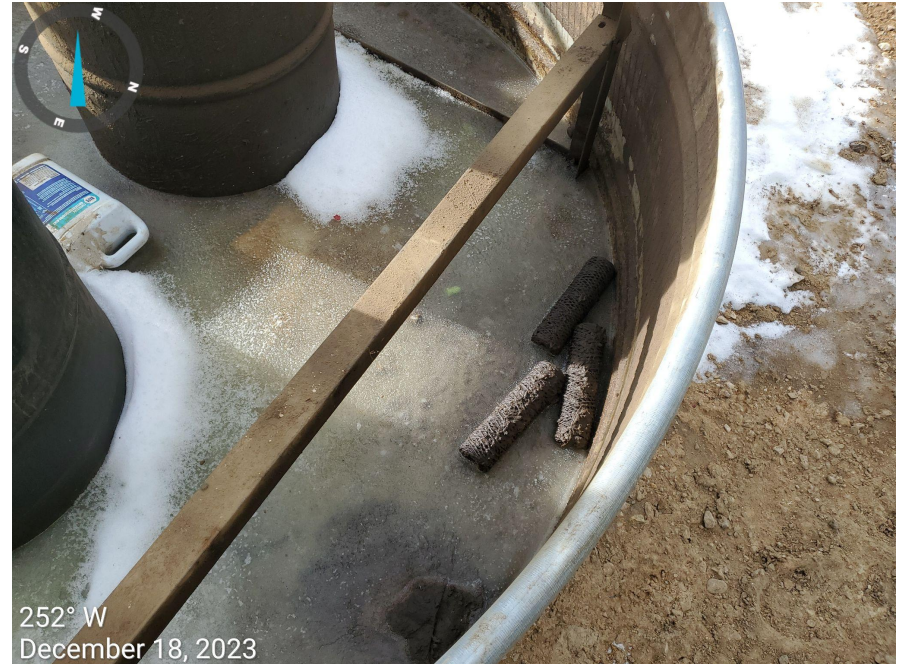
Photo 22: Various trash/debris/unused equipment/container/etc... observed improperly stored on the Location.