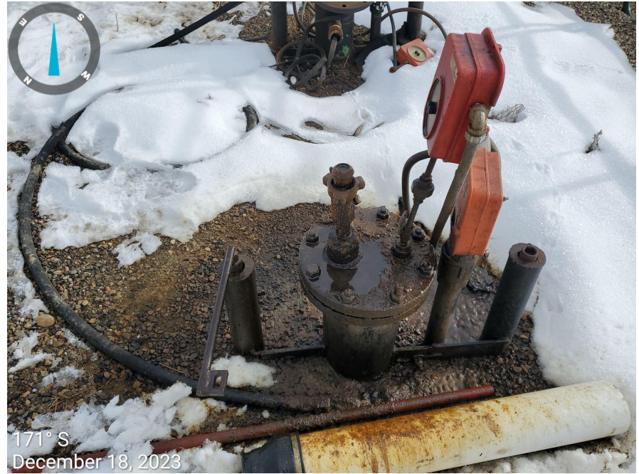
Photo 10: Photos 10-11 taken from the southern corner of the Location. Photo shows spill at the “water pump” risers.