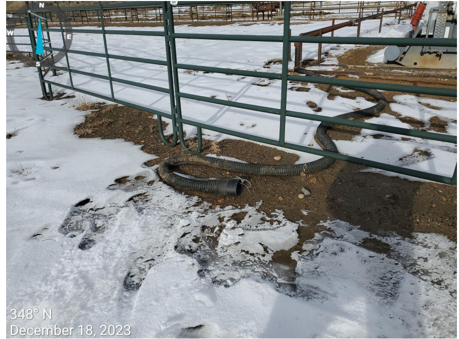
Photo 21: Various trash/debris/unused equipment/container/etc... observed improperly stored on the Location.