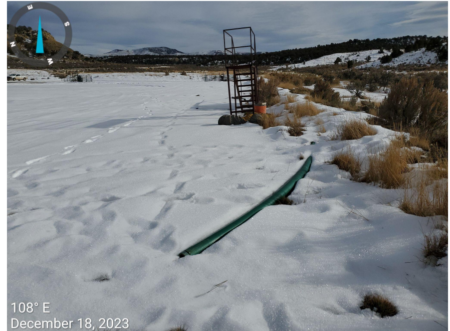
Photo 19: Various trash/debris/unused equipment/container/etc... observed improperly stored on the Location.