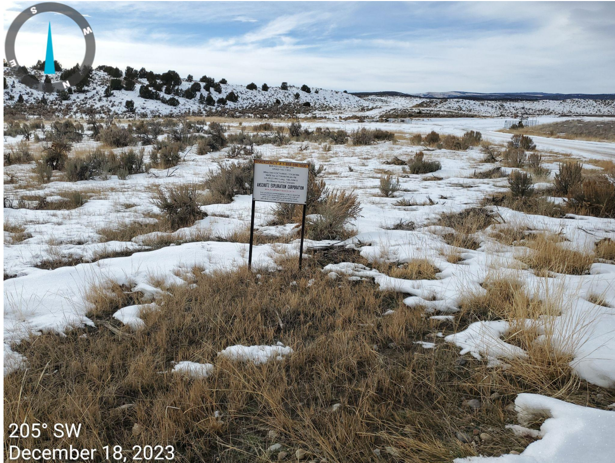
Photo 1: Photo shows Location entrance on the southeast end of the Location.