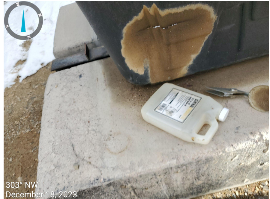
Photo 16: See comments under photo 15. Photo right also shows the containment BMP has cracked, and is no longer in proper functioning condition. Photo also example showing various trash/debris observed throughout the Location.