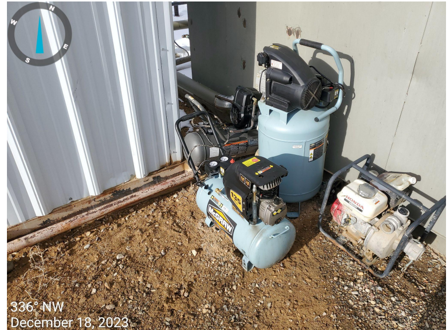
Photo 23: Various trash/debris/unused equipment/container/etc... observed improperly stored on the Location.