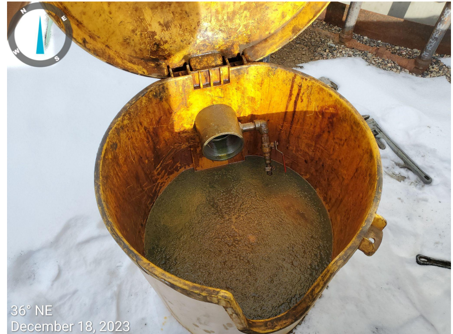
Photo 14: Photos example showing lines at tanks have not been capped/plugged. Photo also shows produced fluids have spilled into the honeypots.