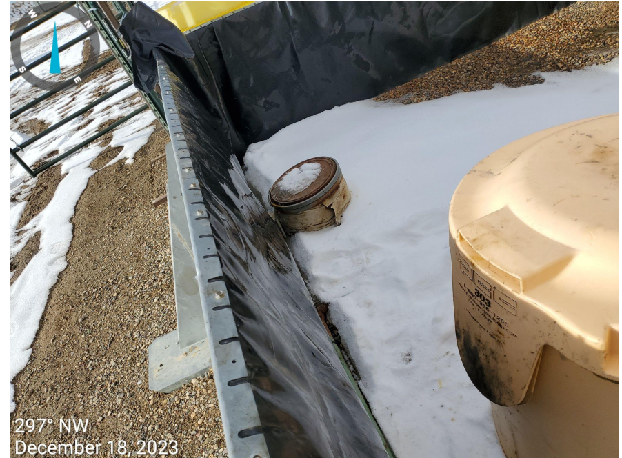
Photo 27: Various trash/debris/unused equipment/container/etc... observed improperly stored on the Location.