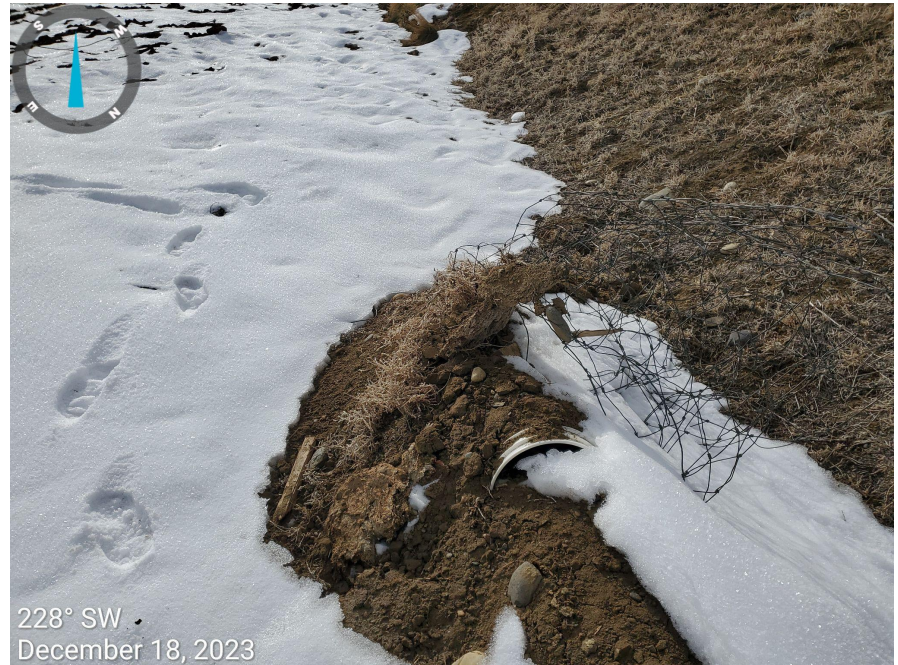
Photo 20: Various trash/debris/unused equipment/container/etc... observed improperly stored on the Location.