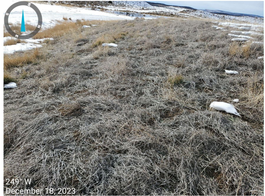
Photo 17: Photos taken from the topsoil stockpile on the east end of the Location. Vegetation observed established on the stockpile is predominantly Undesirable Plant Species. BMPs to prevent the spread or establishment of weeds are inadequate.