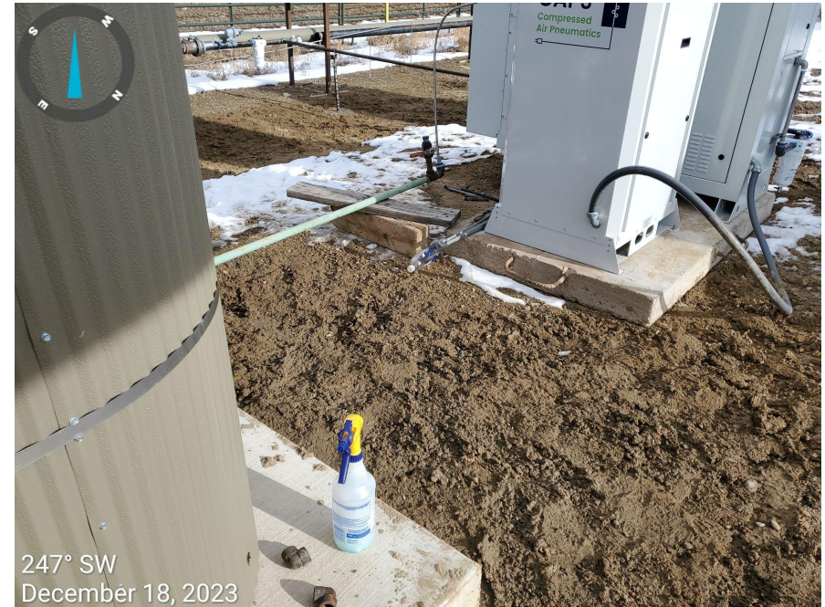
Photo 24: Various trash/debris/unused equipment/container/etc... observed improperly stored on the Location.