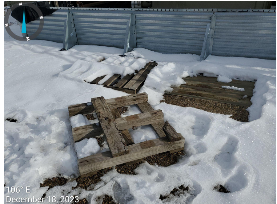
Photo 26: Various trash/debris/unused equipment/container/etc... observed improperly stored on the Location.