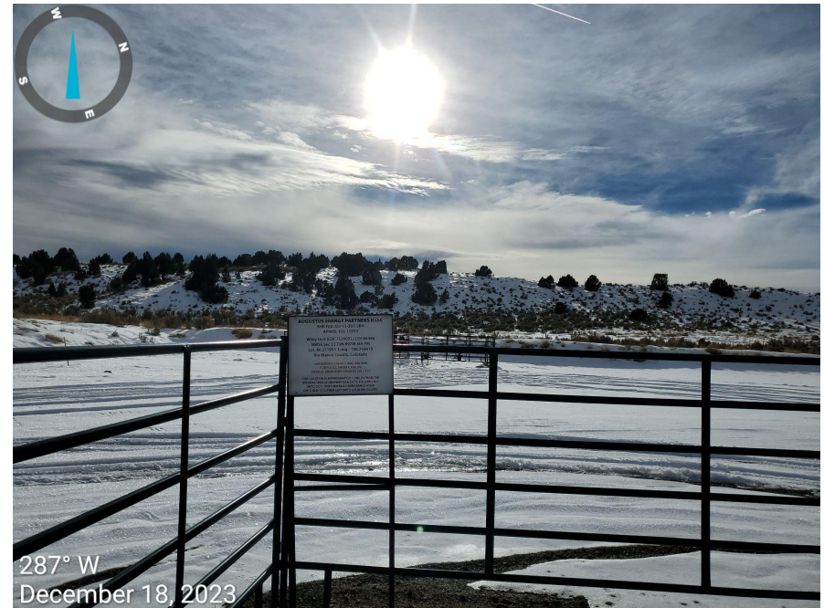
Photo 9: Photos show incorrect Operator information at tank battery and wellhead sign.