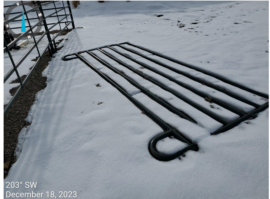
Photo 18: Various trash/debris/unused equipment/container/etc... observed improperly stored on the Location.