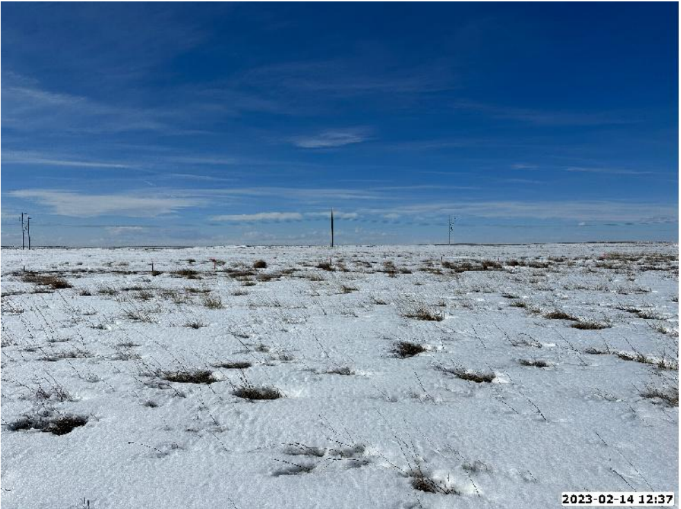
LOCATION PICTURE OF ROAN ANGEL 5-23HZ WELL PAD - CAMERA VIEW WEST

K:\ANDAKO\2017\2017_197_CERVO_RANCH_T4N_R63W\DWG\08_ROAN_ANGEL.dwg, 3/8/2023 11:58:10 AM, seven