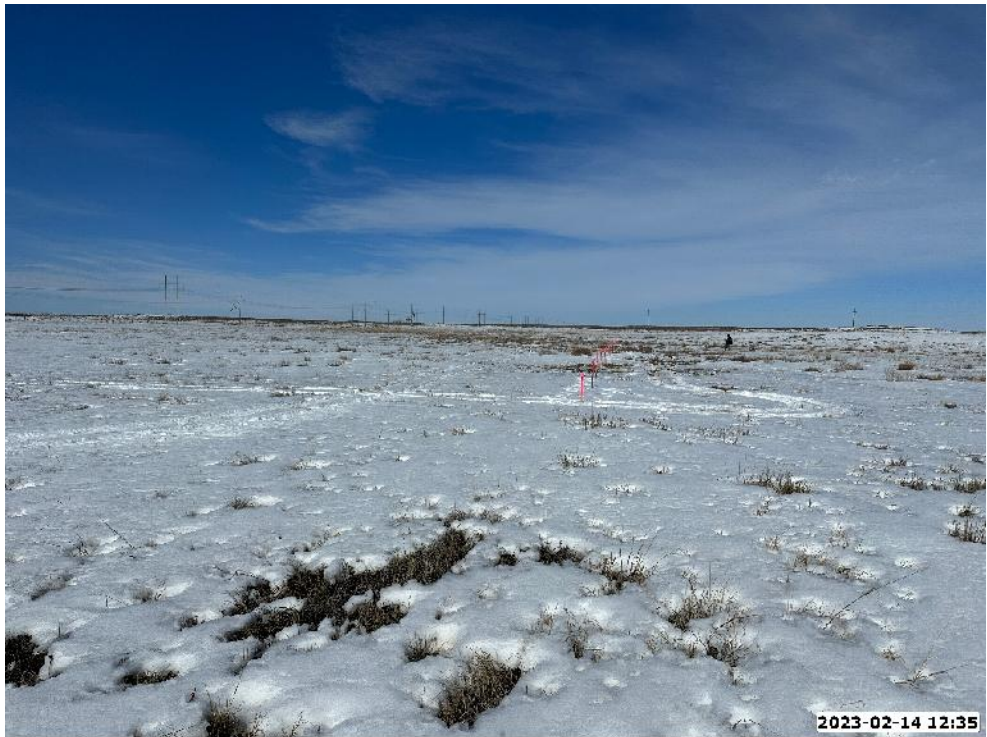
LOCATION PICTURE OF ROAN ANGEL 5-23HZ WELL PAD - CAMERA VIEW NORTH

W1/2 NW1/4 SECTION 23, TOWNSHIP 3 NORTH, RANGE 63 WEST, 6TH P.M. WELD COUNTY, COLORADO