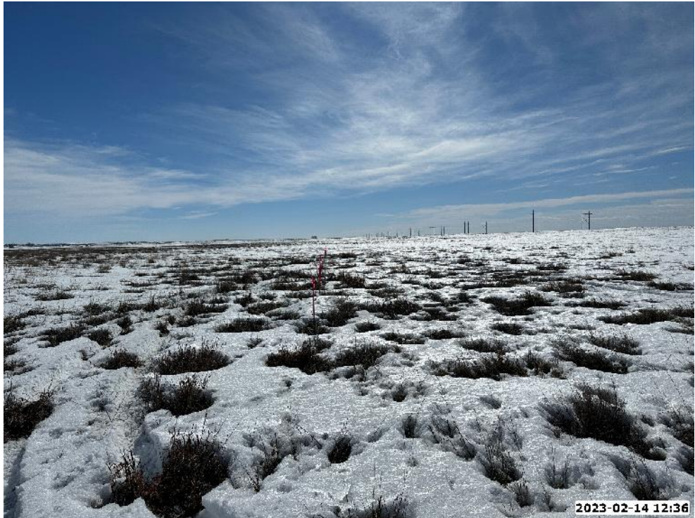
LOCATION PICTURE OF ROAN ANGEL 5-23HZ WELL PAD - CAMERA VIEW SOUTH