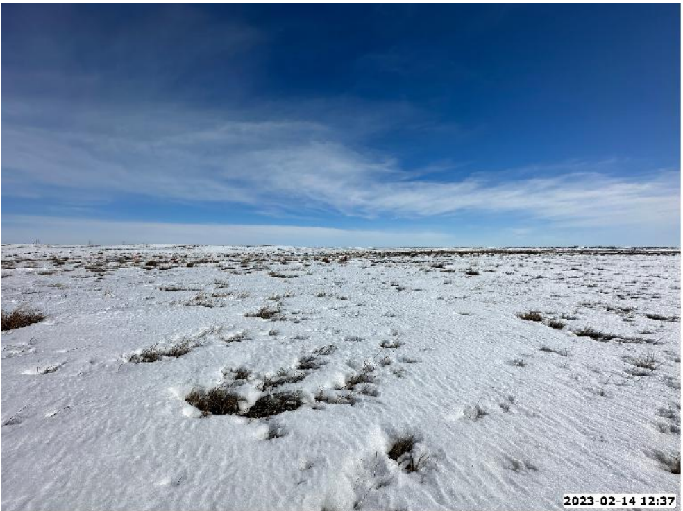
LOCATION PICTURE OF ROAN ANGEL 5-23HZ WELL PAD - CAMERA VIEW EAST