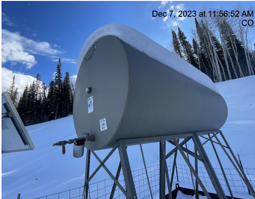
Photo # 8777 Methanol tank improperly labeled/lacks required information/has inaccurate information