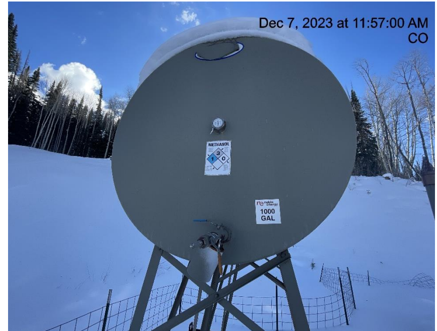
Photo # 8778 Methanol tank improperly labeled/lacks required information/has inaccurate information