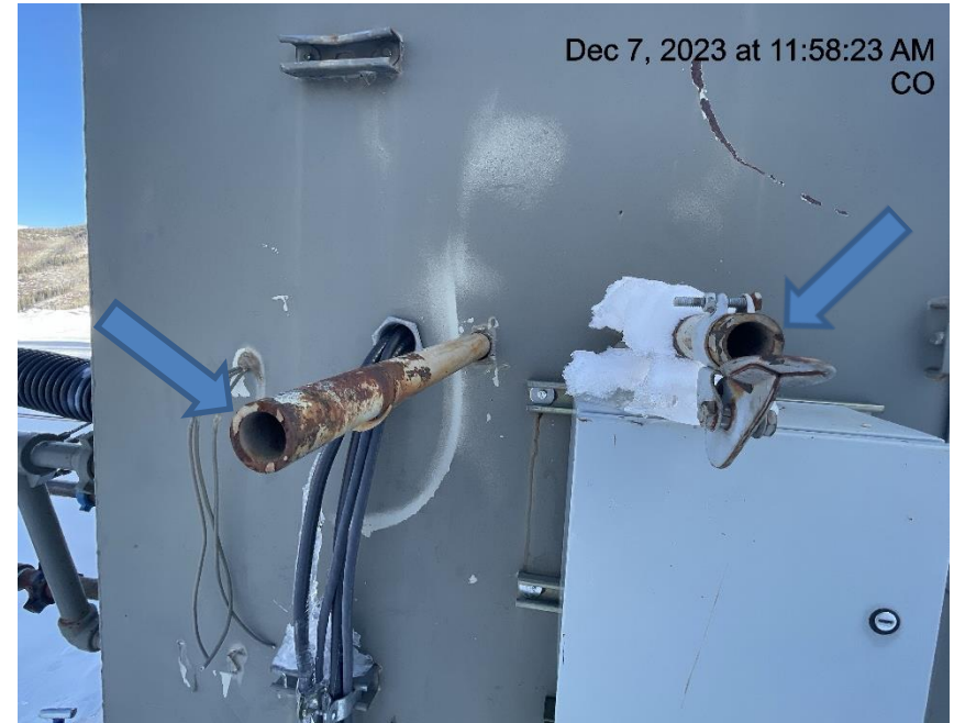
Photo # 8784 PRV & rupture disc vent lines terminate in an unsafe manner