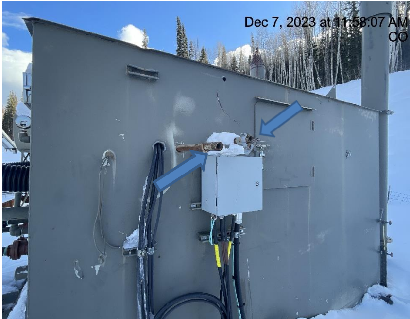
Photo # 8783 PRV & rupture disc vent lines terminate in an unsafe manner