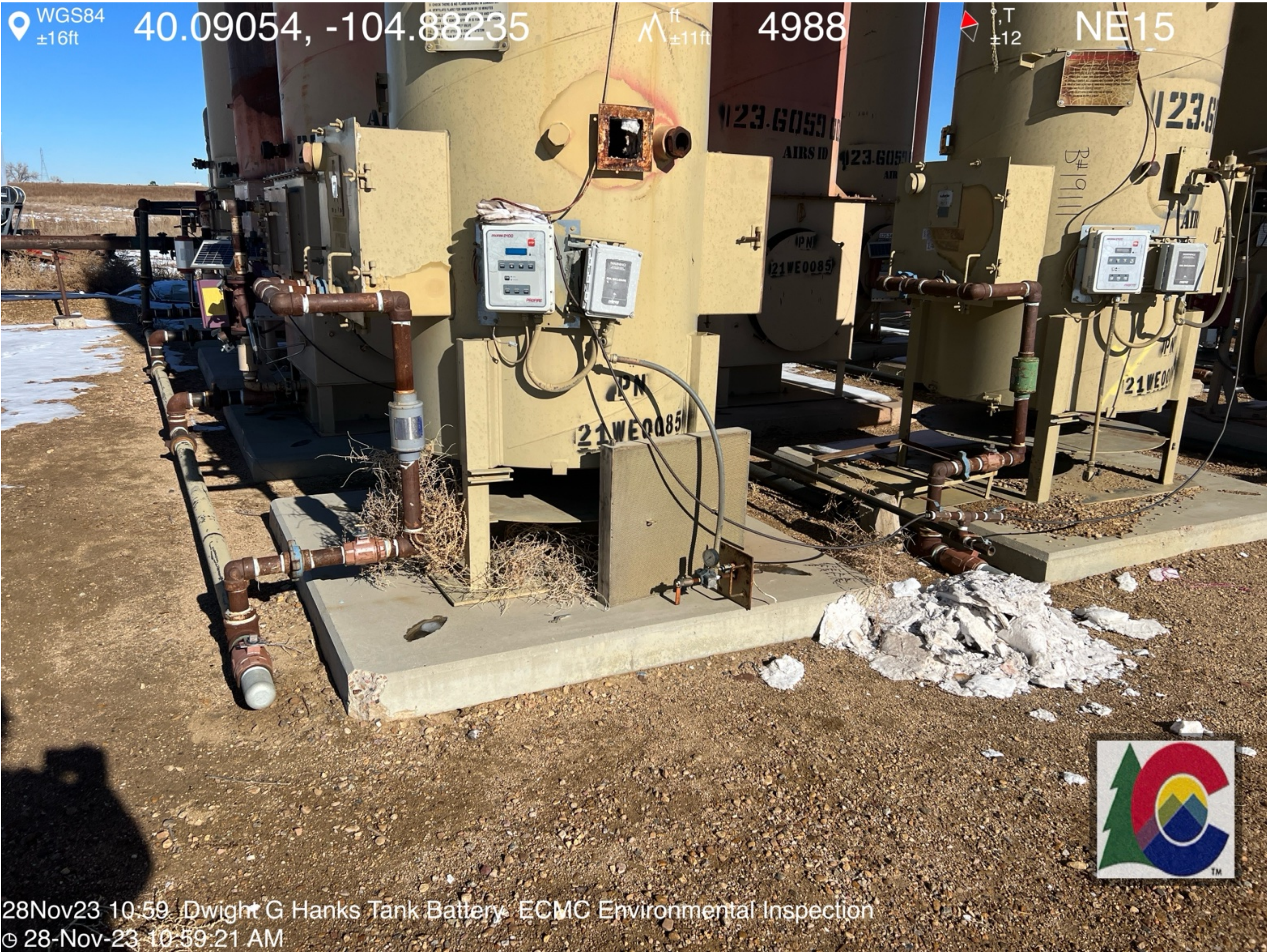
28Nov23 10:59 Dwight G Hanks Tank Battery- ECMC Environmental Inspection © 28-Nov-23 10:59:21 AM