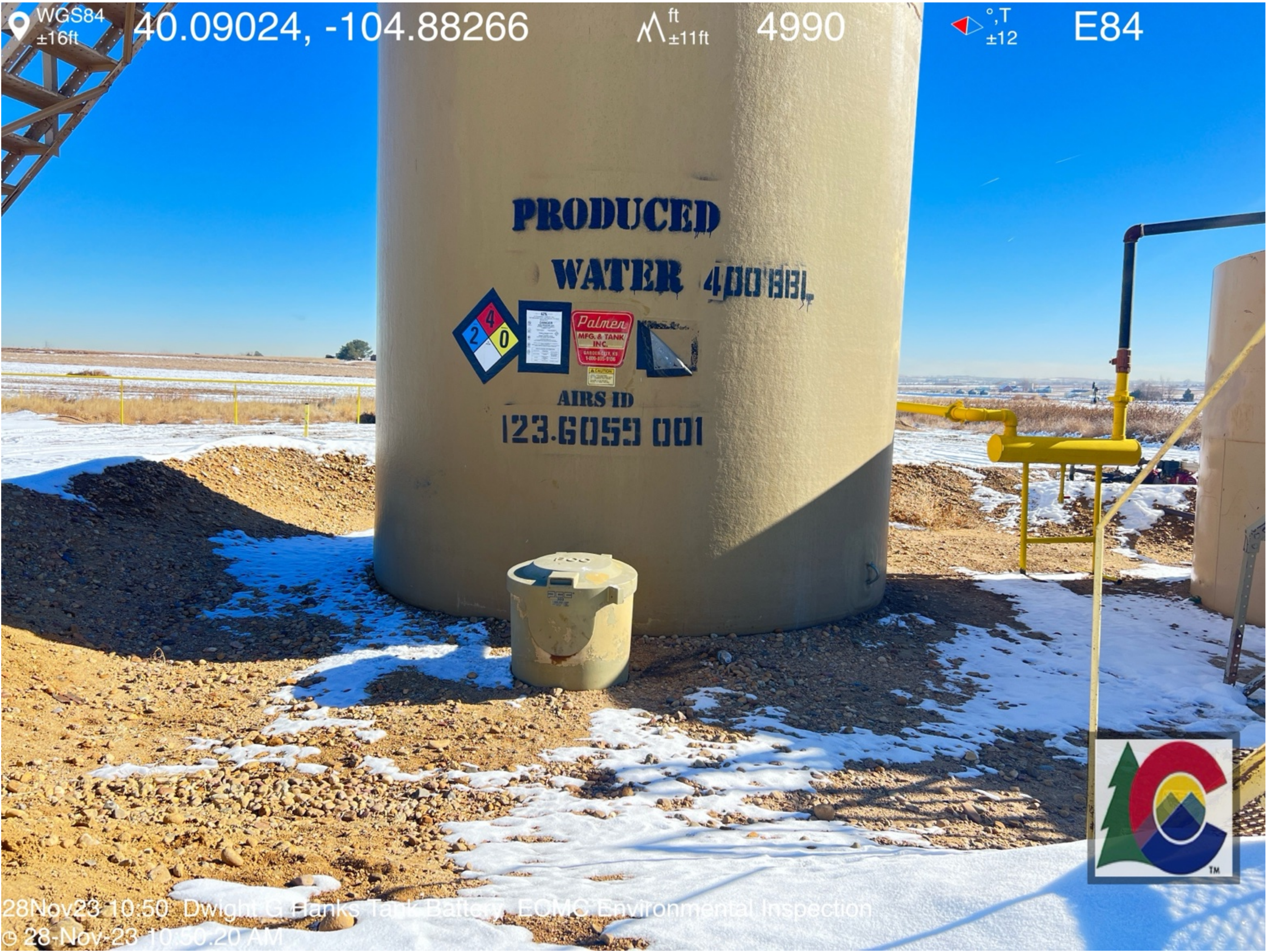
28Nov23 10:50 Dwight G Banks Tank Battery EOMC Environmental Inspection © 28-Nov-23 10:50:20 AM