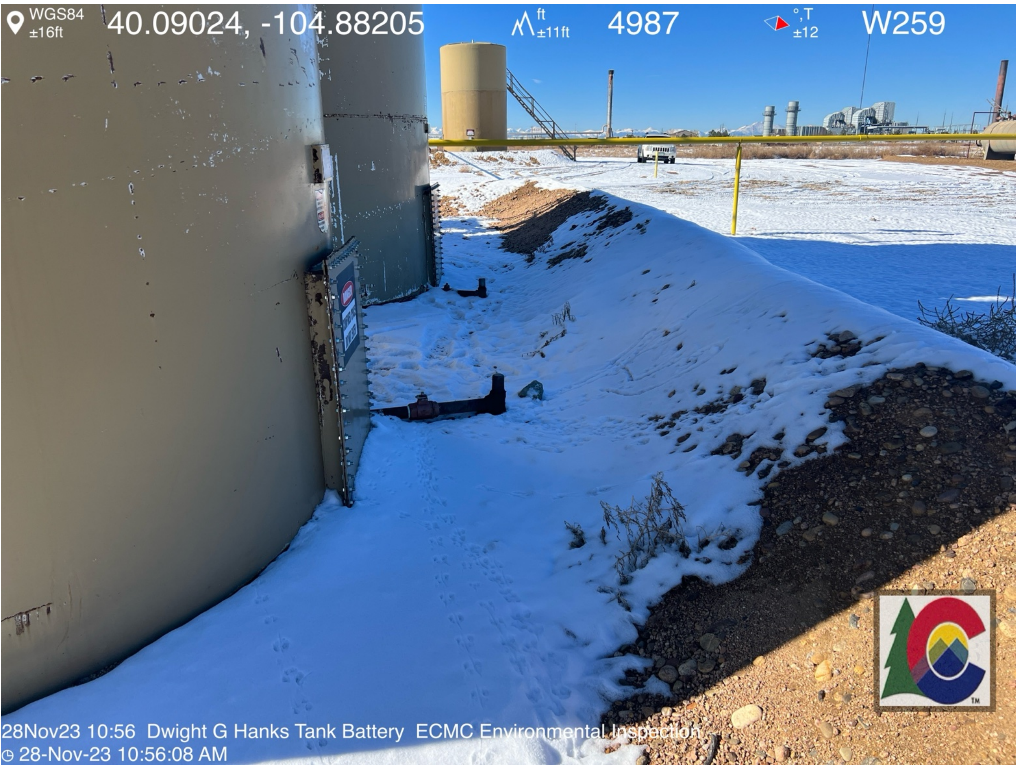
28Nov23 10:56 Dwight G Hanks Tank Battery ECMC Environmental Inspection © 28-Nov-23 10:56:08 AM