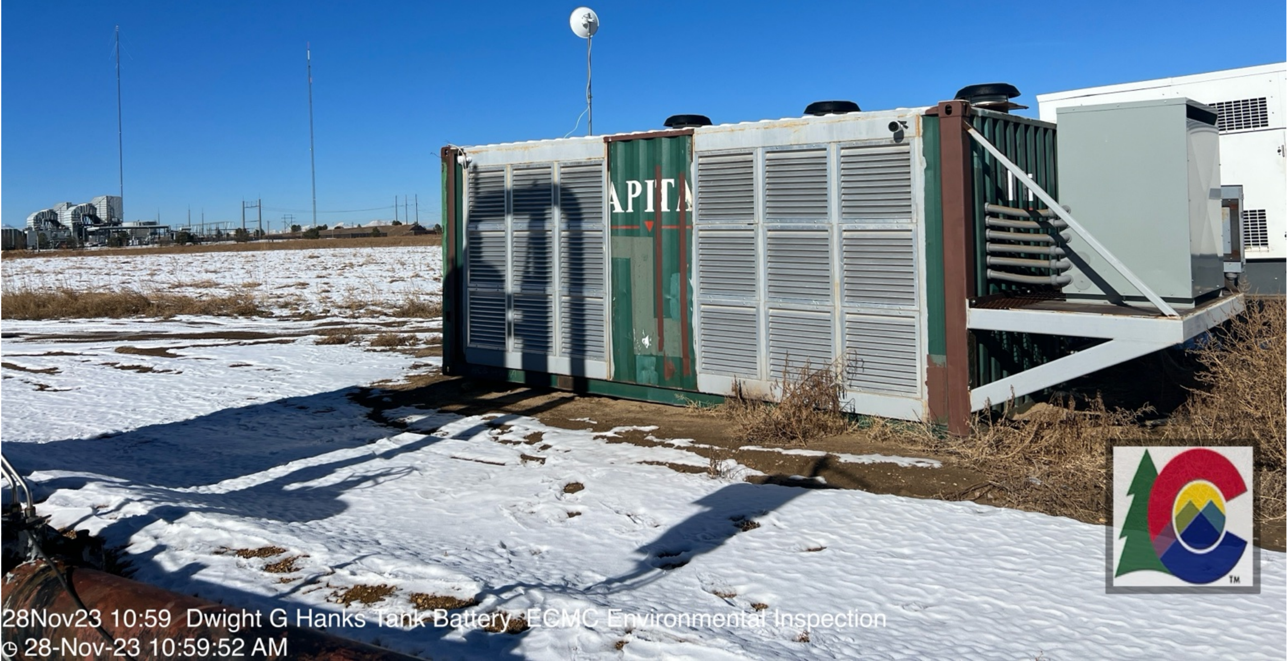
28Nov23 10:59 Dwight G Hanks Tank Battery ECMC Environmental Inspection © 28-Nov-23 10:59:52 AM