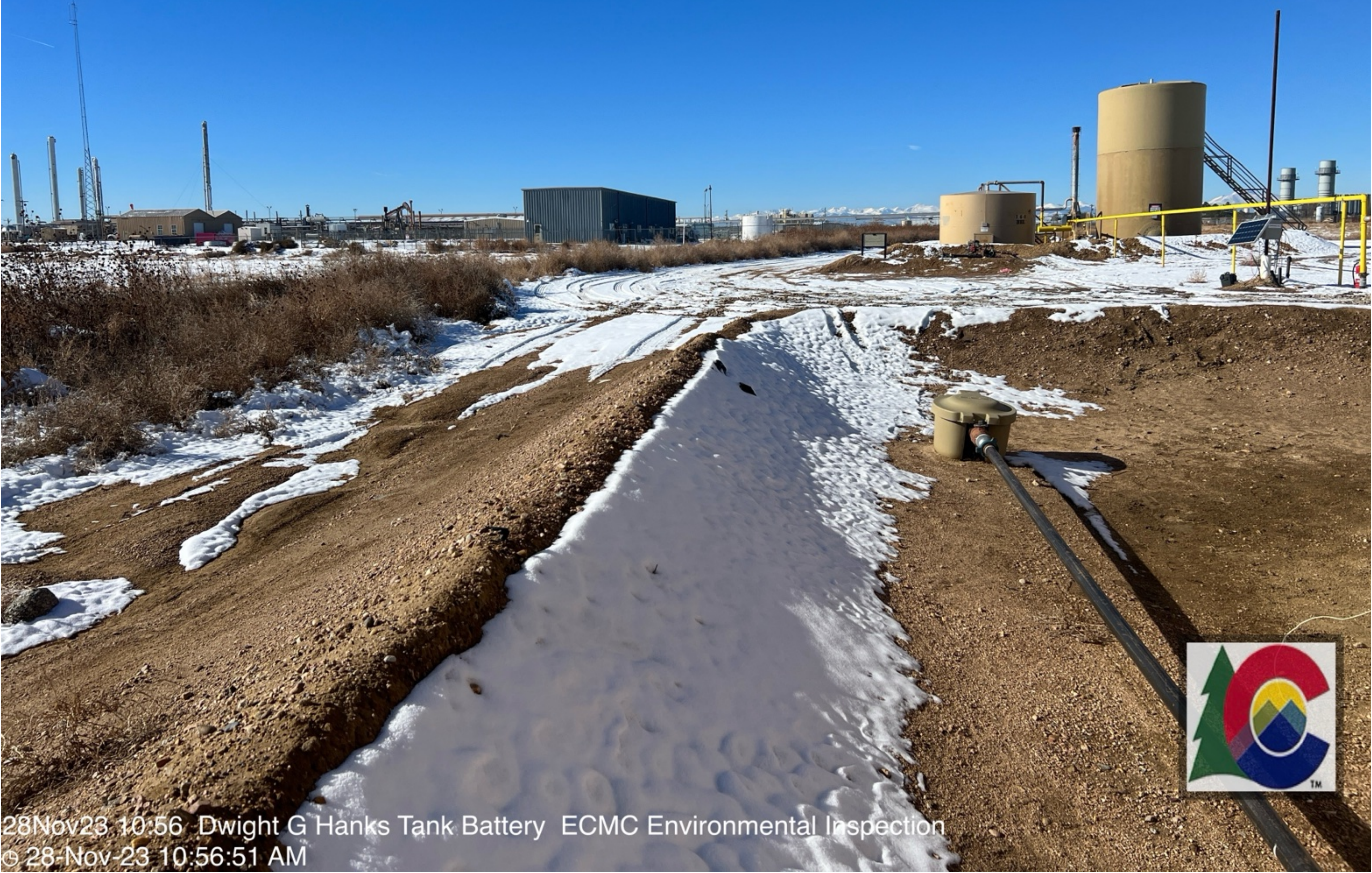
28Nov23 10:56 Dwight G Hanks Tank Battery ECMC Environmental Inspection © 28-Nov-23 10:56:51 AM