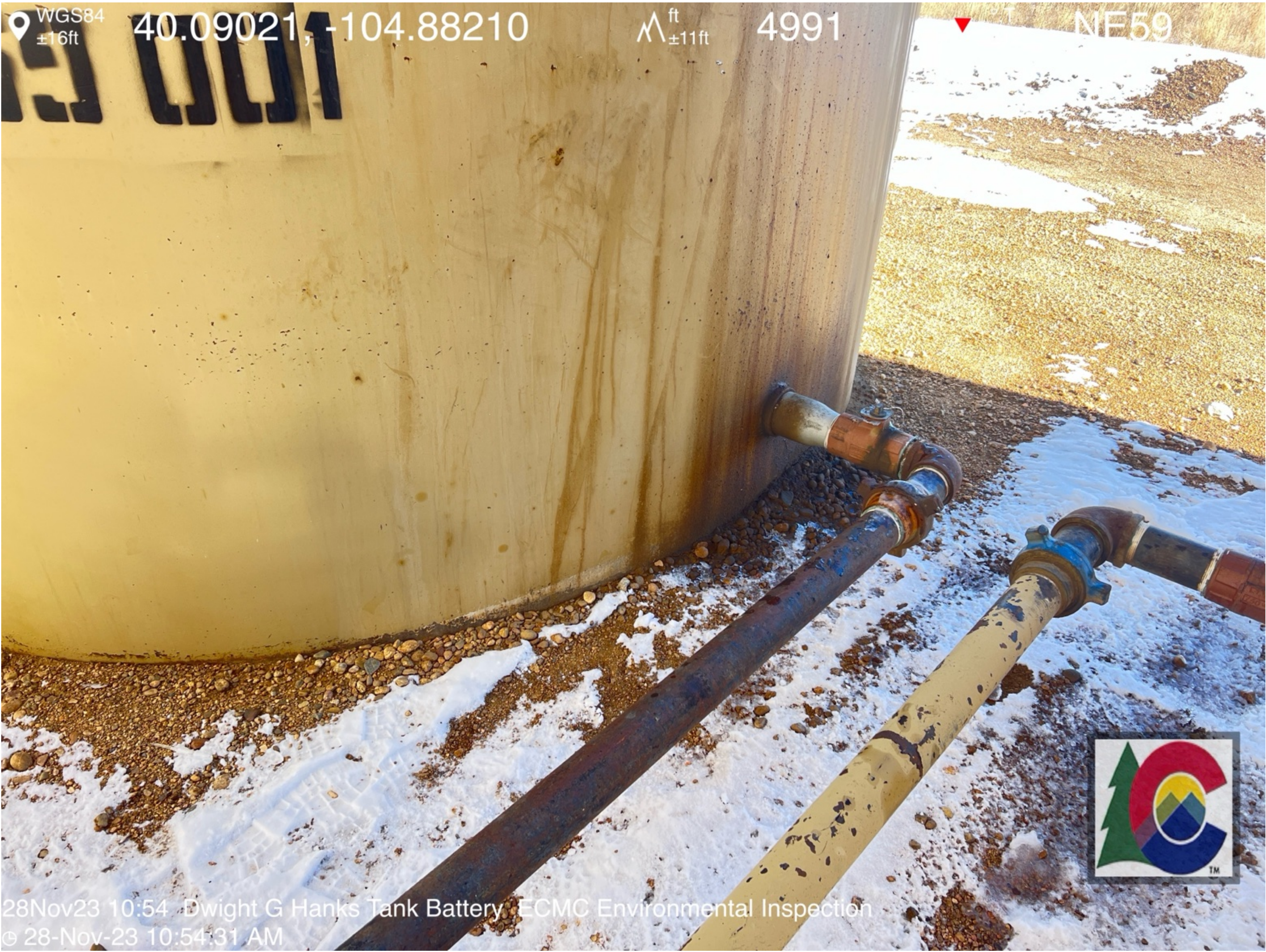
28Nov23 10:54 Dwight G Hanks Tank Battery ECMC Environmental Inspection © 28-Nov-23 10:54:31 AM