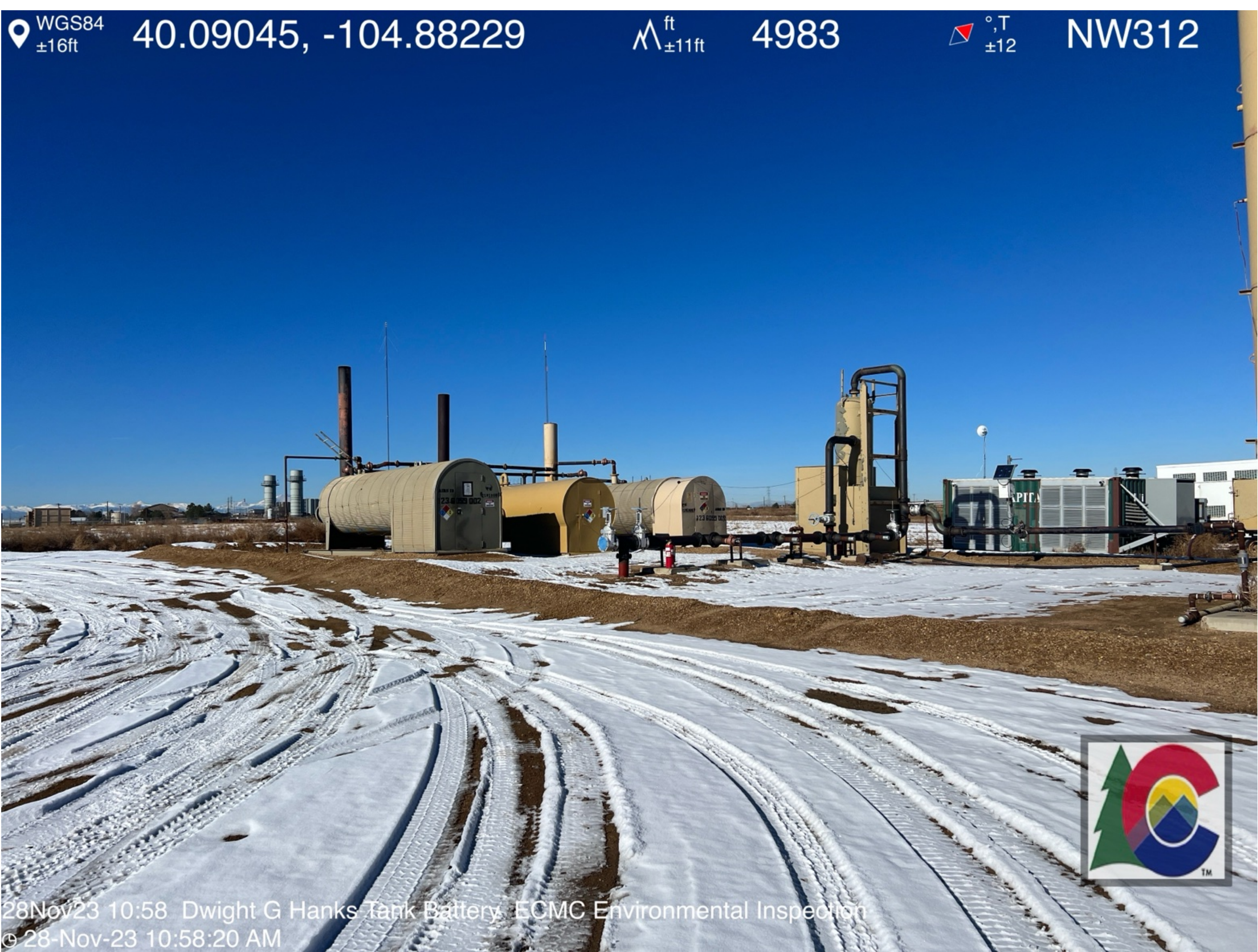
28Nov23 10:58 Dwight G Hanks Tank Battery ECMC Environmental Inspection © 28-Nov-23 10:58:20 AM