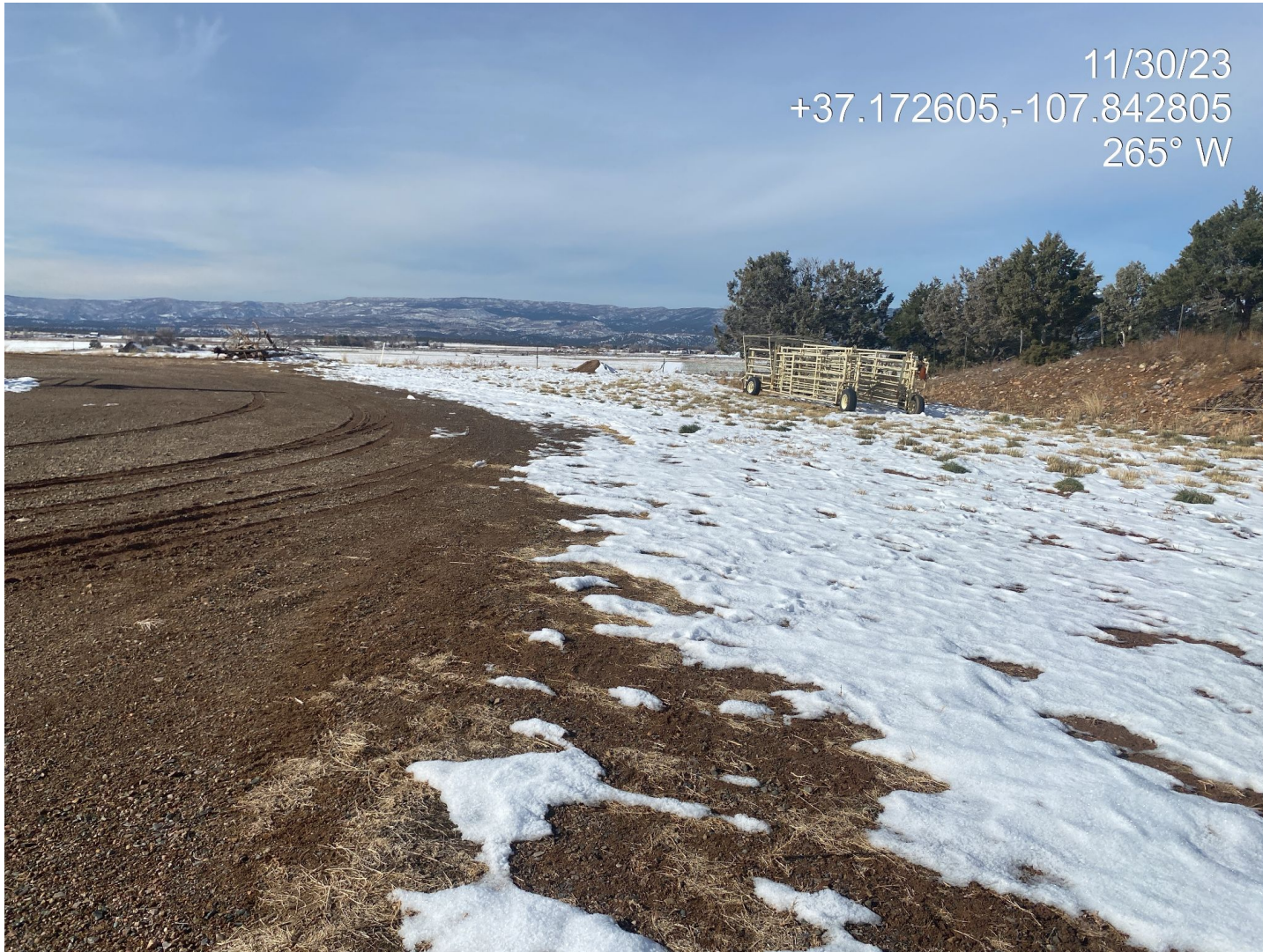
Photo 5. Interim vegetation was not fully assessed due to snowy conditions.