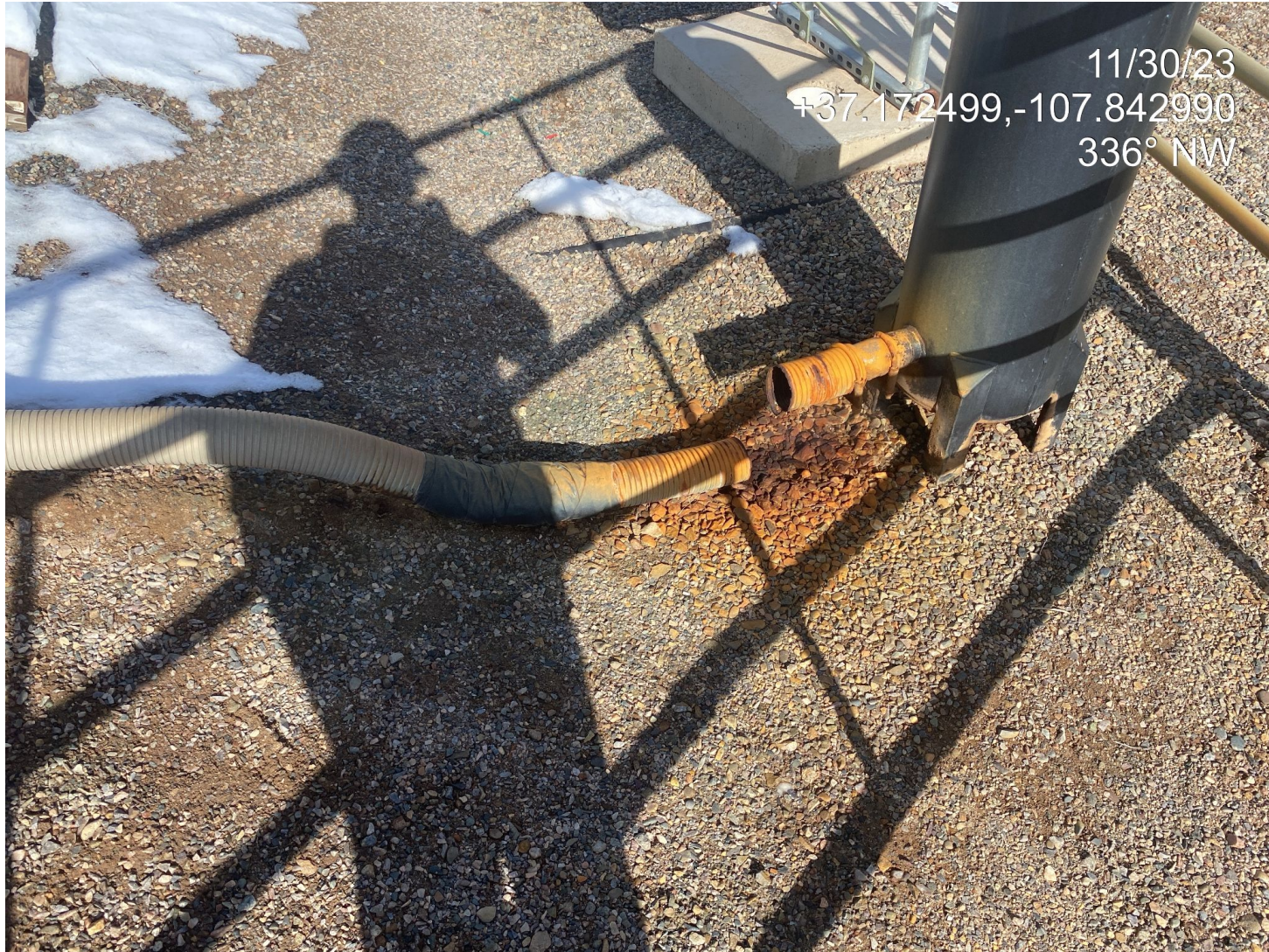
Photo 4. View of impacted soils observed on location.