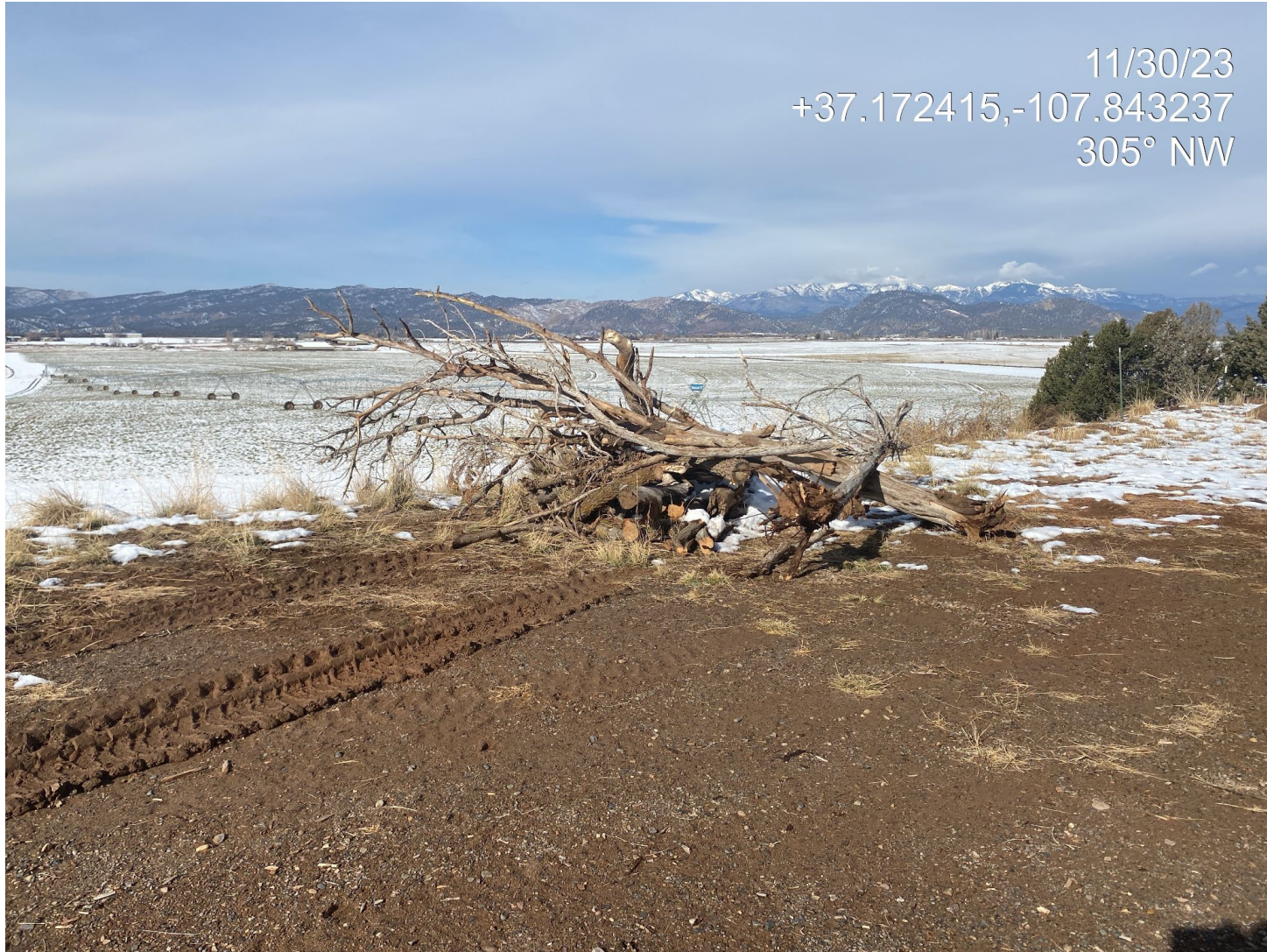
Photo 3. Pile of wood debris observed on the western edge of the disturbance.