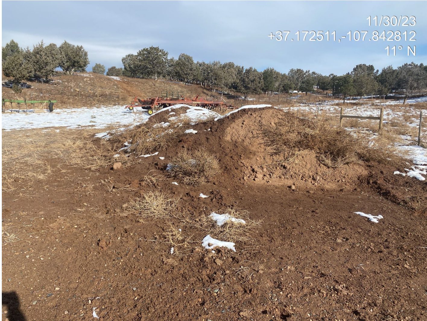
Photo 2. Pile of soil observed in the northern portion of the disturbance. This is considered debris and needs to be removed.