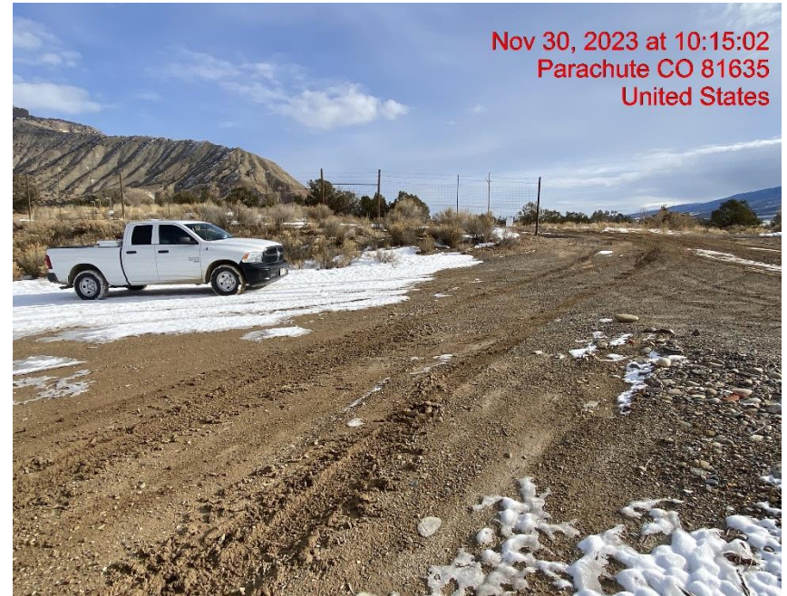
Insufficient Vehicle Tracking BMPs at Location Entrance/Exit – Photo #07780