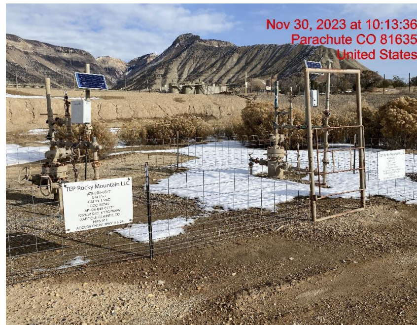
Wellheads – Photo #07776