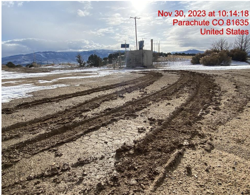
Lack of Stabilization – Photo #07778