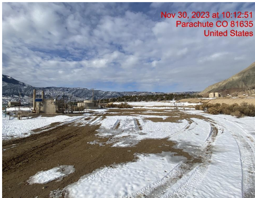
Location Entrance – Photo #07775