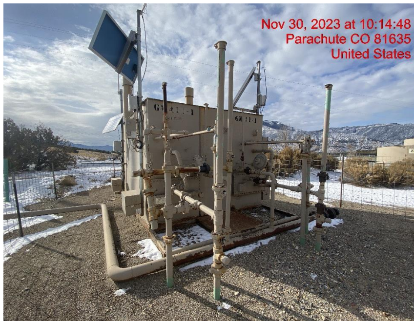
Separators – Photo #07779