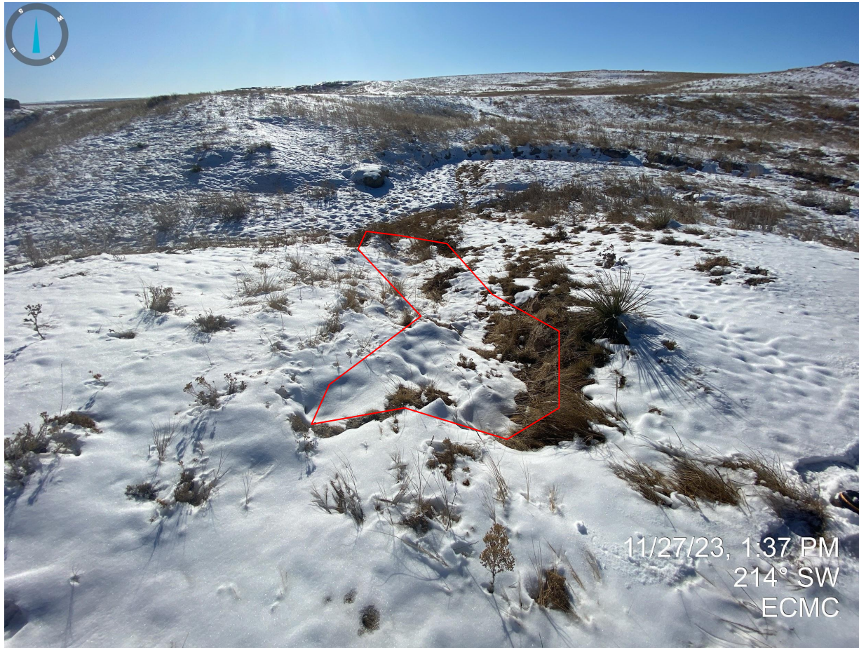
Photo 3. Erosion degradation (e.g. gullyng) evident on the southwestern portion of the production areas. No apparent stormwater control measures/BMPs observed at the time of this inspection.