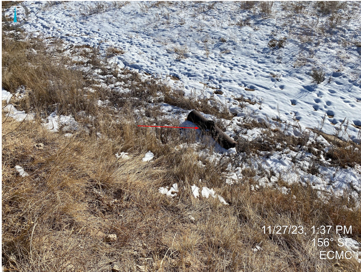
Photo 6. Debris (pipe) observed on the southern portion of the location.