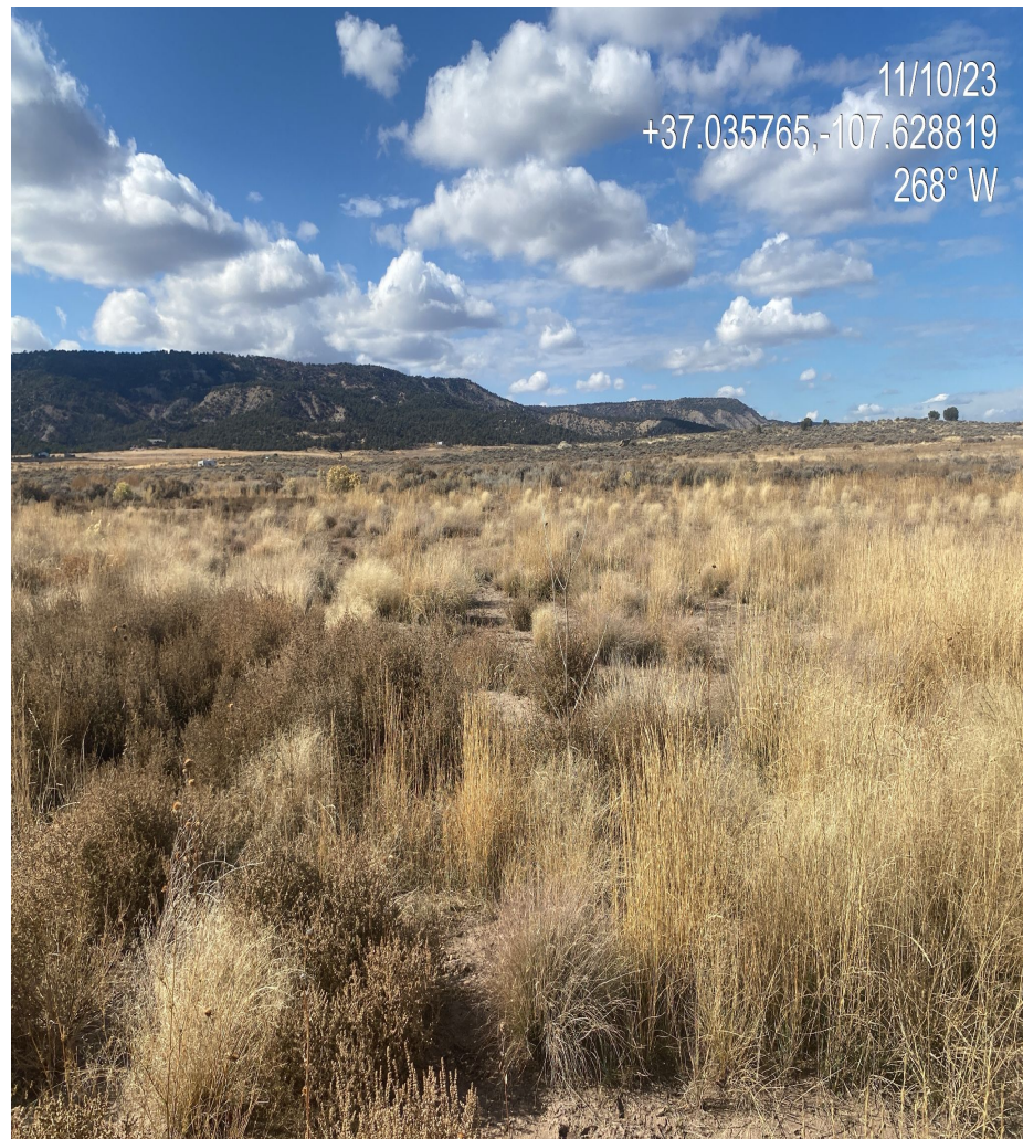
Photo 3. Cardinal photos taken from the middle of the project area. left photo facing south, right photo facing west.