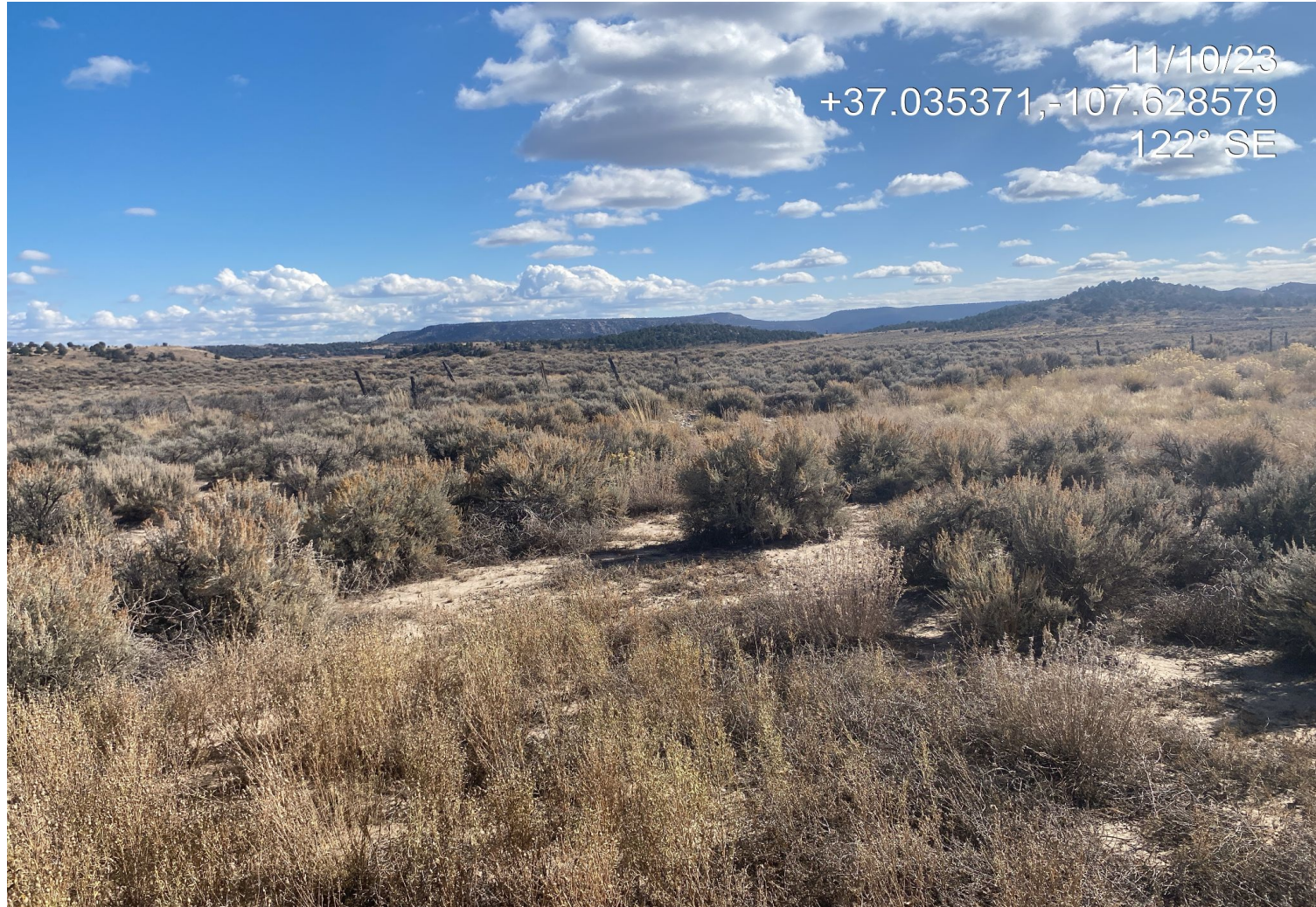
Photo 5. Reference area comprised of sagebrush, rabbit brush and squirrel tail.

Inspection Photos Location Name: WIRT D 1E Location ID: 325407