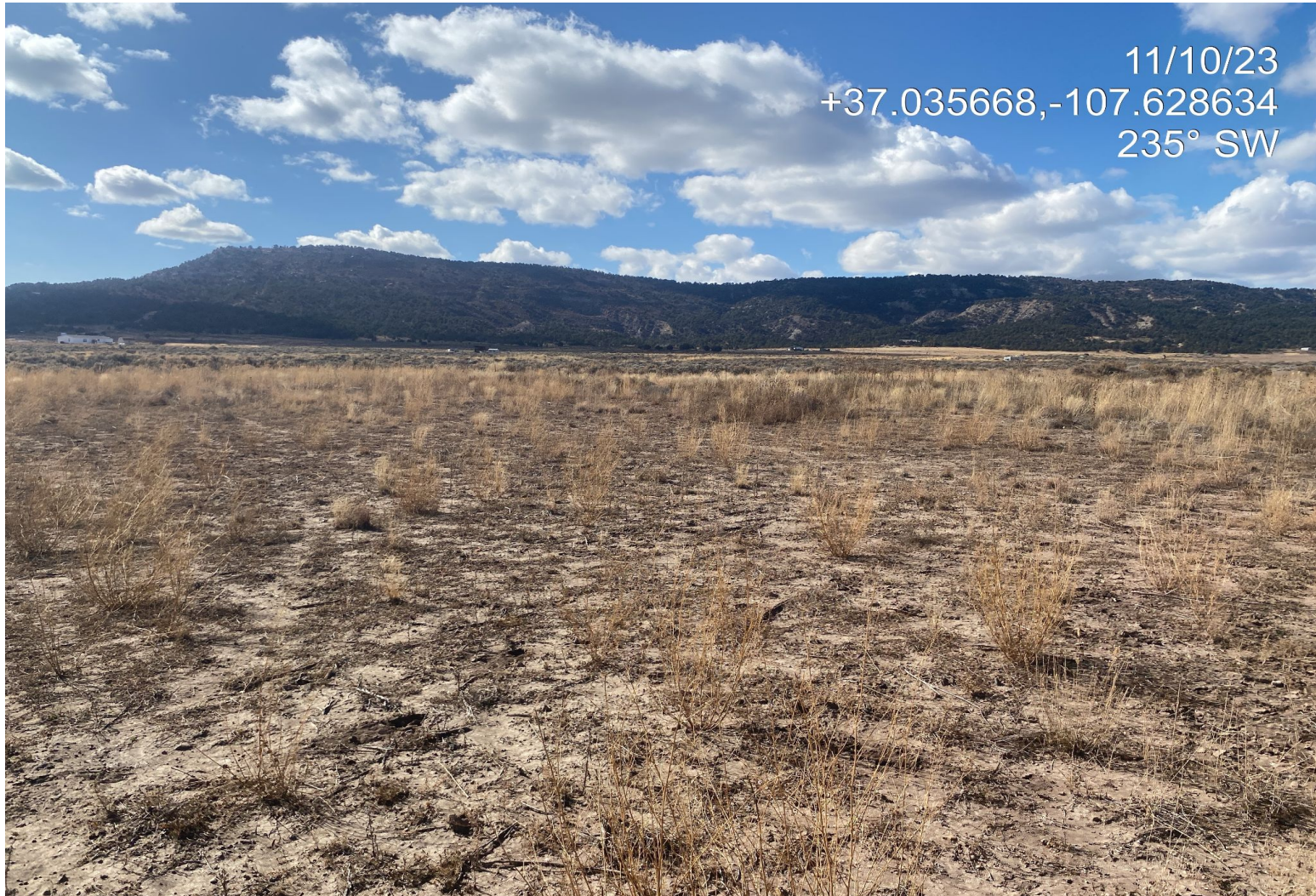
Photo 4. View of bare ground lacking vegetation in the southern portion of the project area that needs additional reclamation.

Inspection Photos Location Name: WIRT D 1E Location ID: 325407