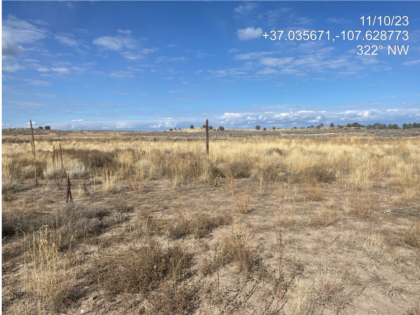
Photo 1. View of the project area taken from the entrance facing center.