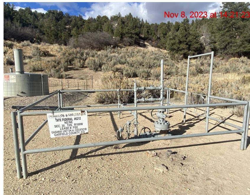
Wellhead – Photo #07394