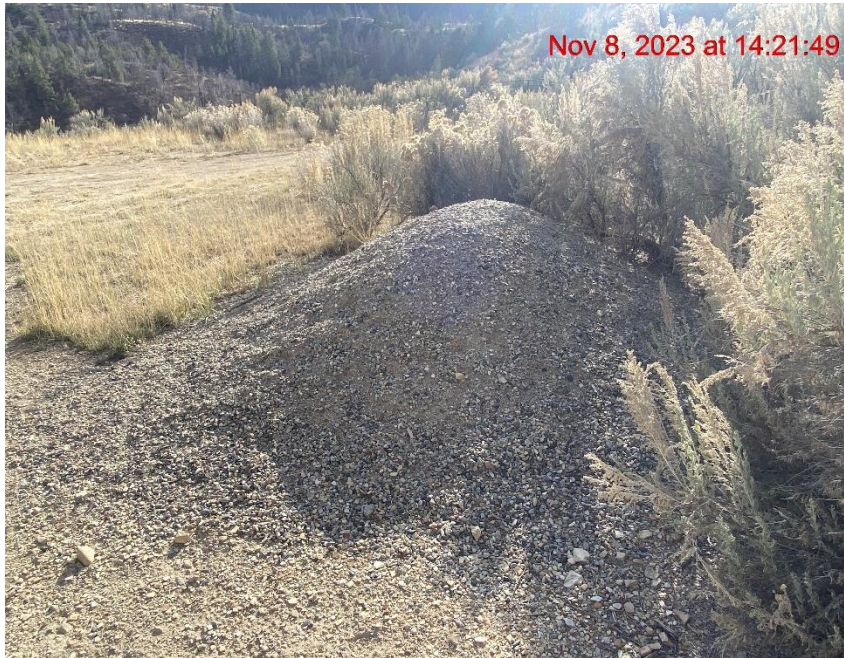
Unprotected Soil Stockpile – Photo #07396