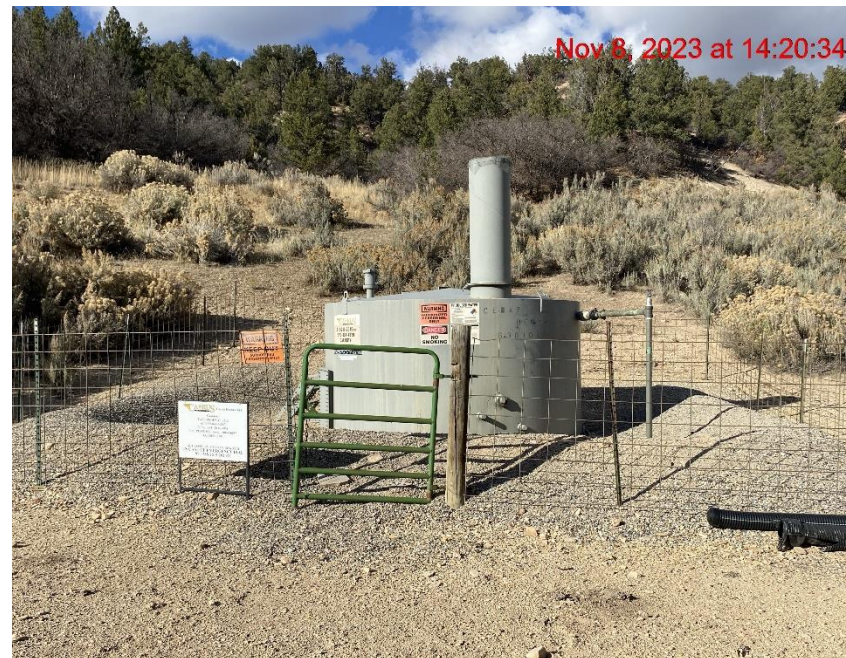
Tank Battery – Photo #07392