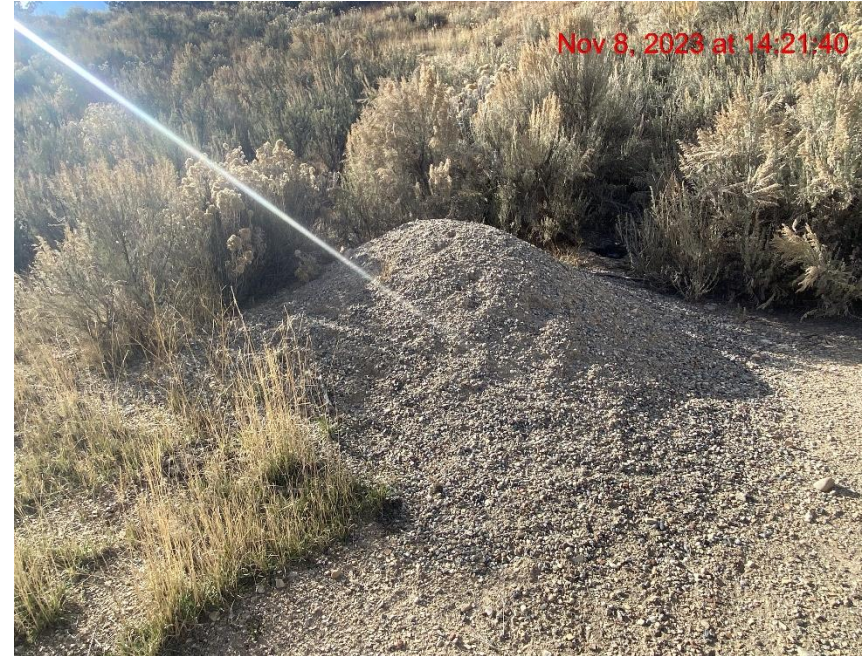
Unprotected Soil Stockpile – Photo #07395