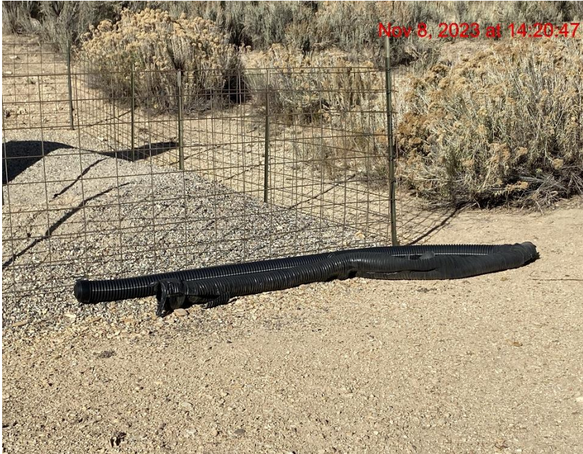
Debris – Photo #07393