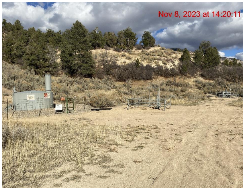
Location Entrance – Photo #07391