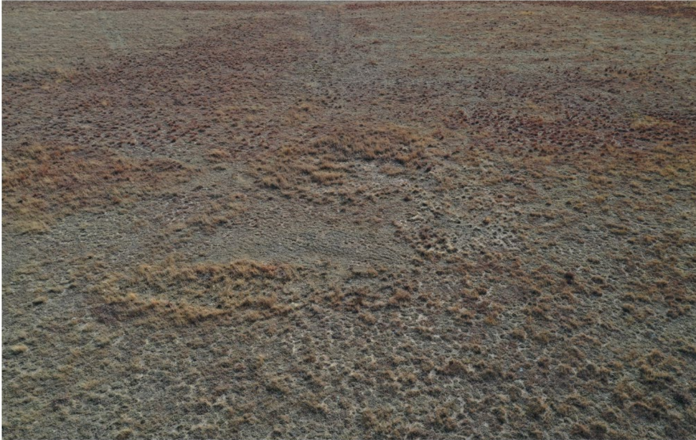
Photo 6. Drone image facing south at the plugged and abandoned wellsite. All equipment has been removed at the well site and the vegetation has re-established.