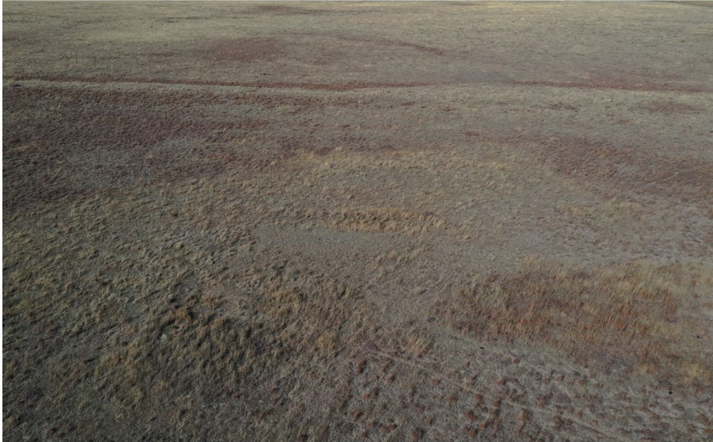
Photo 5. Drone image facing north at the plugged and abandoned wellsite. All equipment has been removed at the well site and the vegetation has re-established.