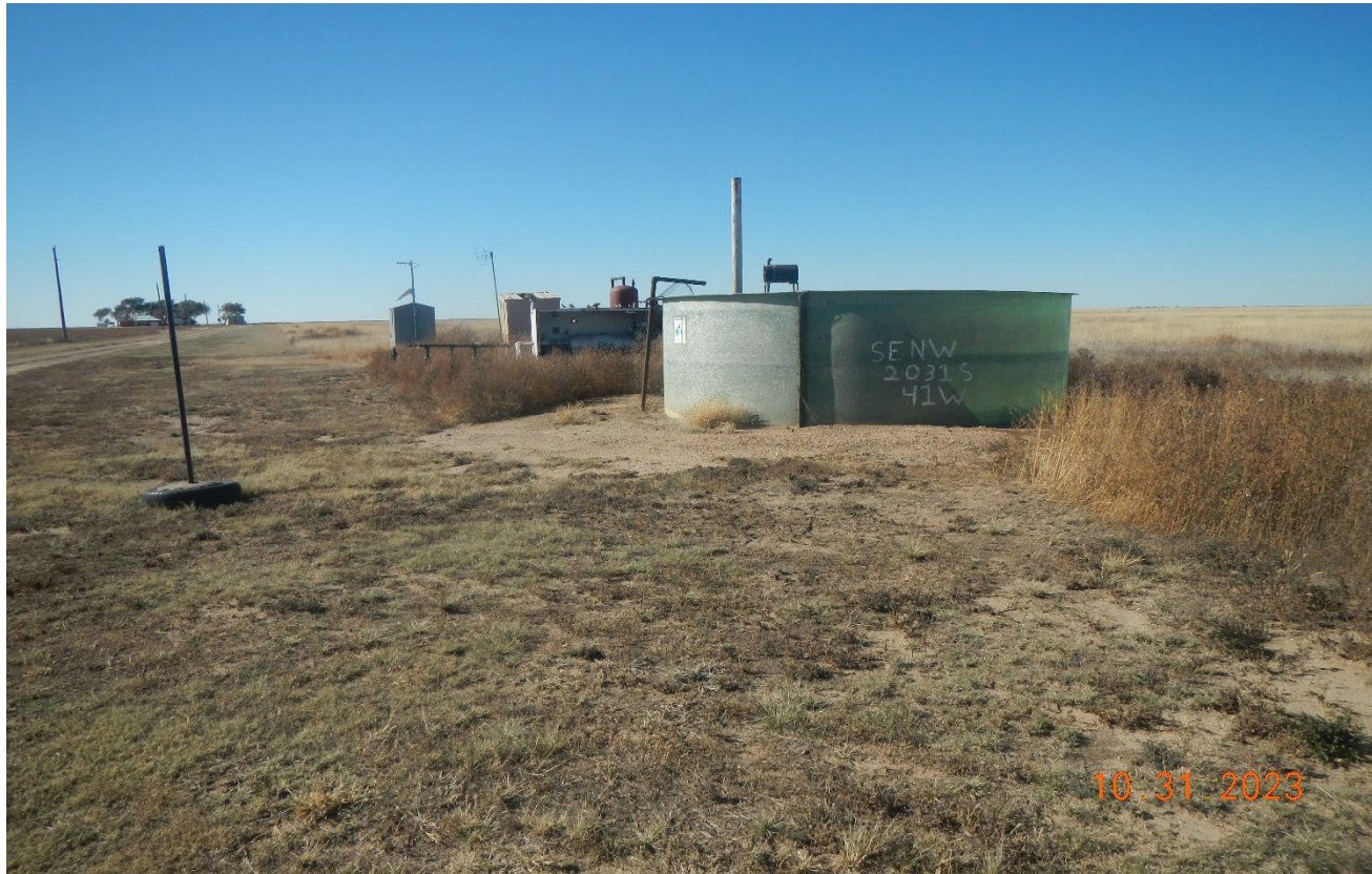
Photo 1. Facing toward offsite facility at Lat/Long:37.33139, -102.06825.