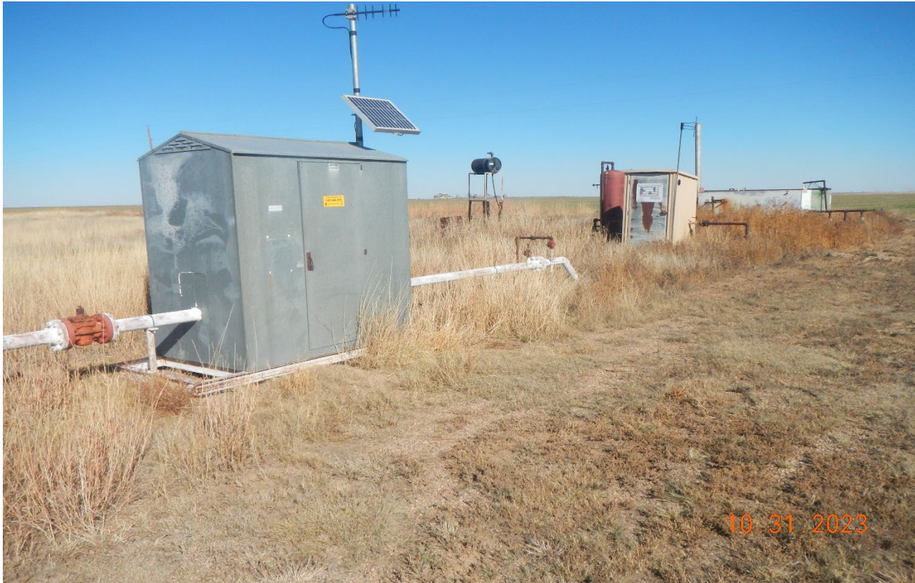
Photo 4. Facing northeast at the offsite meter facility Lat/Long: 37.33139, -102.06825.