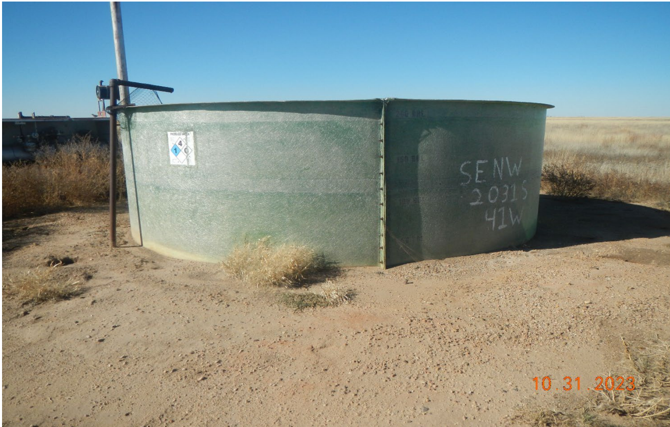
Photo 2. The open top tank does not have secondary containment or proper labeling..