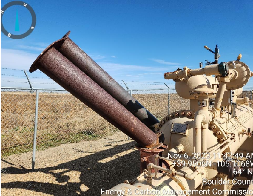
Photo 3 separator stack