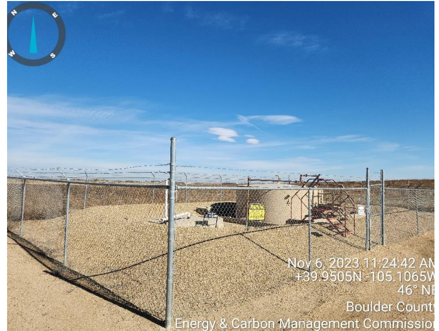
Photo 6 tank battery