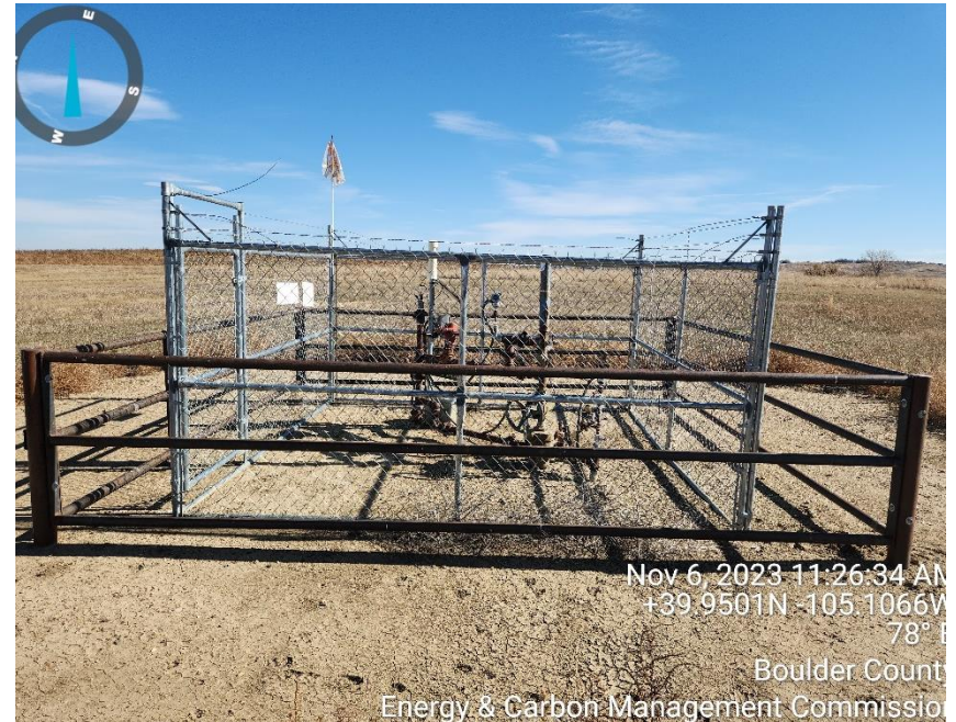
Photo 2 well head and equipment