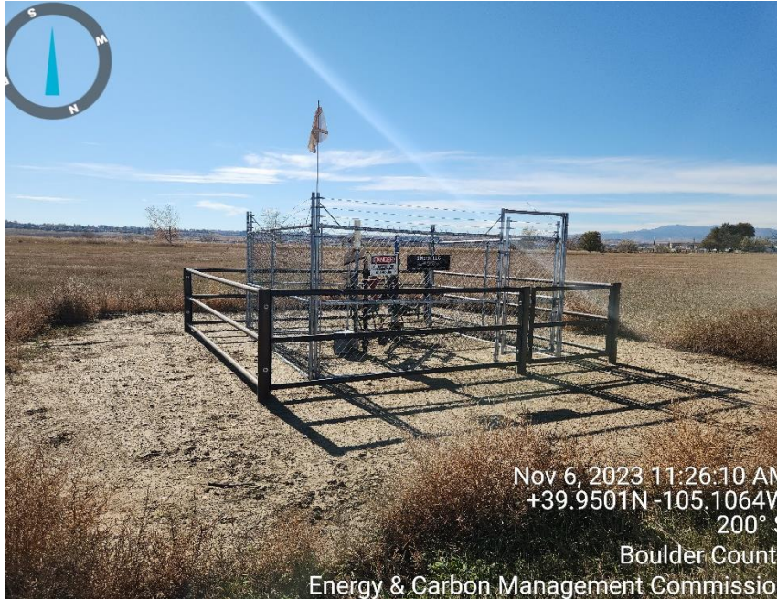
Photo 1 well head and equipment