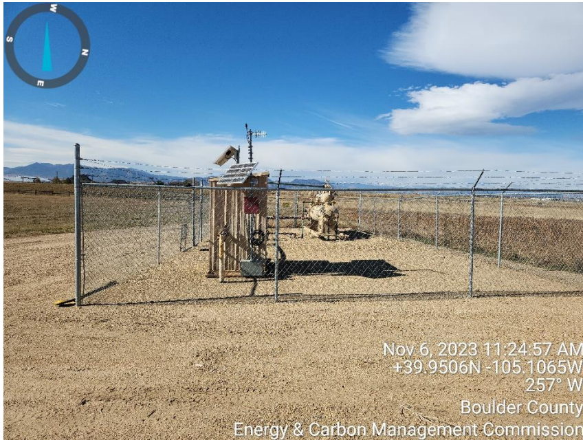
Photo 5 production equipment