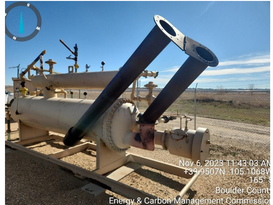
Photo 4 separator stack