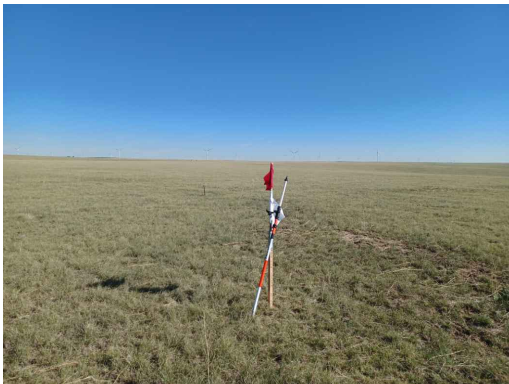
WELL LOCATION LOOKING NORTH 7/9/2022