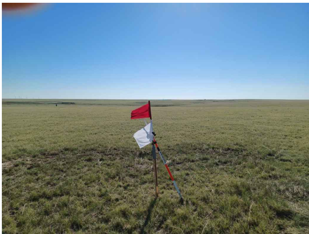
WELL LOCATION LOOKING EAST 7/9/2022