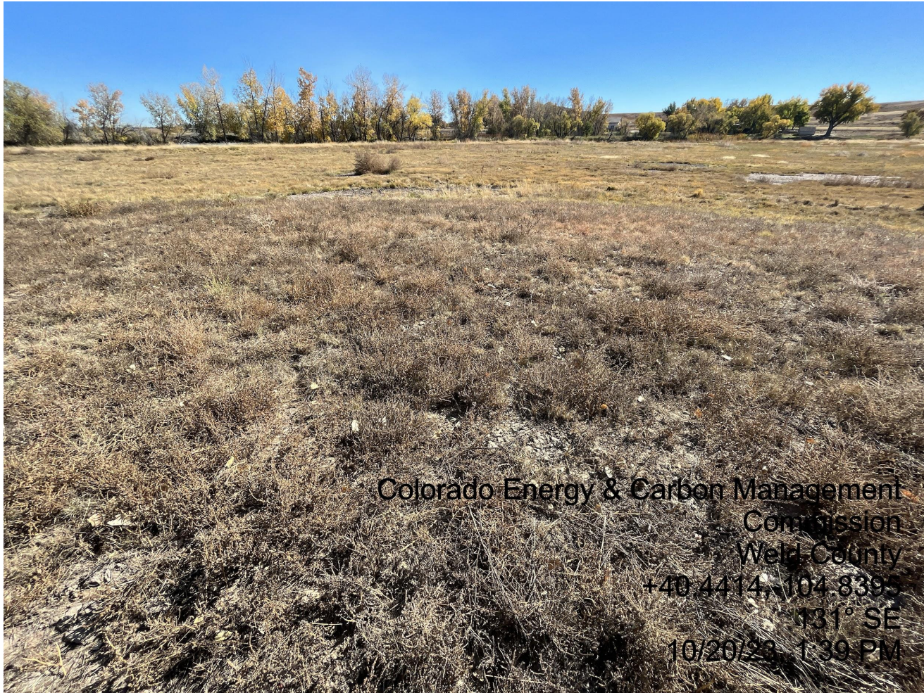
Photo 3. The photo was taken on the well location facing Southeast. See comment on photo 2.

Inspection Photos Location Name: State 3-36 Location ID: 322731