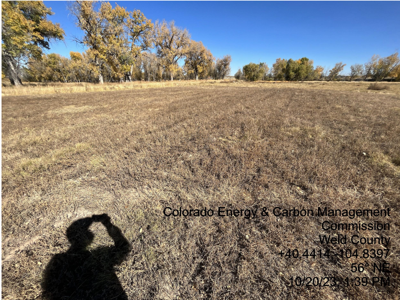
Photo 4. The photo was taken on the well location facing Northeast. The photo illustrates the location is dominated by kochia.