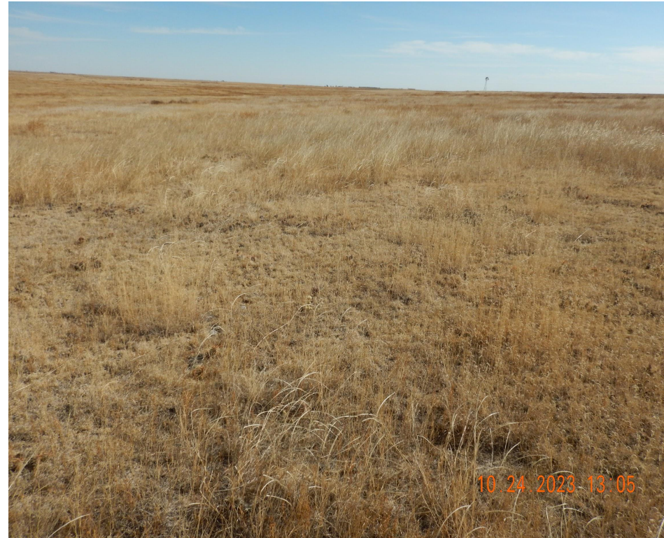
Photo 7. Reference photo taken west of the location, facing East.