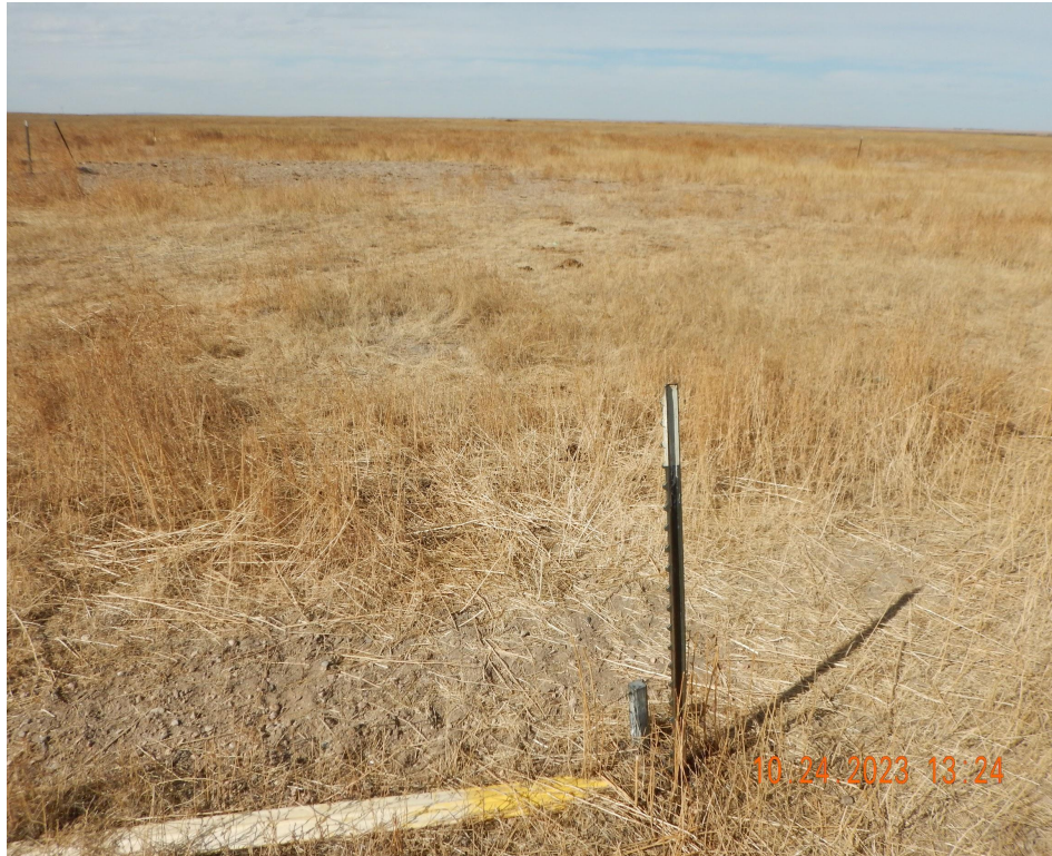
Photo 4. Photo taken from a portion of the location illustrating guy line anchors have not been removed.