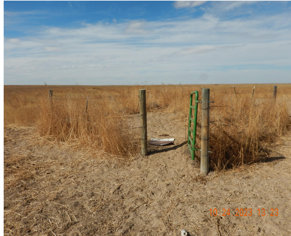
Photo 3. Photo taken from the well location, facing West. Photo illustrates the location has not been reclaimed, fencing remains, and unmanaged weeds observed throughout the location.