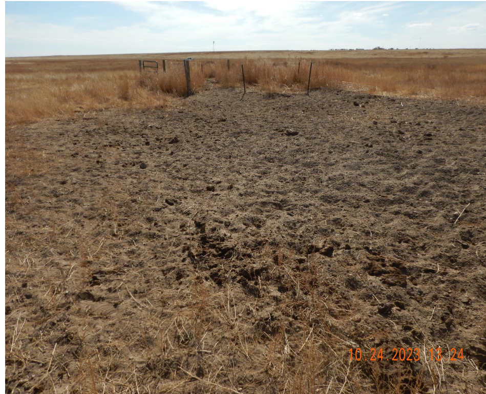
Photo 5. Photo taken from the northern well location, facing South. See comments under Photo 3.