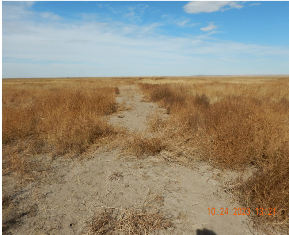
Photo 2. Photo taken from the southern portion of the access road, facing North. Photo illustrates the access road has not been reclaimed and unmanaged weeds (kochia and russian thistle) observed along the access road.