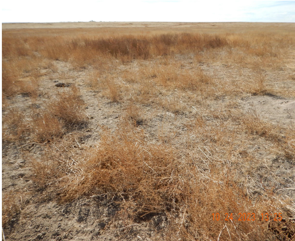
Photo 6. Photo taken from the associated offsite tank battery, facing West. See comments under Photo 3.