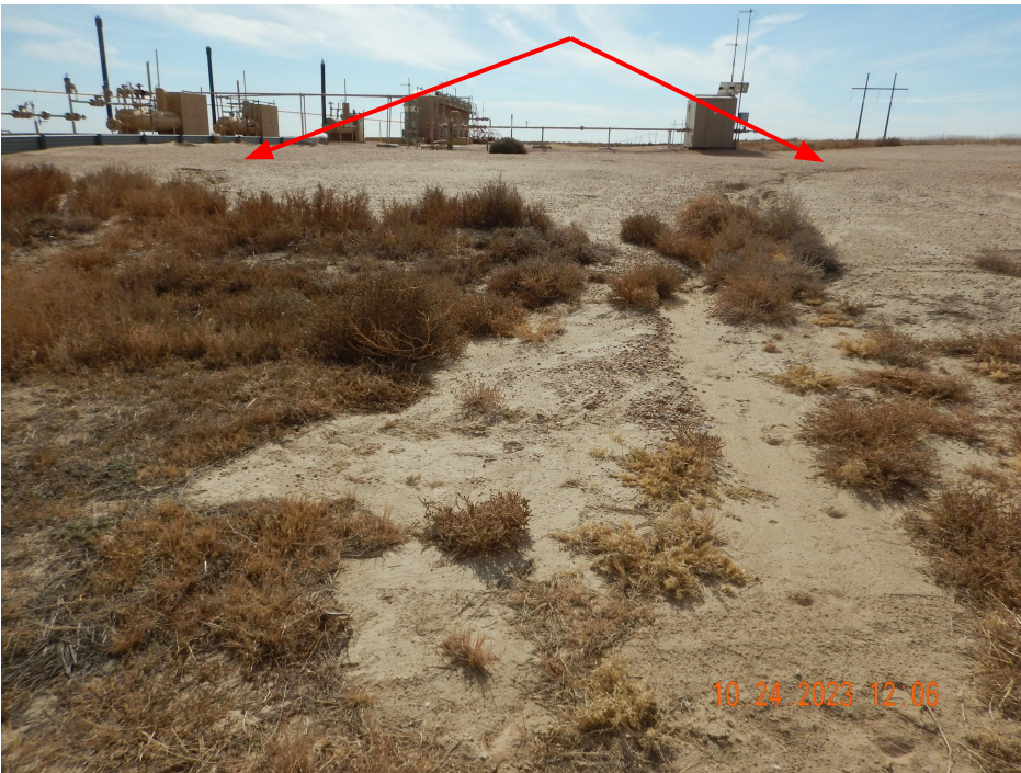
Photo 1. Photo taken from the northern production facility, facing South. Photo illustrates erosion traveling off the fill slope of the production facility without sufficient BMPs along the perimeter of location.