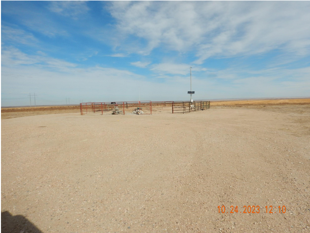
Photo 5. Photo taken from the well location, facing North. Photo illustrates the Operator is in process of plugging operations.