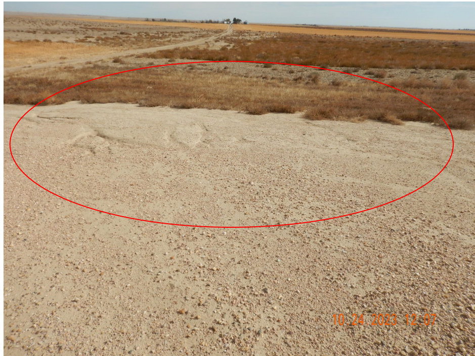
Photo 4. Photo taken from the northeastern production facility, facing Northeast. See comments under Photo 1.