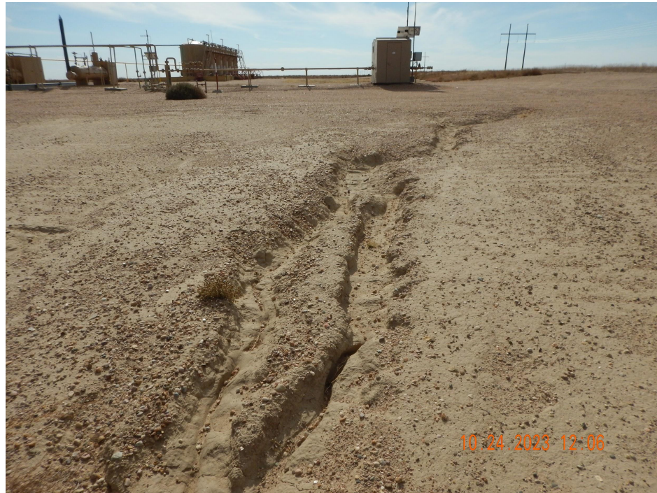
Photo 2. Photo taken from the northern production facility, facing South. See comments under Photo 1.