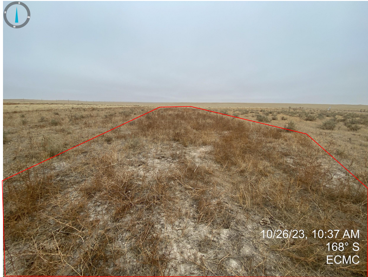
Photo 9. Taken from the eastern portion of the location. Photo illustrates undesirable vegetation (e.g. russian thistle) throughout the topsoil stockpile area.