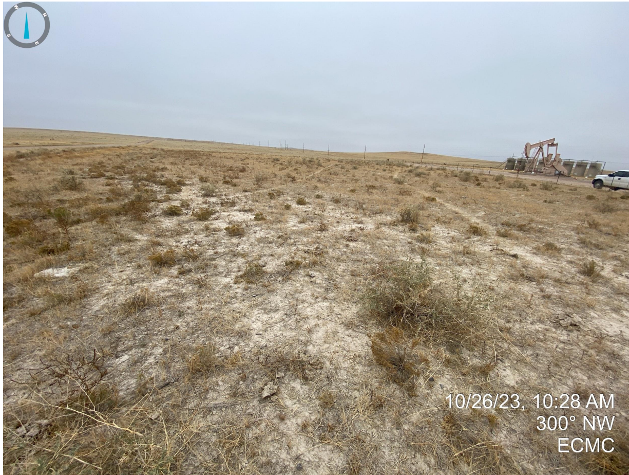
Photo 1. Taken from the southern portion of the location, near the entrance. Photo illustrates non-uniform vegetative cover resulting in areas of bare/exposed soils.