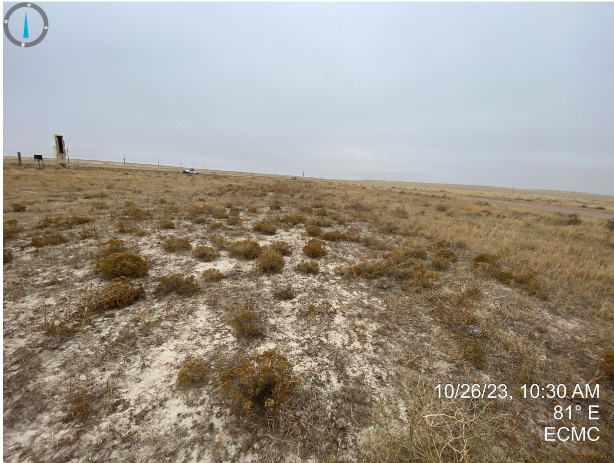
Photo 2. Taken near the southwest corner of the location. See comments in Photo 1.