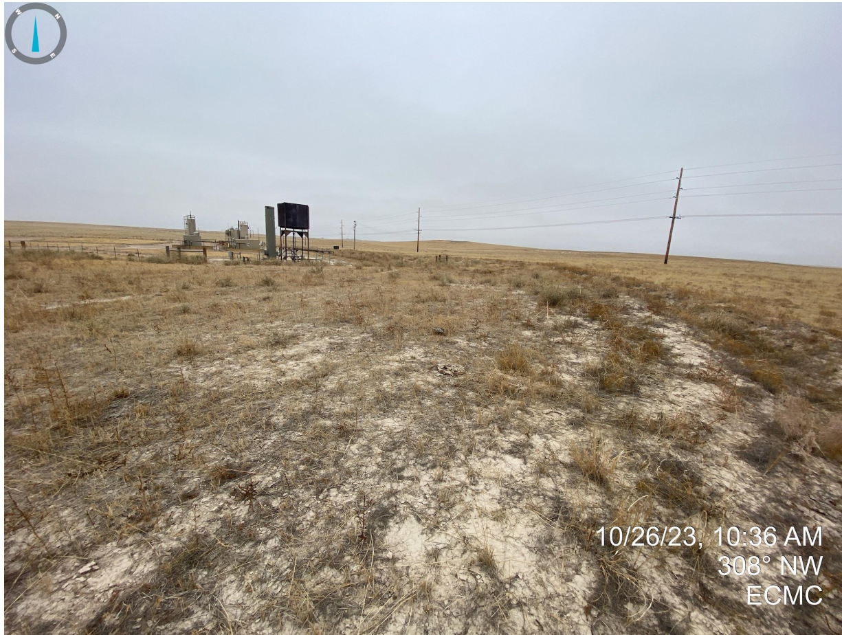
Photo 8. Taken near the northeast corner. Photo illustrates non-uniform vegetative cover resulting in bare/exposed soils, and the presence of undesirable vegetation (e.g. russian thistle).