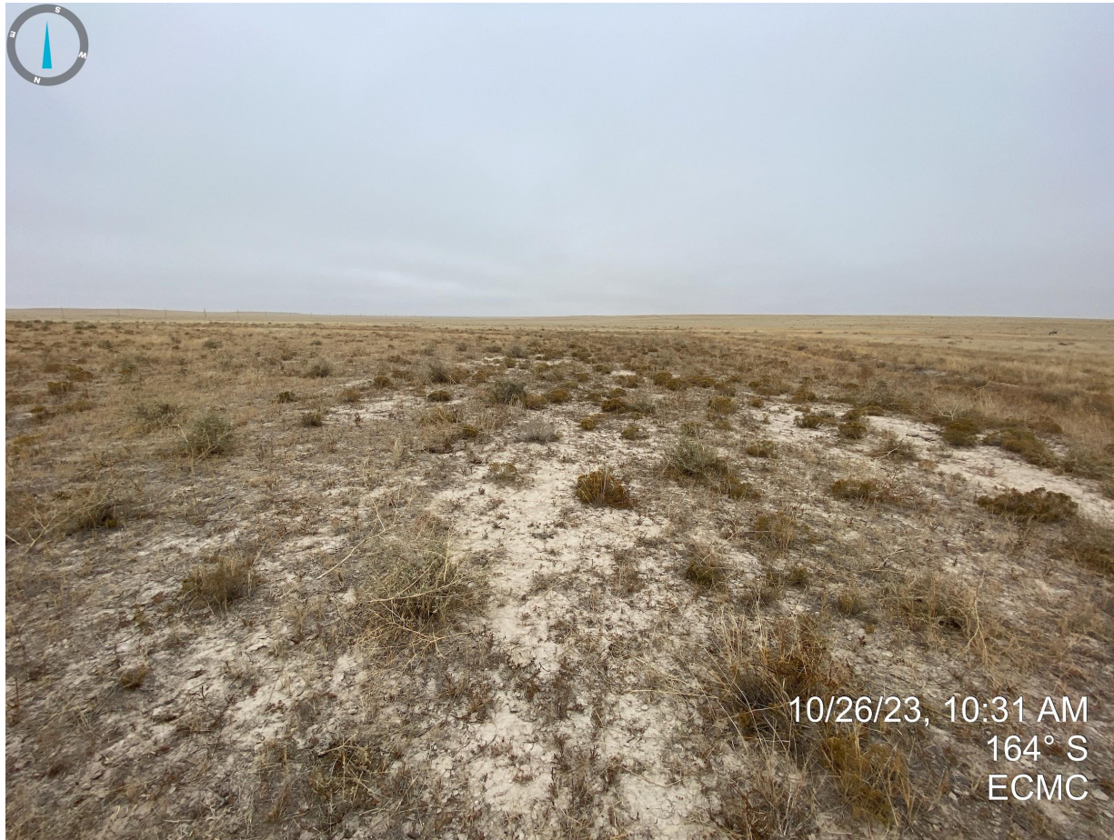
Photo 3. Taken from the western portion of the location. See comments in Photo 1.