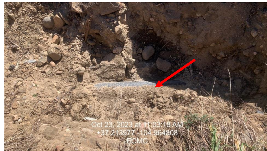
Photo 1 –Exposed Gathering Line @ 37.214012; -104.962963 Box Canyon Creek Crossing