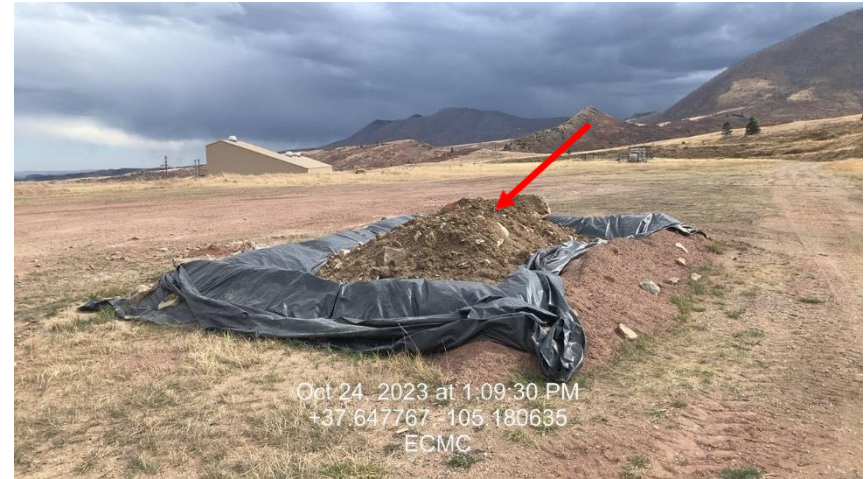
Photo 3 – Wellhead, Form 27 Document # 403489470, States; Operator will continue quarterly reporting until the site investigation is complete and table 915-1 standards are met within the remediation area