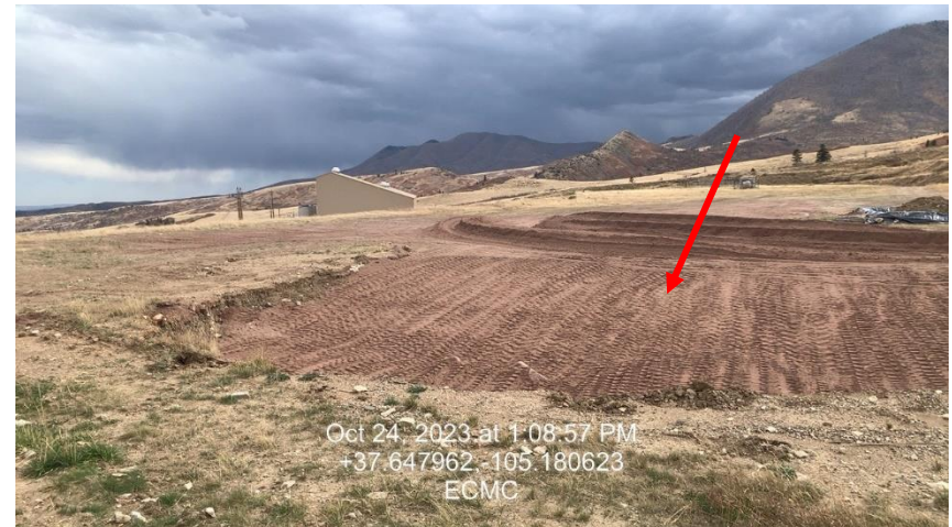
Photo 2 – Historical Wellhead location, Well is under an open remediation. Remediation # 24088