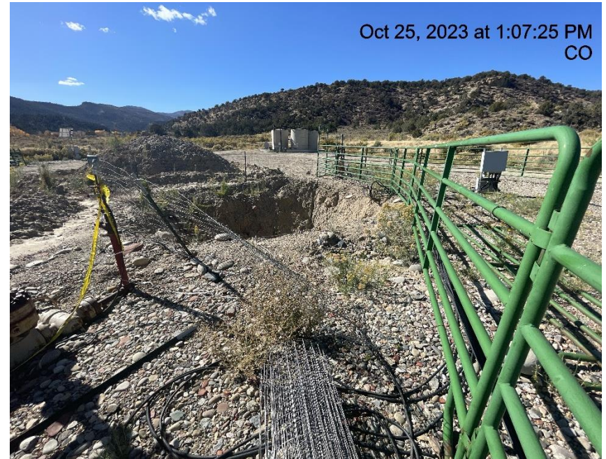
Photo # 4273 Wildlife BMP's around excavation areas need maintenance