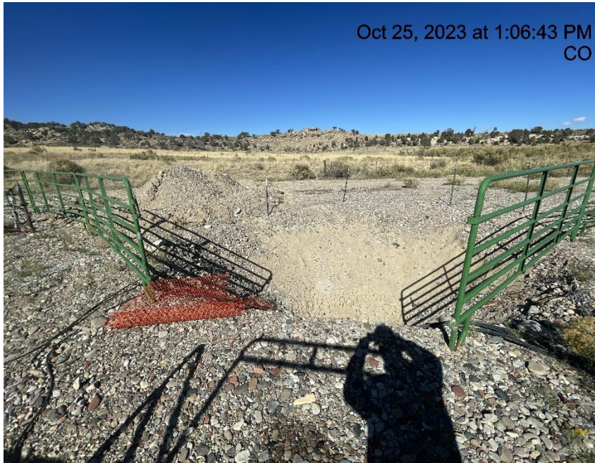
Photo # 4270 Wildlife BMP's around excavation areas need maintenance