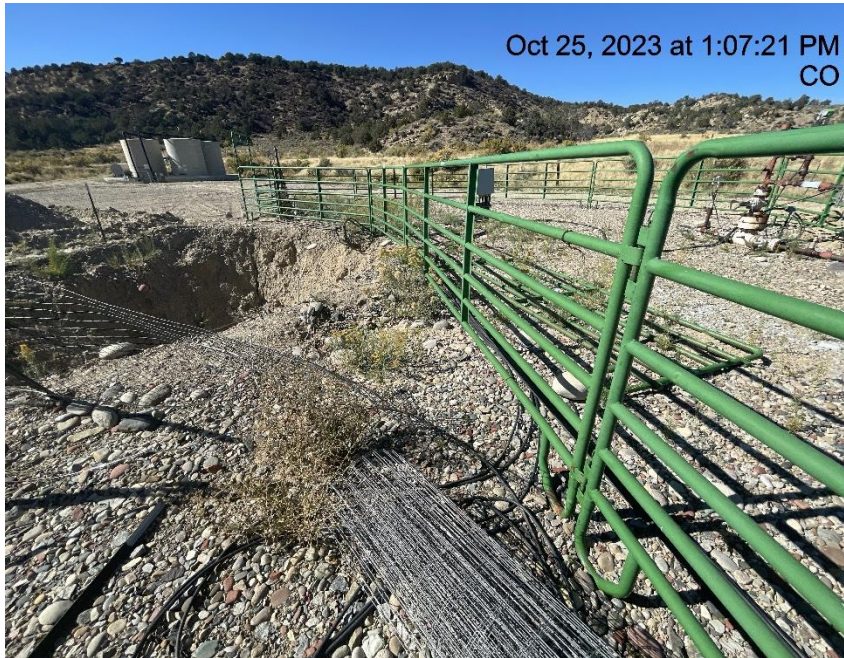
Photo # 4272 Wildlife BMP's around excavation areas need maintenance