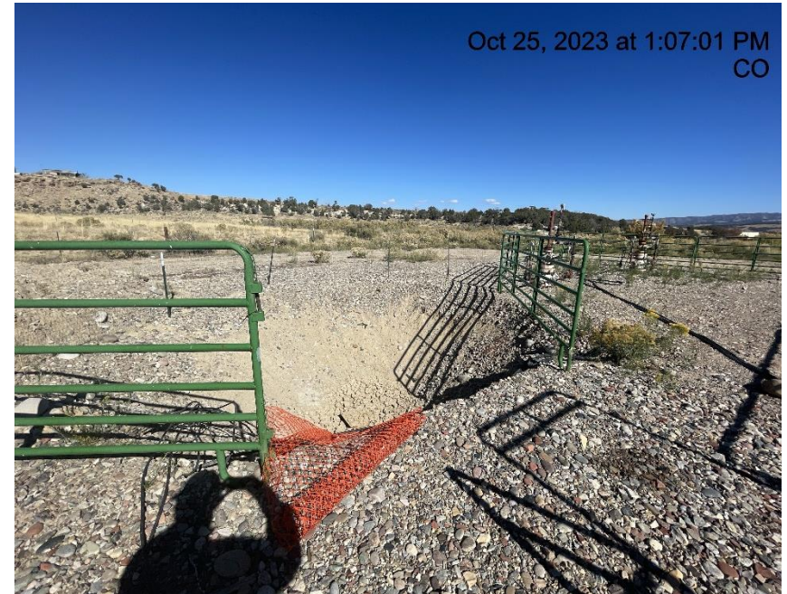
Photo # 4271 Wildlife BMP's around excavation areas need maintenance