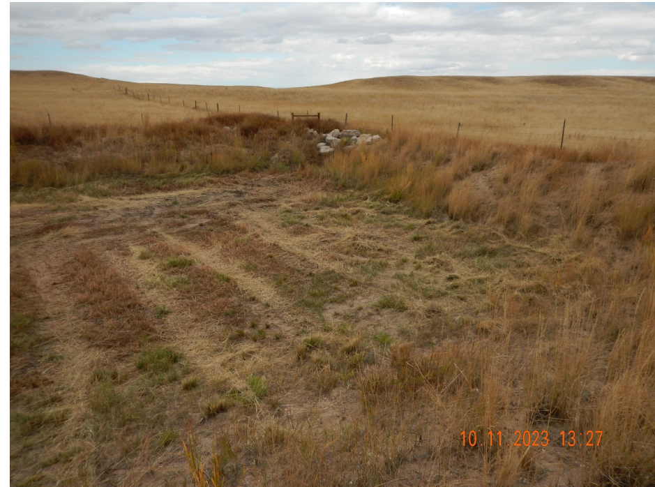
Photo 6. Photo taken from the northeastern location, facing Northeast. Photo illustrates the retention pond that is in proper functioning condition. No sediment discharge was observed from location.