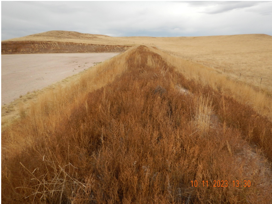
Photo 7. Photo taken from the topsoil stockpile, facing West. Photo illustrates Russian thistle growth that appears to be treated with herbicides. Much of the other perennial vegetation on the stockpile is introduced grass species not reflective of reference area conditions.