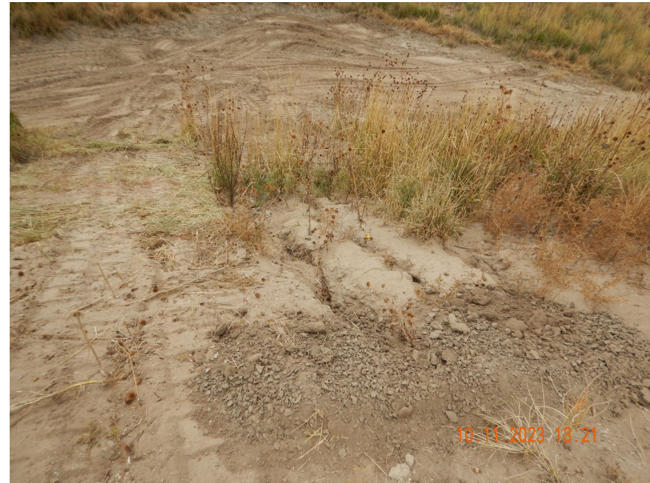
Photo 2. Photo taken from a section of the fill slope leading into the retention pond. Photo illustrates rill erosion that was partially repaired.

Note- filling in the rill erosion by itself will not be sufficient to stabilize the fill slope.