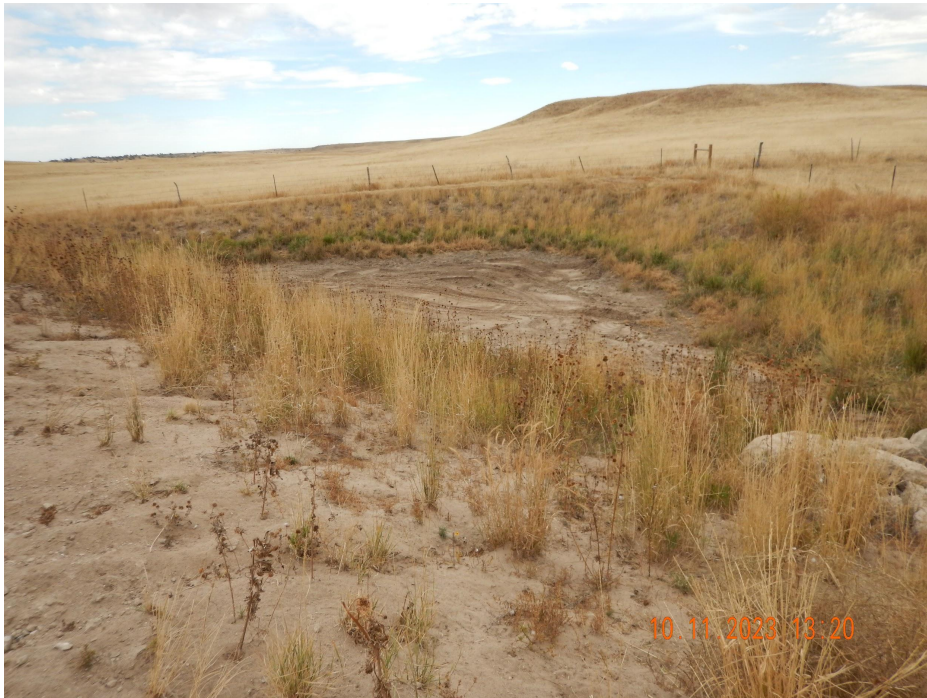
Photo 1. Photo taken from the southeastern location, facing Southeast. Photo illustrates the retention pond that is in proper functioning condition. No sediment discharge was observed from location.