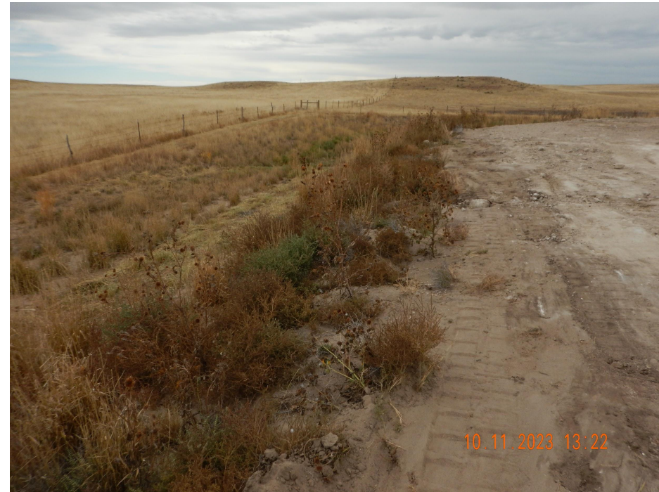
Photo 4. Photo taken from the eastern location, facing South. Photo illustrates Russian thistle (tumbleweed) that appears to be treated with herbicides. Since Russian thistle will likely break off and become weed debris, Operator will have to remove Russian thistle which can be accomplished through mechanical control.

Note- filling in the rill/gully erosion by itself will not be sufficient to stabilize the fill slope.