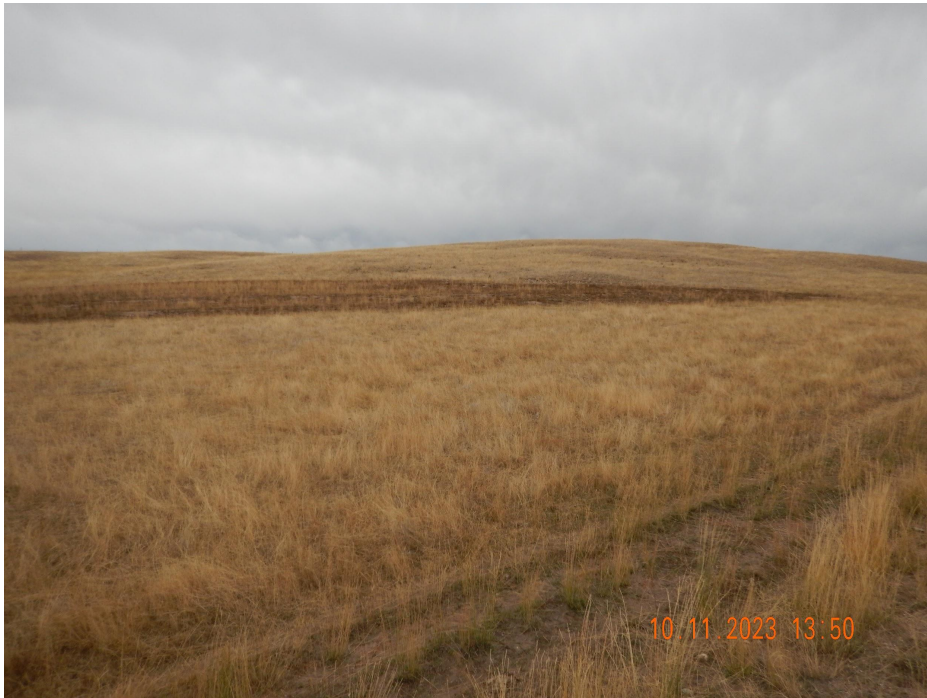
Photo 11. Photo taken along the portion of the access road where topsoil was salvaged from the access road, facing South. Refer to Photo 13 for an overview of the stockpiled location.