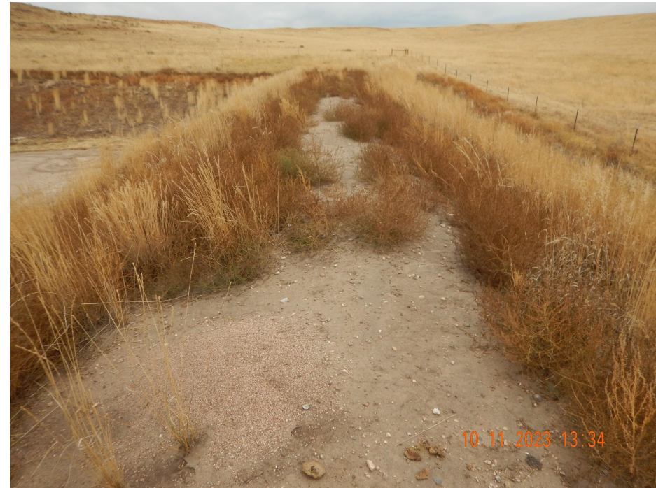
Photo 8. Photo taken from another portion of the topsoil stockpile, facing West. Photo illustrates bare areas that appears to be compacted.