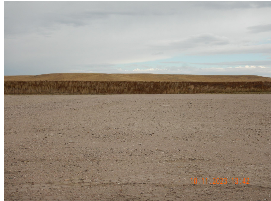
Photo 10. Photo taken from the southern location, facing North. Photo illustrates the south-facing side of the topsoil stockpile illustrating Russian thistle growth that appeared to be treated with herbicides.