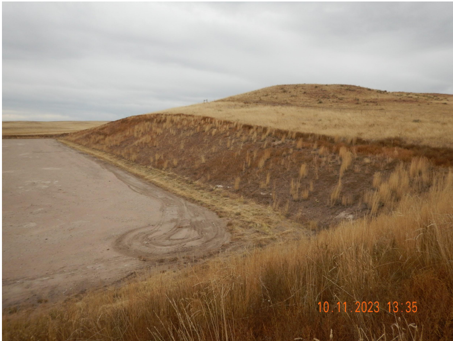
Photo 9. Photo taken from the topsoil stockpile, facing Southwest. Photo illustrates the western cut slope that has some perennial vegetation but introduced species.