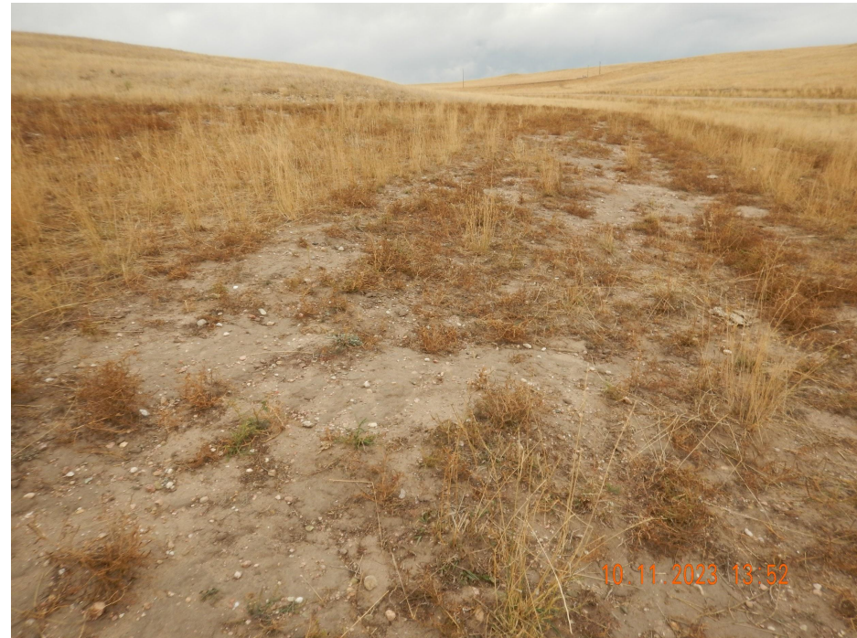
Photo 12. Photo taken from the topsoil stockpile location, facing West. Photo illustrates some desirable establishment and introduced grass species but also bare areas that are not reflective of reference areas. The area also appeared to be compacted.