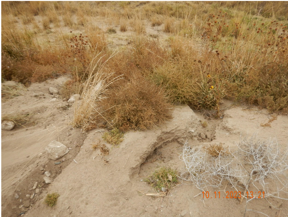
Photo 3. Photo taken from another section of fill slope, north of the retention pond. Photo illustrates rill erosion/gully erosion that needs repairs.

Note- filling in the rill/gully erosion by itself will not be sufficient to stabilize the fill slope.