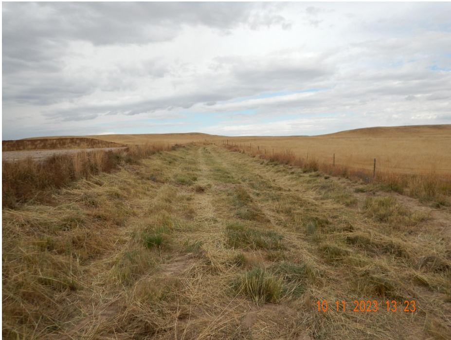
Photo 5. Photo taken from the eastern perimeter of location, facing North. Photo illustrates recent mowing operations.