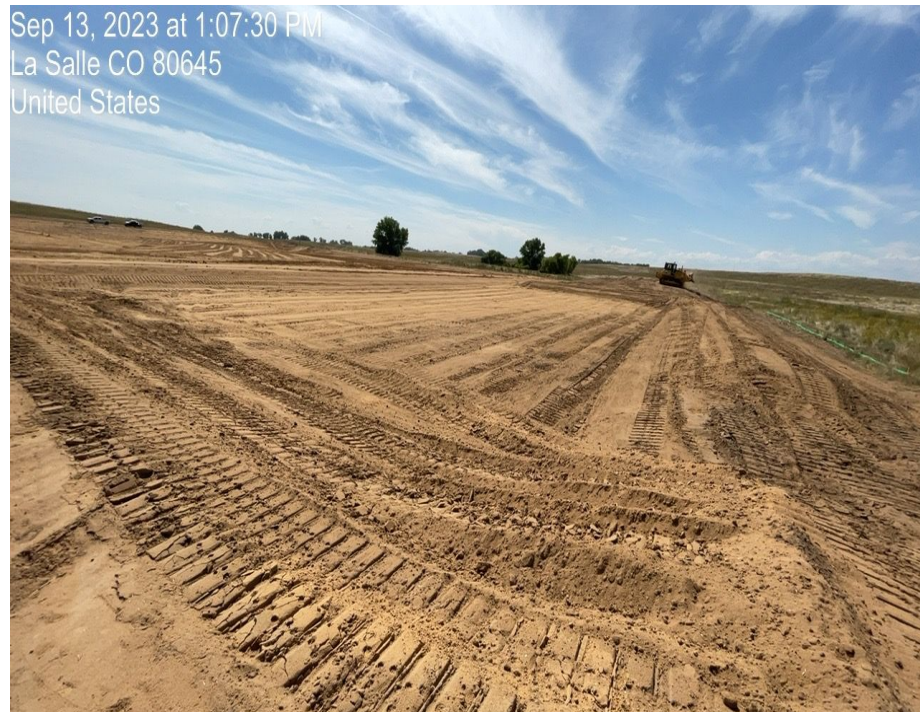
Photo 14. Photo taken of pad under construction. Photo taken facing northeast.