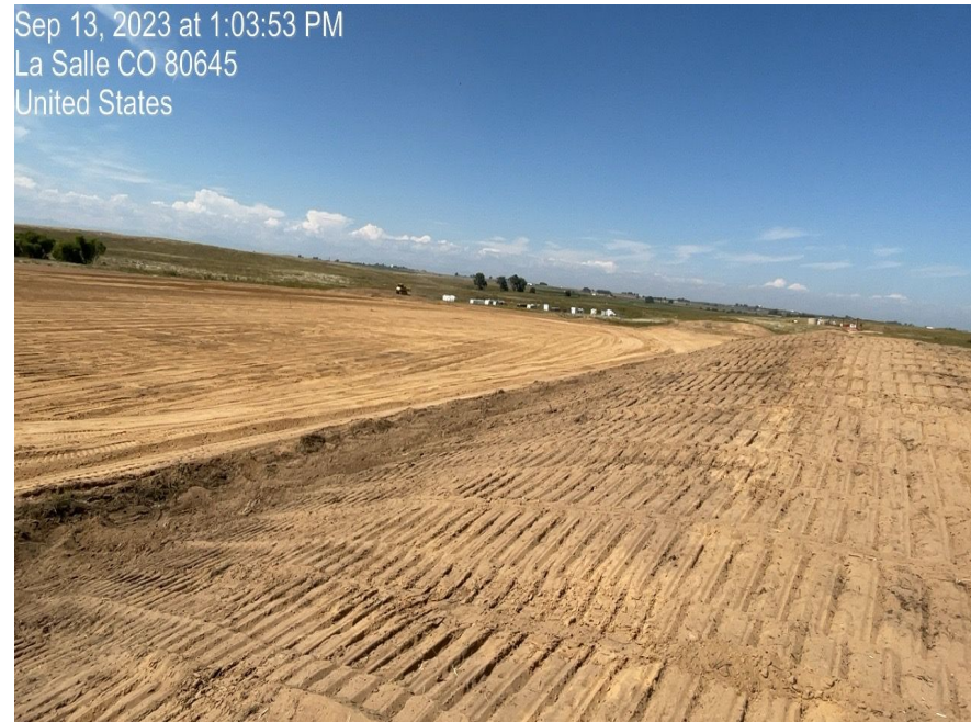
Photo 10. Photo taken of location under construction from atop trackwalked topsoil stockpile. Photo taken facing west.