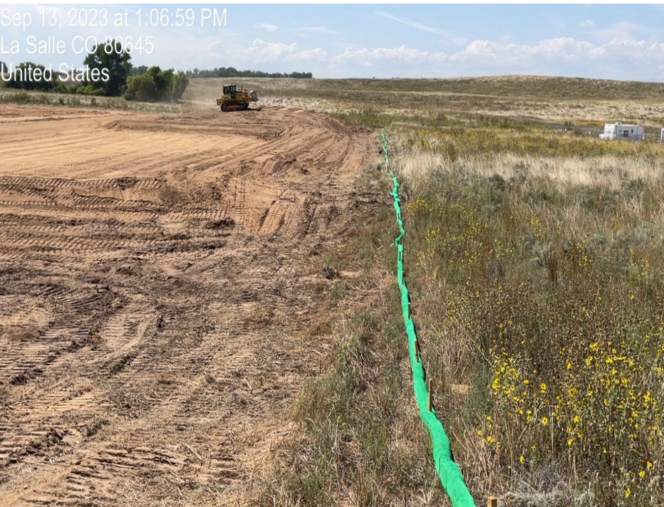
Photo 13. Photo taken of wattles on west side of location perimeter. Photo taken facing south.