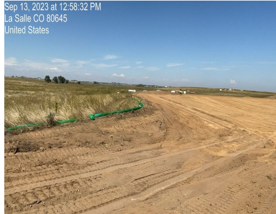
Photo 2. Photo taken facing northwest of entrance of new pad construction.

Sep 13, 2023 at 12:58:32 PM La Salle CO 80645 United States