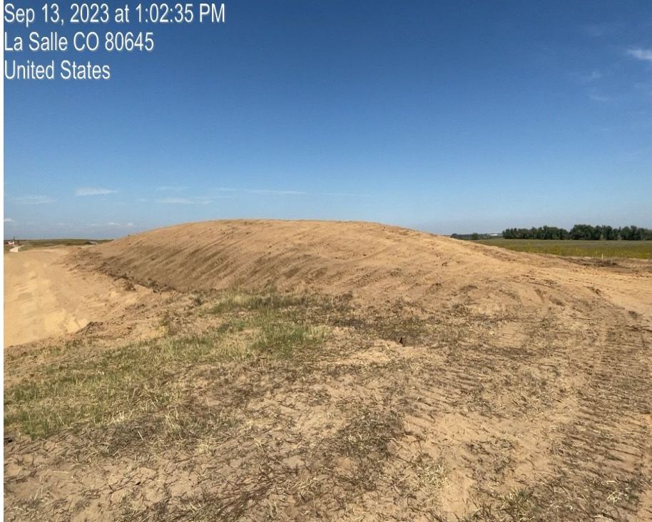
Photo 5. Photo taken of topsoil stockpile on north side of location. Photo taken facing northwest.

Sep 13, 2023 at 1:02:35 PM La Salle CO 80645 United States