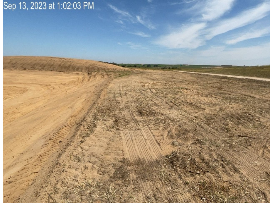
Photo 4. Photo taken facing north of area between access road and cut slope west side of pad, and topsoil stockpile on the north side of location.