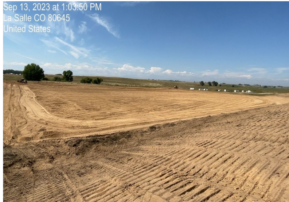
Photo 9. Photo taken of location under construction from atop topsoil stockpile. Photo taken facing southwest.