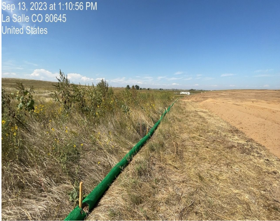
Photo 15. Photo taken of wattles on south side of location perimeter. Photo taken facing west.

Sep 13, 2023 at 1:10:56 PM La Salle CO 80645 United States