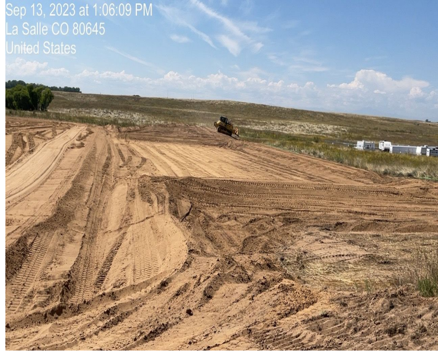
Photo 12. Photo taken of sediment trap under construction on the west side of location. Photo taken facing south.

Sep 13, 2023 at 1:06:09 PM La Salle CO 80645 United States