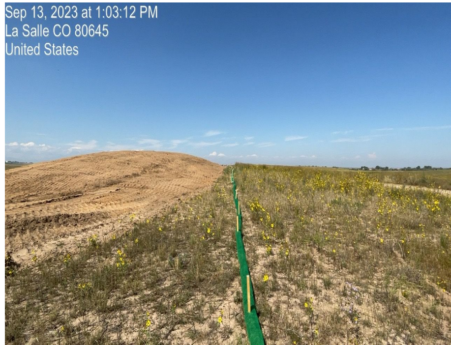
Photo 7. Photo taken of wattles at edge of disturbance on the north side of location. Photo taken facing west.