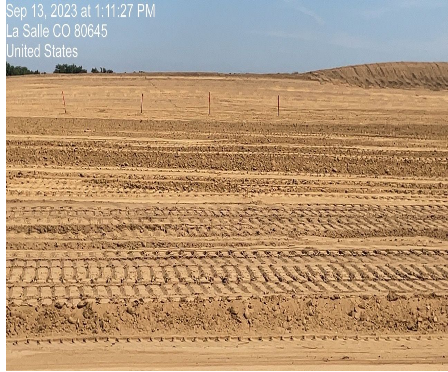
Photo 16. Photo taken photo of proposed wells on pad. Photo taken facing north.

Sep 13, 2023 at 1:11:27 PM La Salle CO 80645 United States