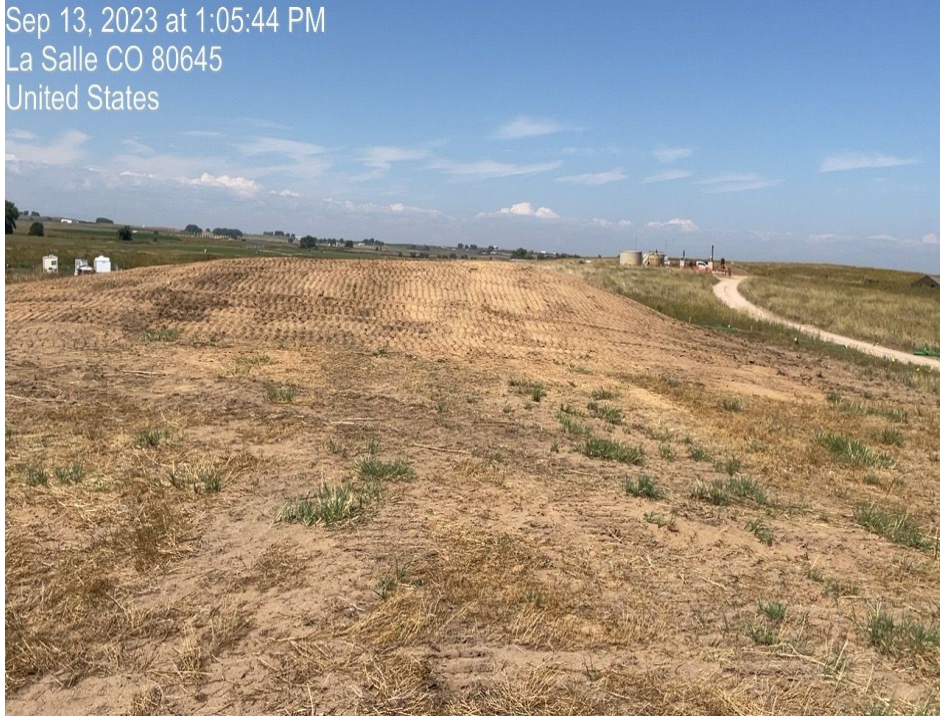
Photo 11. Photo taken of trackwalked topsoil stockpile on north side of location Photo taken facing east.

Sep 13, 2023 at 1:05:44 PM La Salle CO 80645 United States