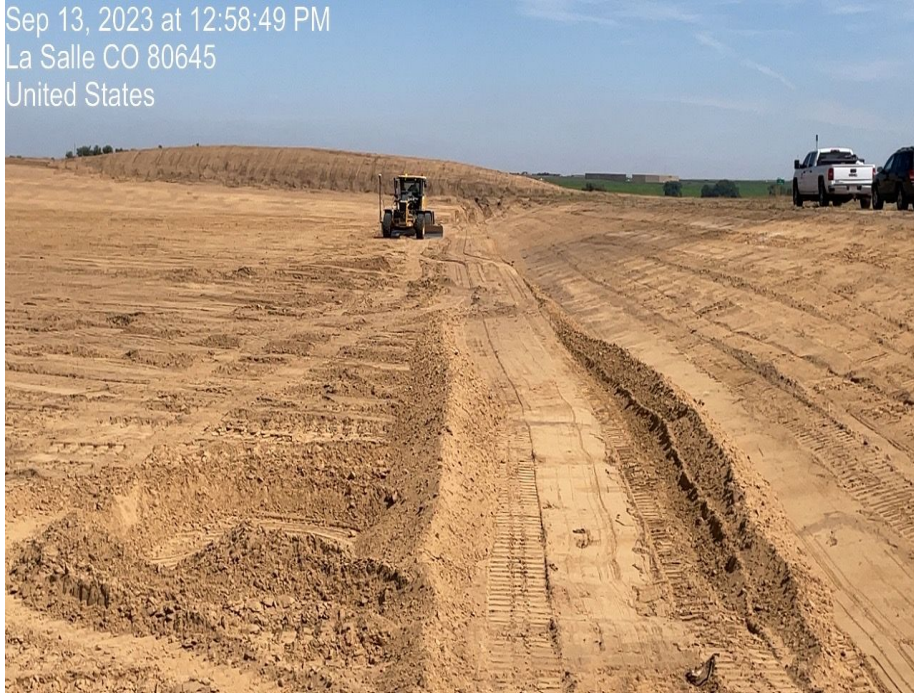
Photo 3. Photo taken facing north of cut slope west side of location and topsoil stockpile on the north side of location.

Sep 13, 2023 at 12:58:49 PM La Salle CO 80645 United States