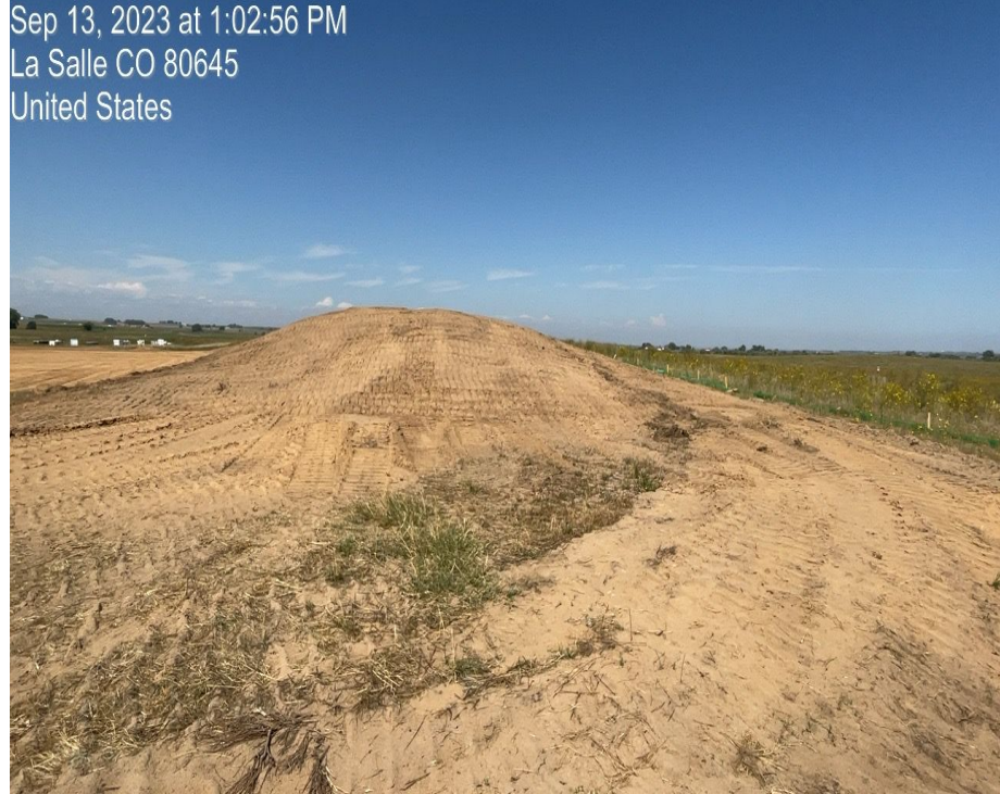
Photo 6. Photo taken of topsoil stockpile on north side of location. Photo taken facing west.

Sep 13, 2023 at 1:02:56 PM La Salle CO 80645 United States