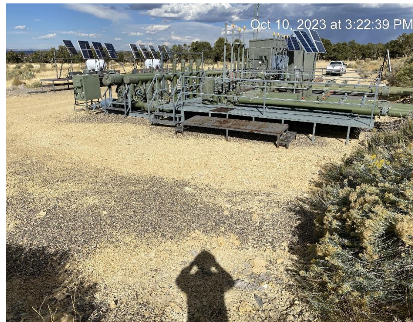
Tank battery view from Southwest corner