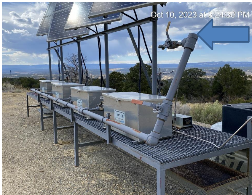
Disconnected manifold open to wildlife