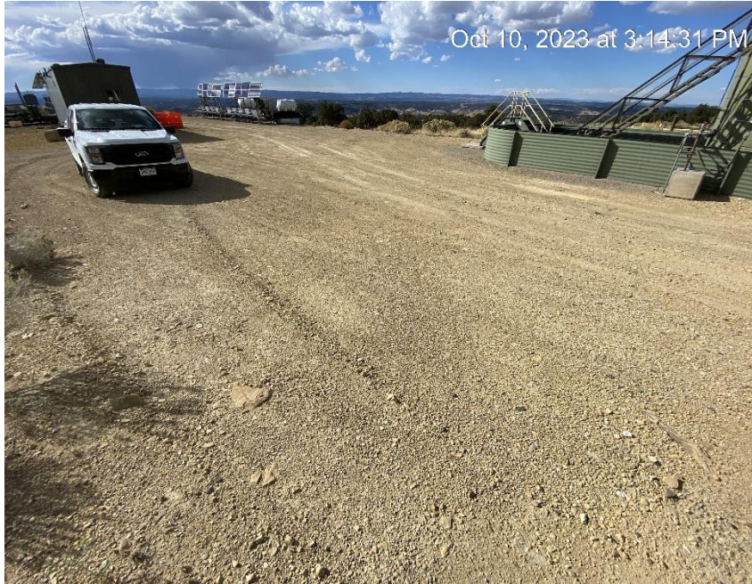
Tank battery view from Southeast corner