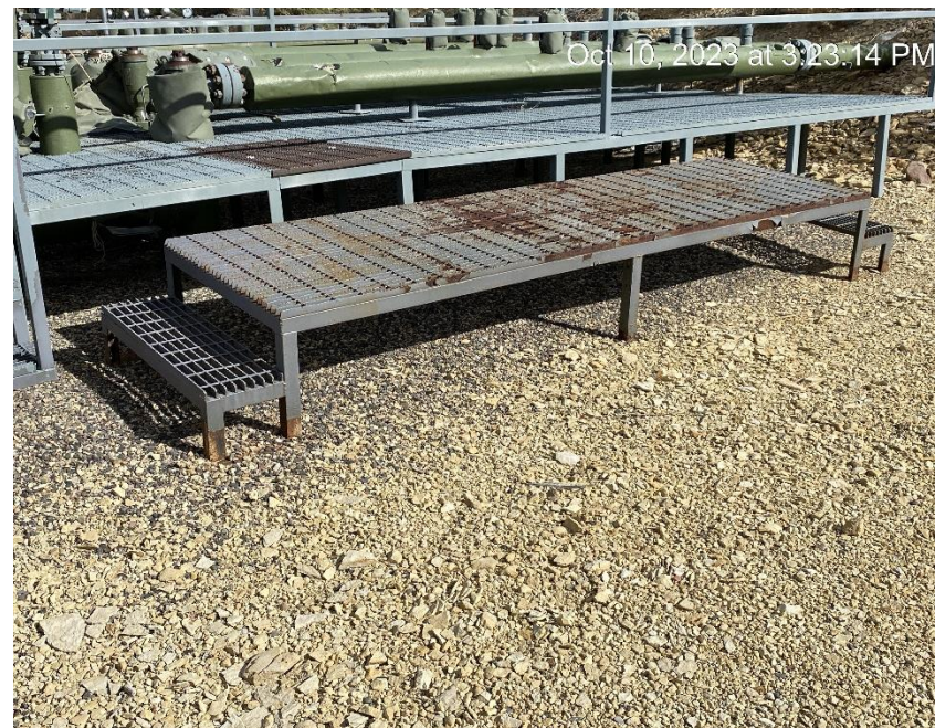
Equipment not in use