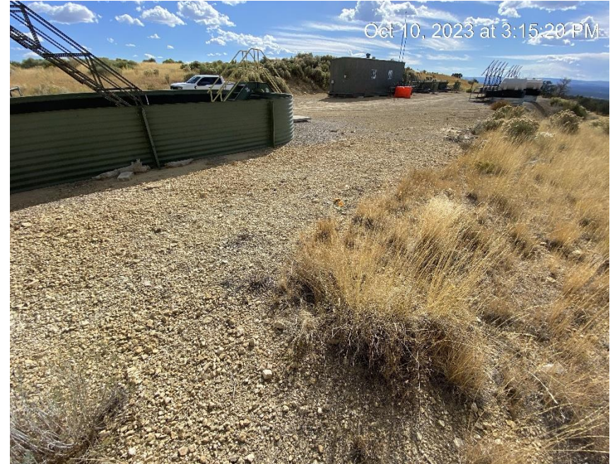
Tank battery view from Northeast corner