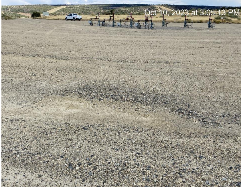
Location view from Northwest corner