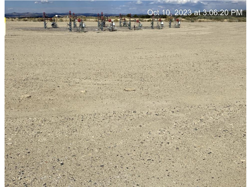
Location view from Southwest corner