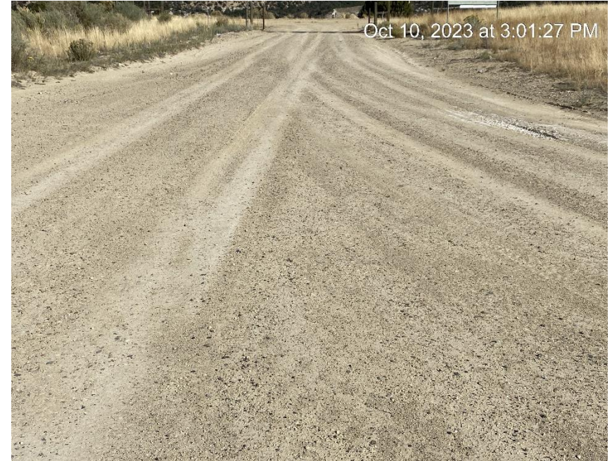
Access road into well pad