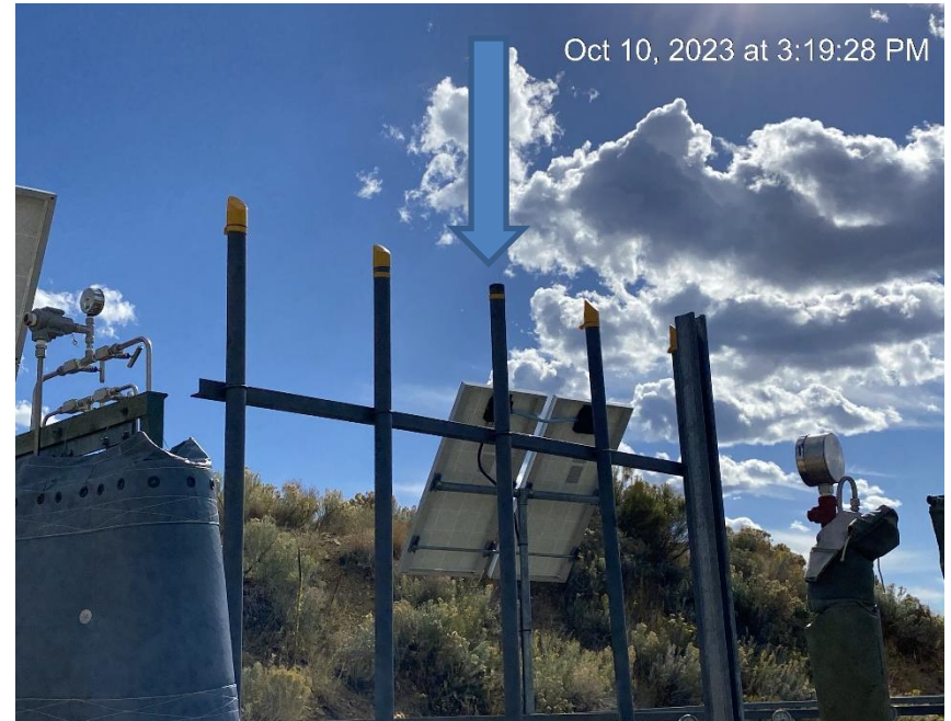
Rain cap missing on riser