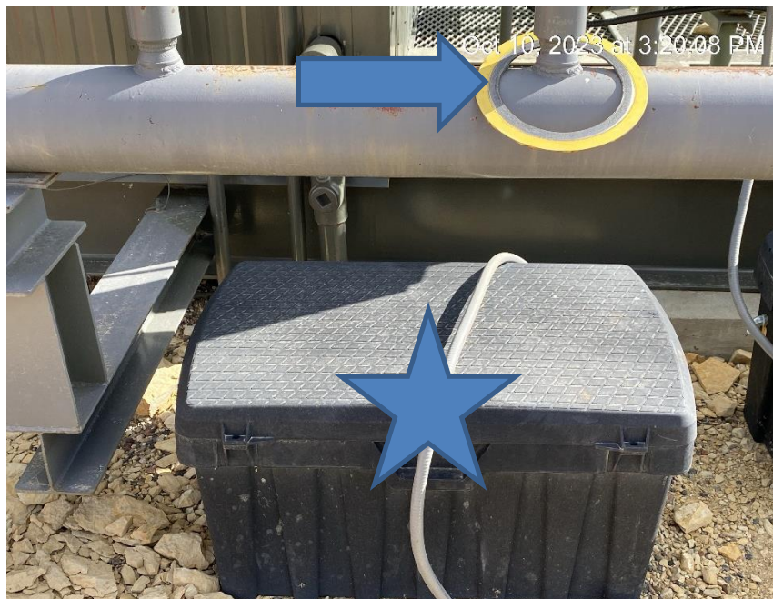
Debris. Box is disconnected.