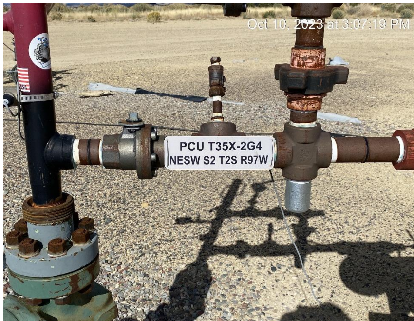
Wellhead sign missing required information