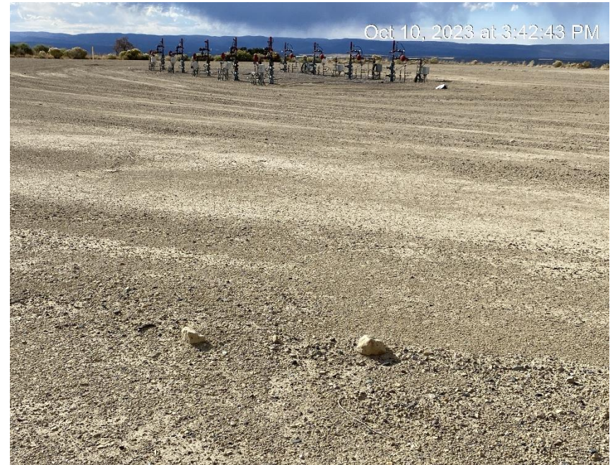
Location view from Southeast corner