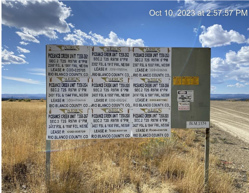
Entrance sign at well pad