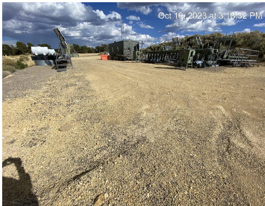
Tank battery view from Northwest corner