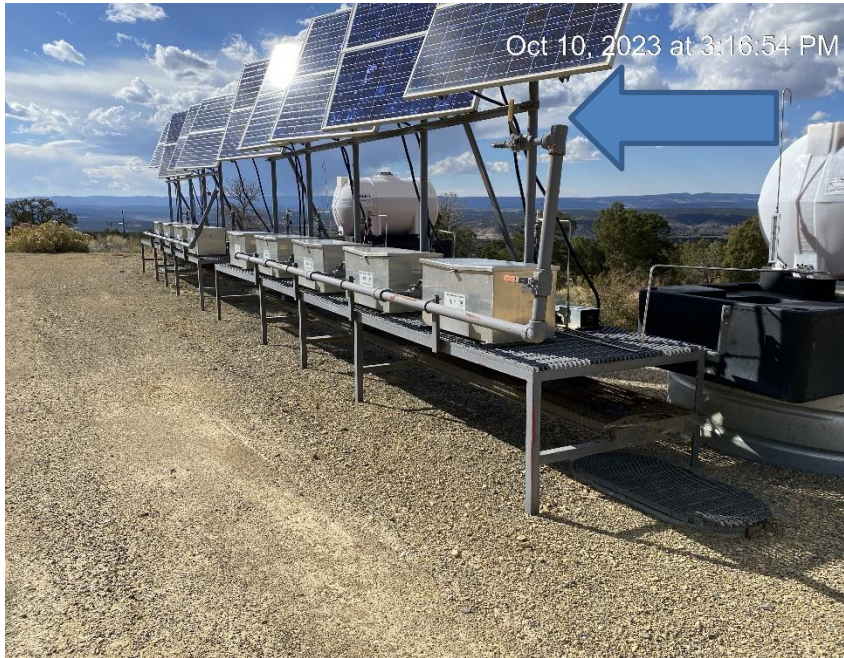
Disconnected manifold open to wildlife