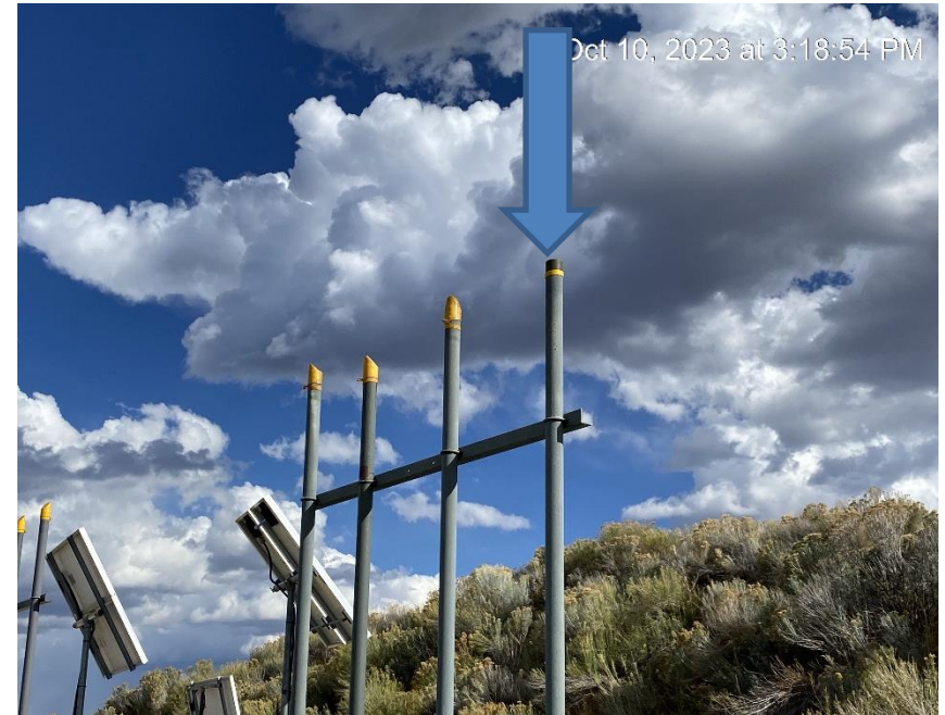
Rain cap missing on riser