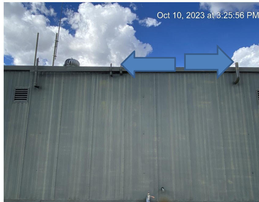
Pressure relief risers missing rain caps