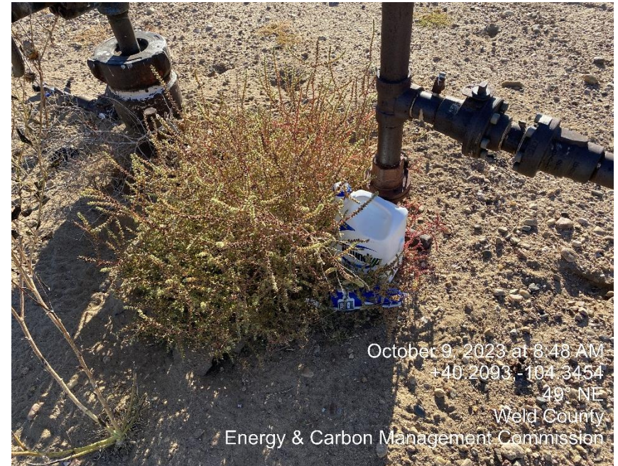
Overgrown Vegetation & Trash