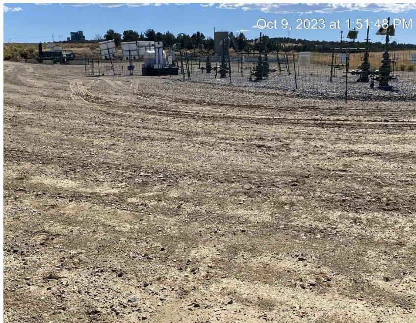
Location view from Northeast corner