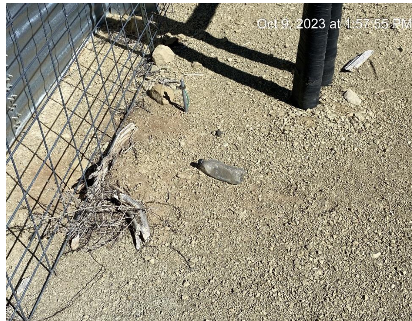
Debris outside tank battery