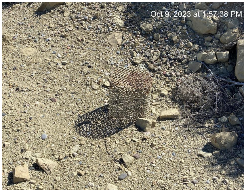
Debris outside tank battery