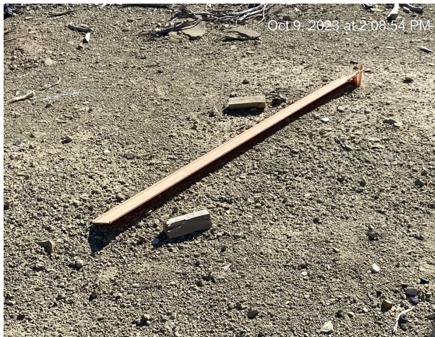
Debris outside tank battery