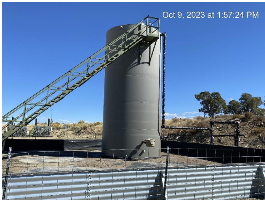
Tank with gauge hatch open