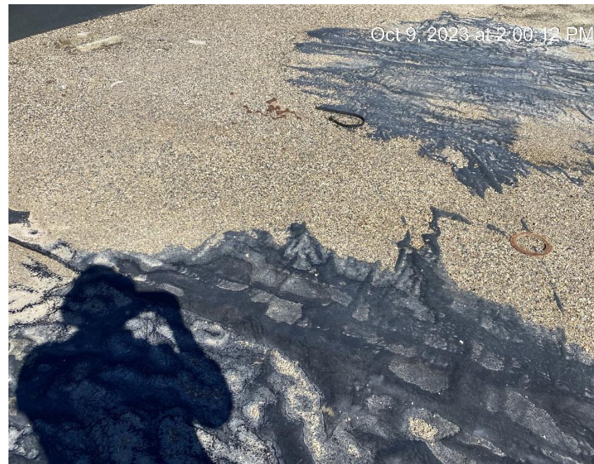
Debris inside tank battery