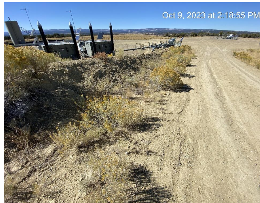
Location view from Southeast corner