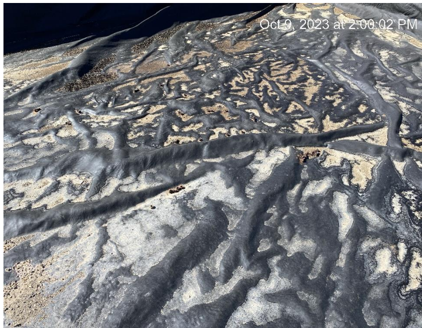
Debris inside tank battery