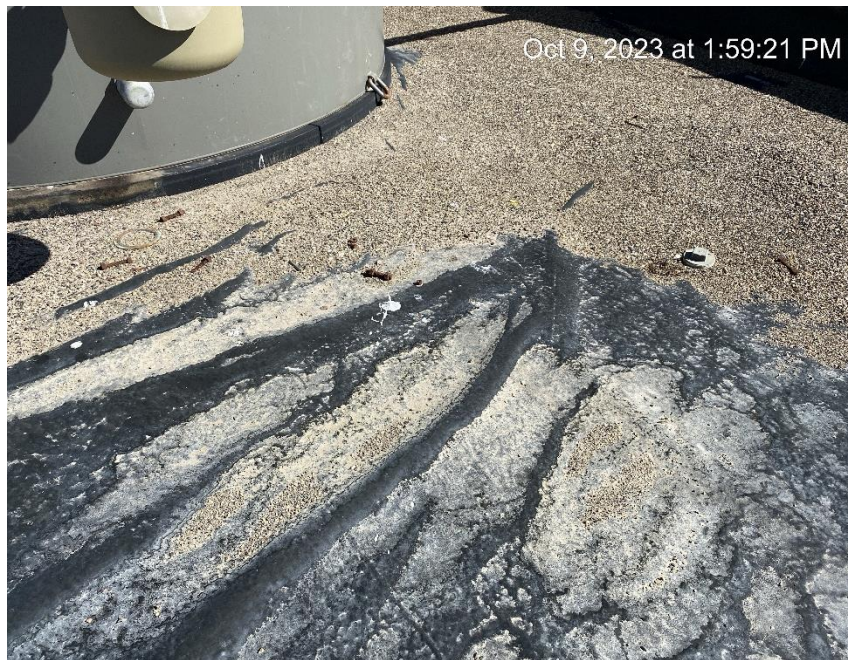
Debris inside tank battery