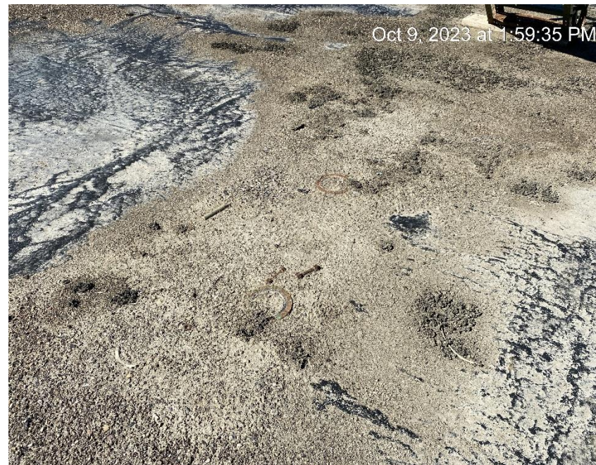
Debris inside tank battery