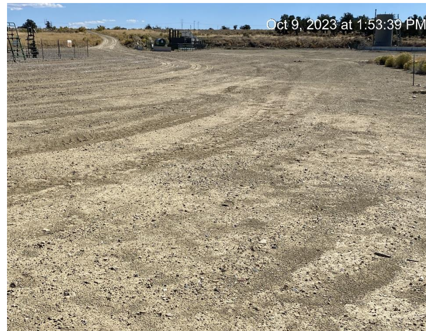
Location view from Northwest corner