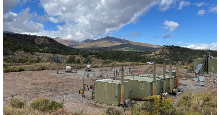
North East corner of location.