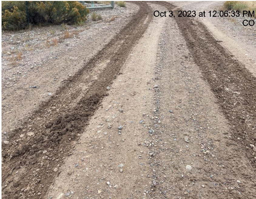
Photo # 1384 Vehicle tracking onto lease road/insufficient tracking BMP's