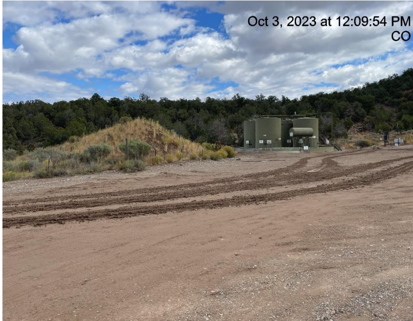
Photo # 1392 Vehicle tracking onto lease road/insufficient tracking BMP's