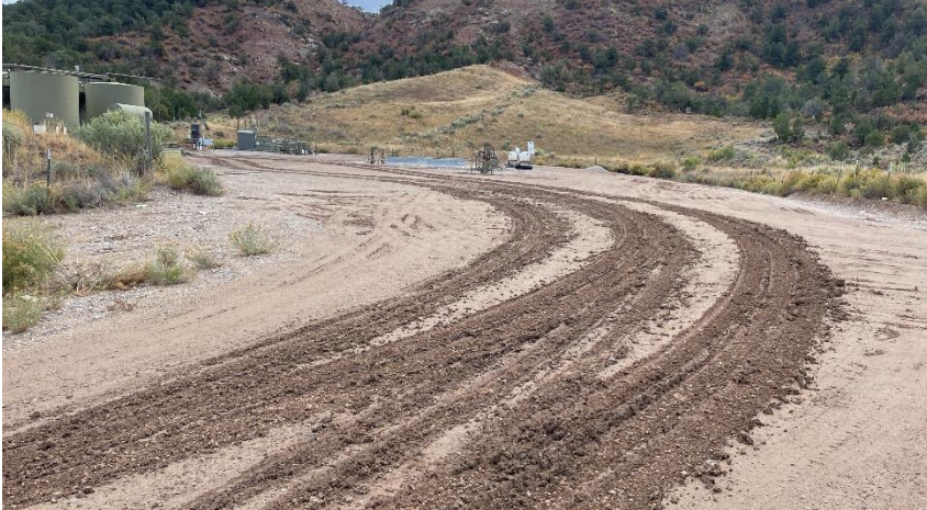
North West corner of location.