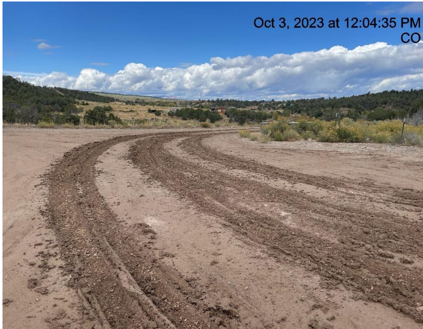
Photo # 1374 Vehicle tracking onto lease road/insufficient tracking BMP's