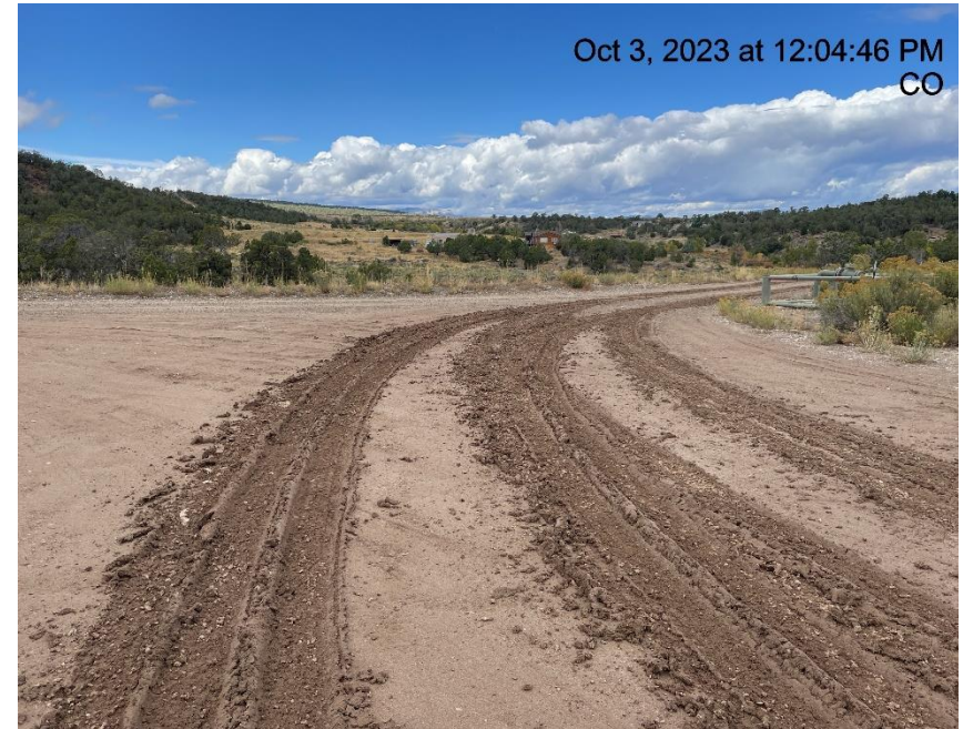
Photo # 1375 Vehicle tracking onto lease road/insufficient tracking BMP's