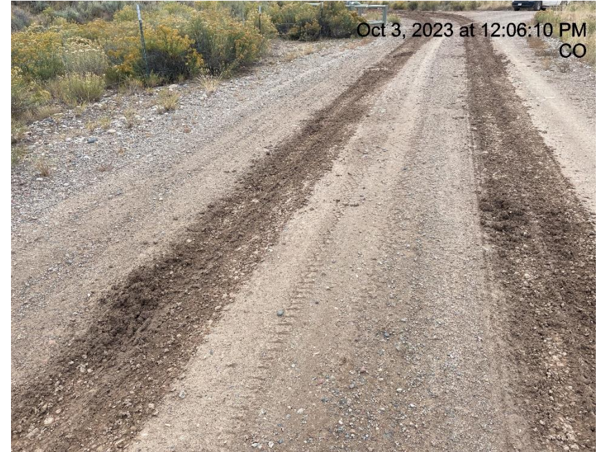
Photo # 1383 Vehicle tracking onto lease road/insufficient tracking BMP's