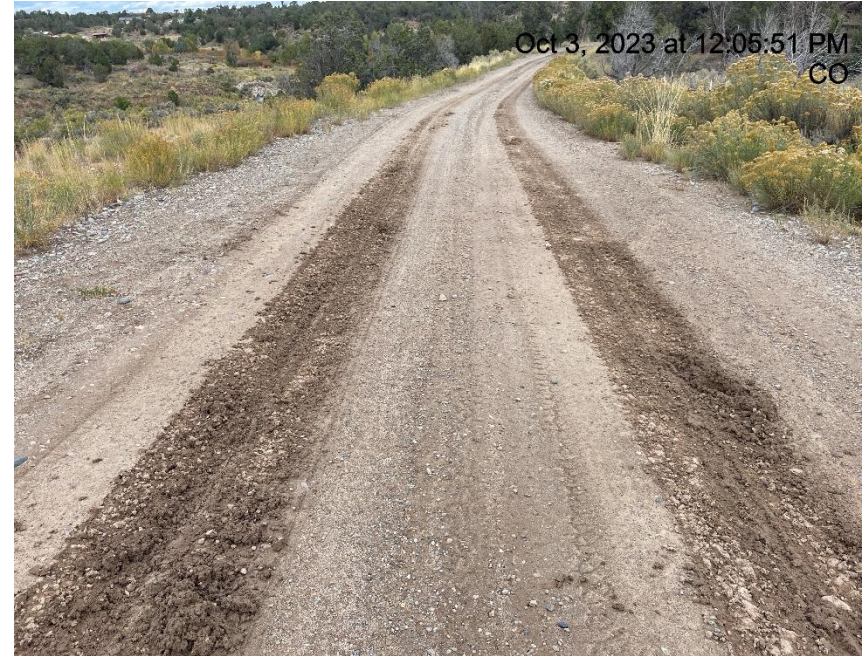
Photo # 1381 Vehicle tracking onto lease road/insufficient tracking BMP's