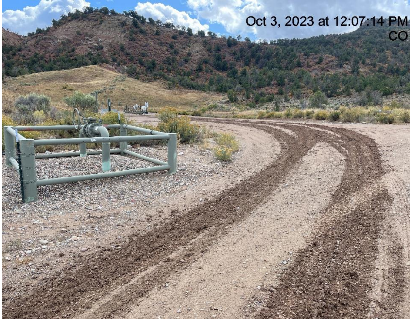
Photo # 1386 Vehicle tracking onto lease road/insufficient tracking BMP's