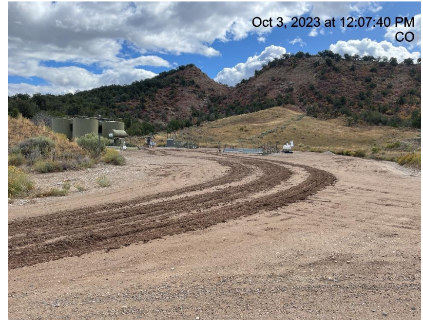
Photo # 1389 Vehicle tracking onto lease road/insufficient tracking BMP's