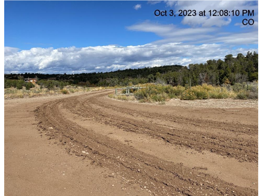
Photo # 1372 Vehicle tracking onto lease road/insufficient tracking BMP's