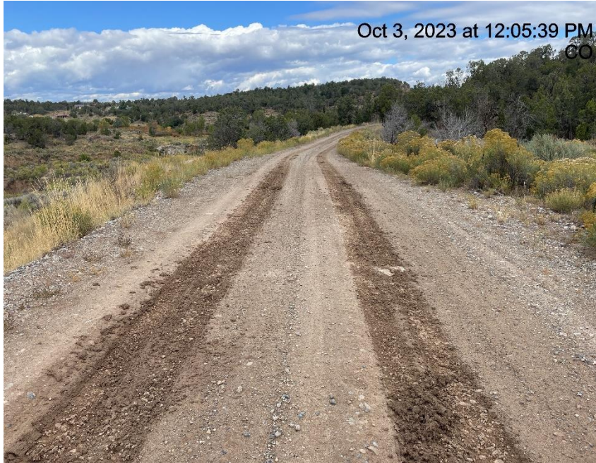
Photo # 1380 Vehicle tracking onto lease road/insufficient tracking BMP's