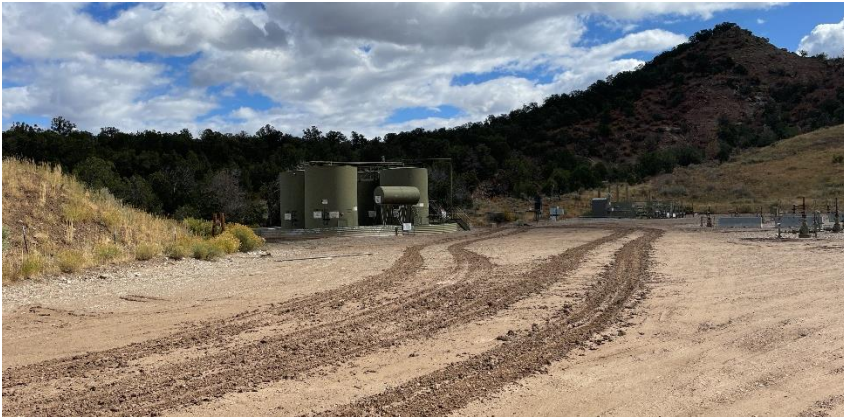
South West corner of location.