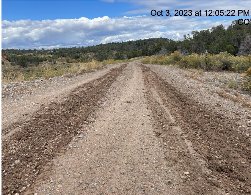
Photo # 1378 Vehicle tracking onto lease road/insufficient tracking BMP's