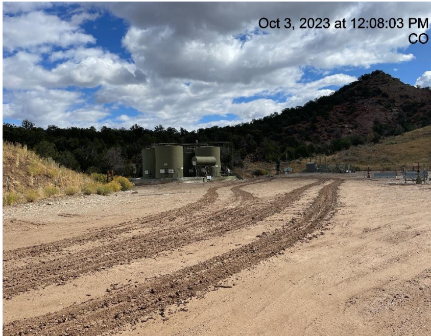
Photo # 1390 Vehicle tracking onto lease road/insufficient tracking BMP's