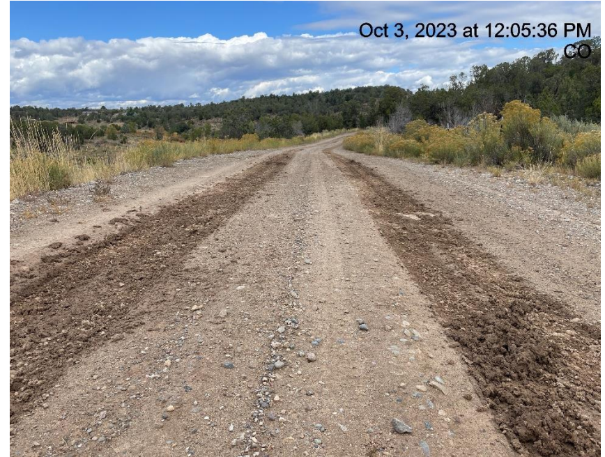
Photo # 1379 Vehicle tracking onto lease road/insufficient tracking BMP's