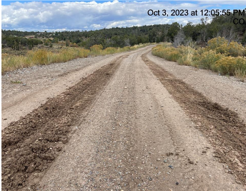
Photo # 1382 Vehicle tracking onto lease road/insufficient tracking BMP's