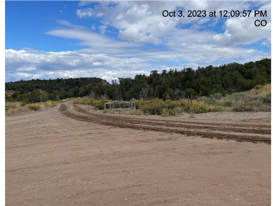
Photo # 1393 Vehicle tracking onto lease road/insufficient tracking BMP's