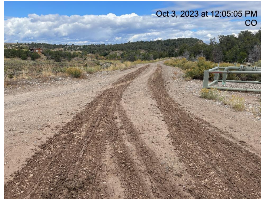
Photo # 1376 Vehicle tracking onto lease road/insufficient tracking BMP's