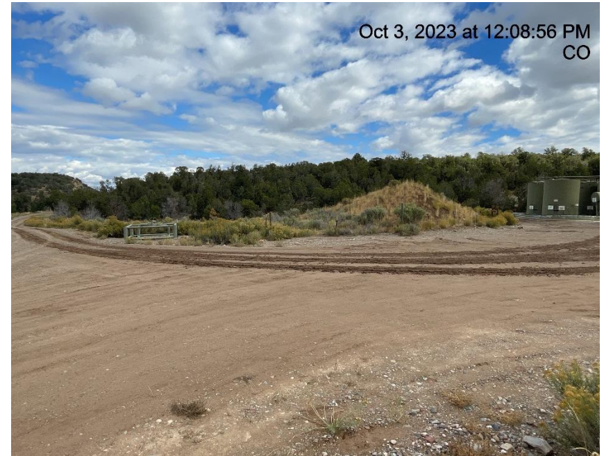
Photo # 1391 Vehicle tracking onto lease road/insufficient tracking BMP's