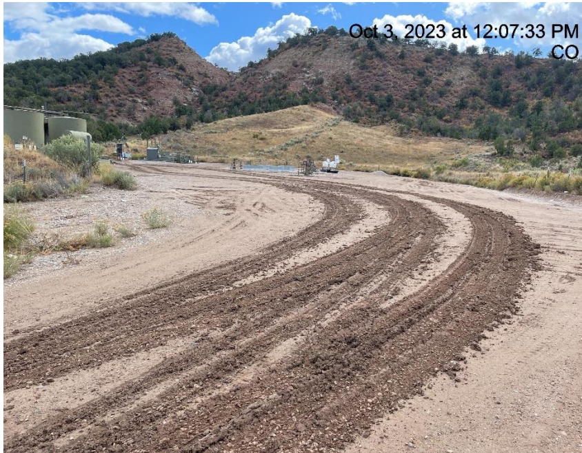
Photo # 1388 Vehicle tracking onto lease road/insufficient tracking BMP's