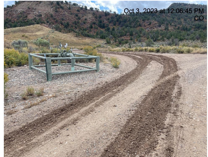
Photo # 1385 Vehicle tracking onto lease road/insufficient tracking BMP's