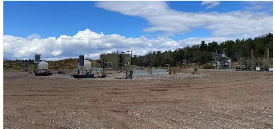
South East corner of location.