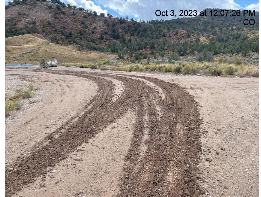
Photo # 1387 Vehicle tracking onto lease road/insufficient tracking BMP's