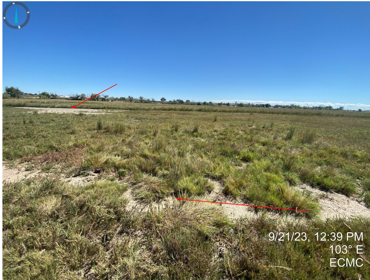
Photo 1. Taken near the former wellhead. Portions of the former wellhead are progressing towards reclamation standards, however, areas of bare/exposed soils exist near the wellhead and access road. Additional reclamation activities are required.