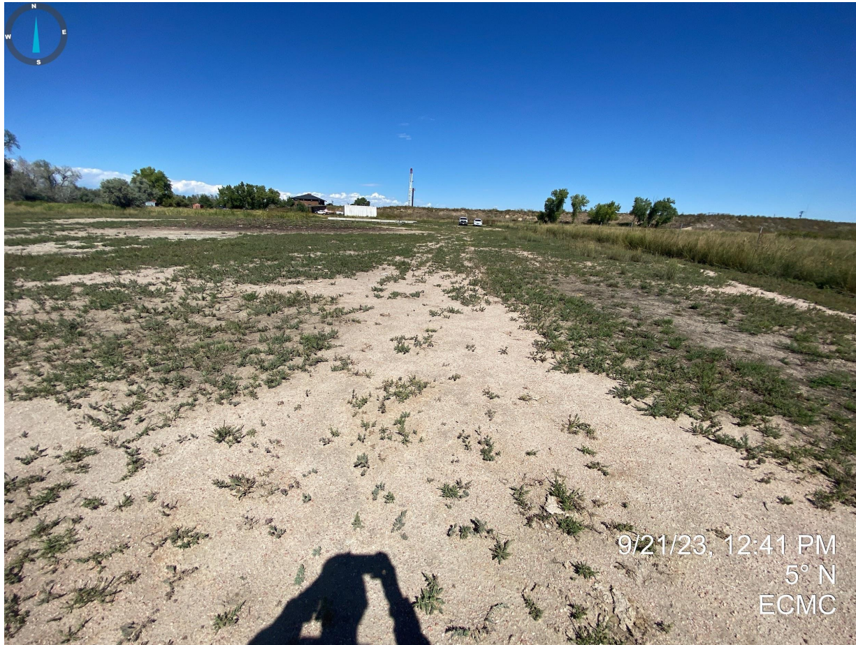
Photo 3. Taken from the southern point of the access road. See comments in Photo 1.