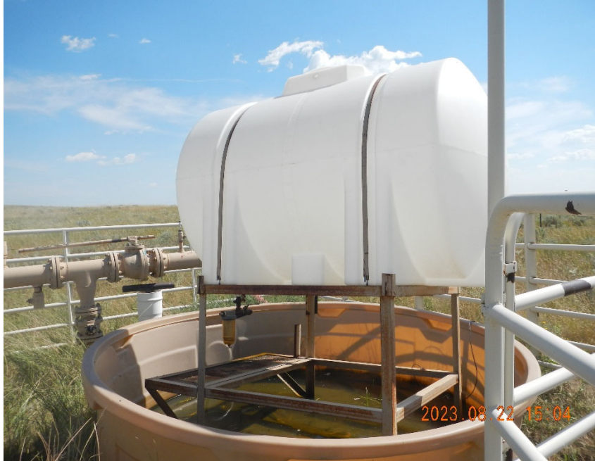
7. View of tank at Pig Station with no placards and Open Topped Containment with no wildlife screening.