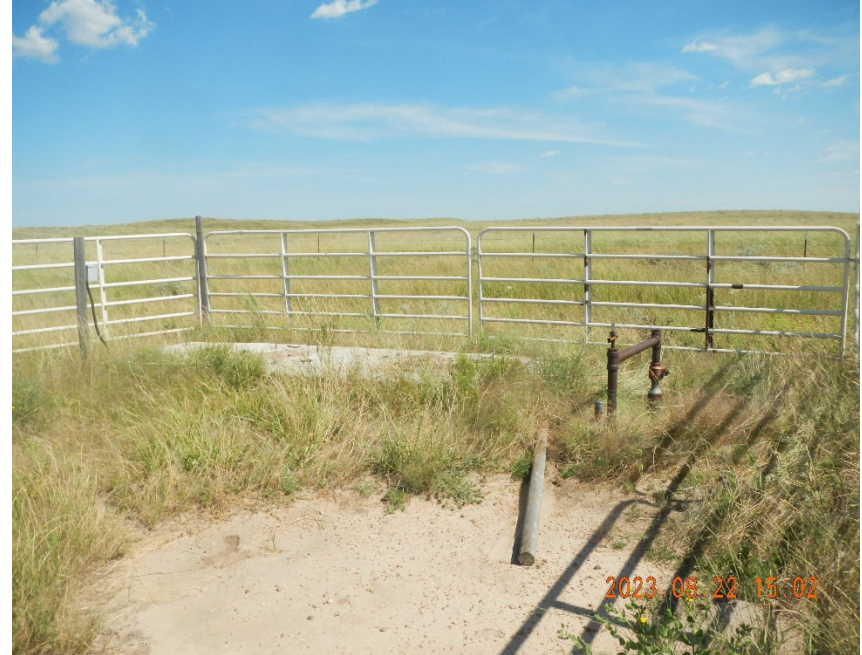
8. Over view of well site inside fencing.