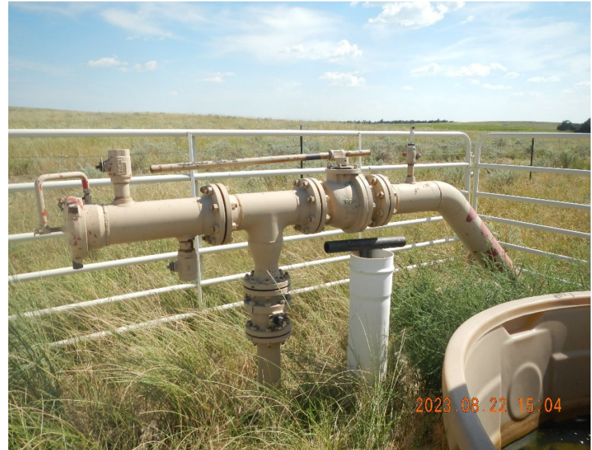
6. View of Pig Station. Note vegetation inside fencing.