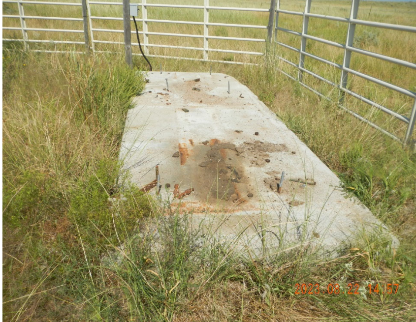
3. View of concrete pad. Note weeds.