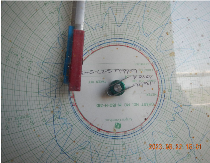
5. Chart in meter box at time of inspection.