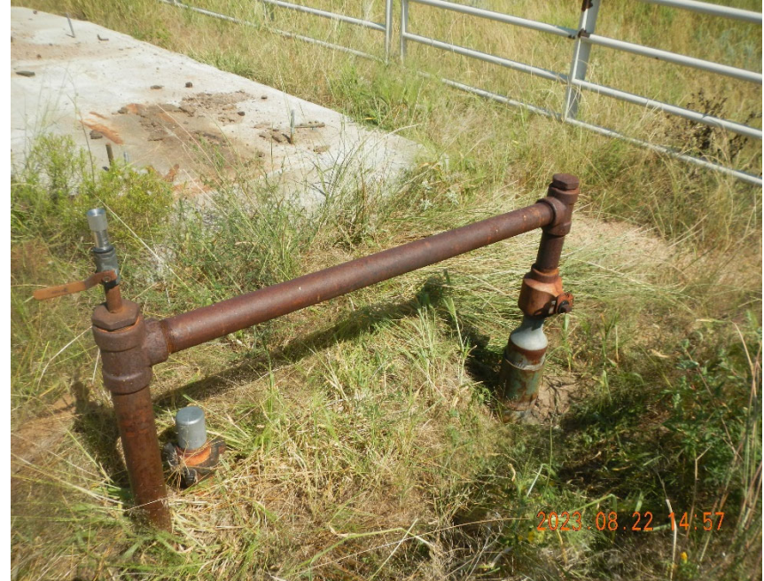
2. View of wellhead.