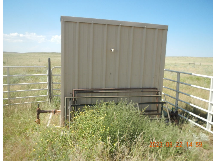
4. View of meter shed. Note Pump Jack barriers left at well site.