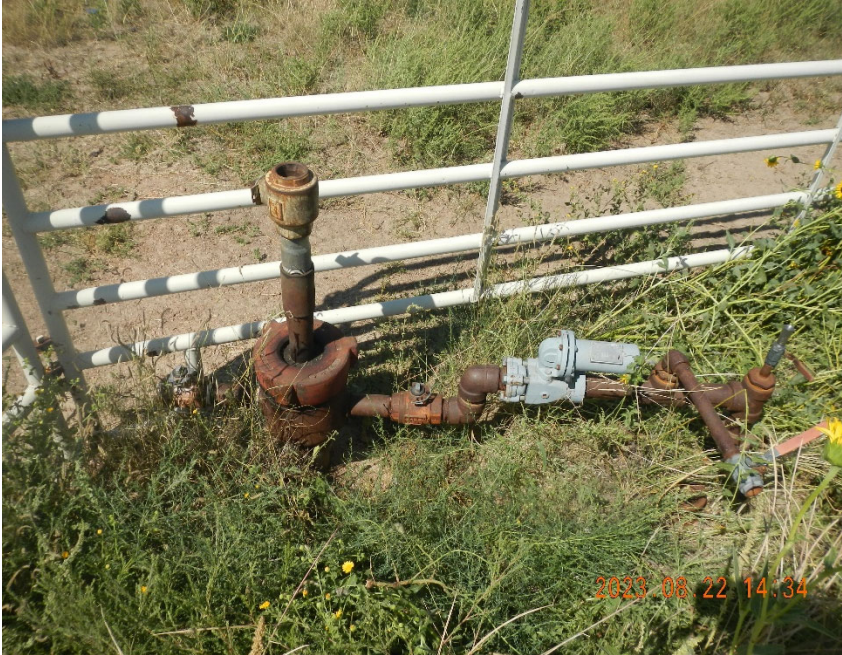
3. View of wellhead.