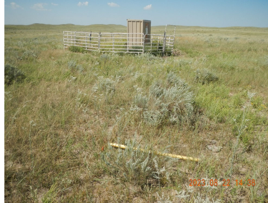
8. One of 3 Deadmen markers found down at time of inspection.