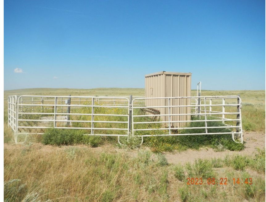
10. Location over view. Note weeds inside fencing.