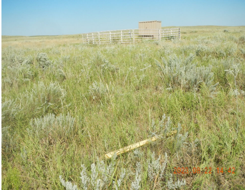
9. One of 3 Deadmen markers found down at time of inspection.