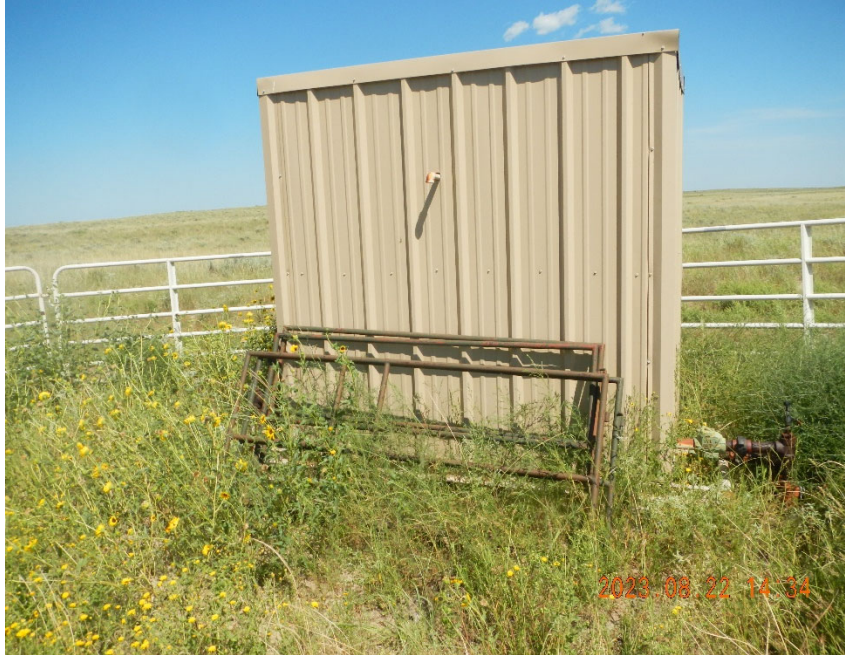
5. View of meter shed. Note Pump Jack barriers left at well site.