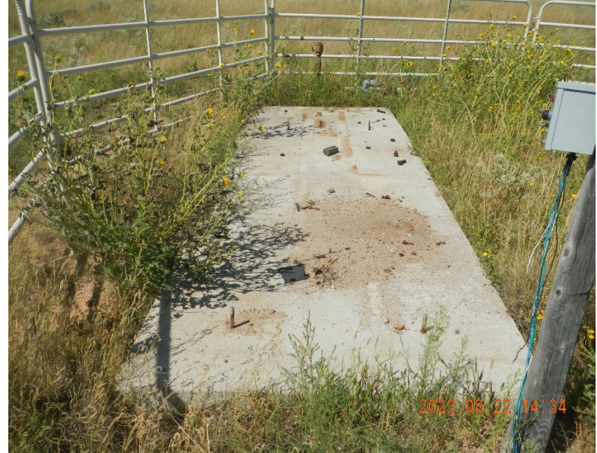
4. View of concrete pad left at well site. Note weeds.