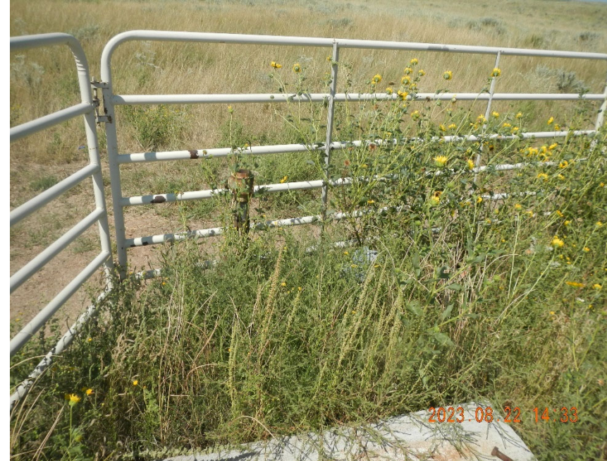
2. View of wellhead covered in weeds.