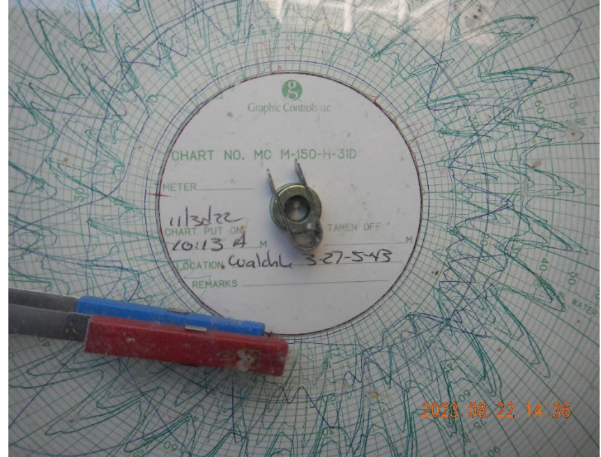
6. View of chart in meter box at time of inspection.