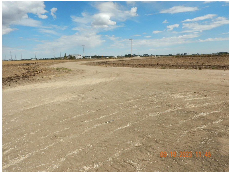
Photo 4. Photo taken from the northern well location, facing Northeast. Photo illustrates the Operator has performed interim reclamation activities.

Staff will conduct a future evaluation of interim reclamation areas, including flowline areas after two growing seasons, which will be in 2024.