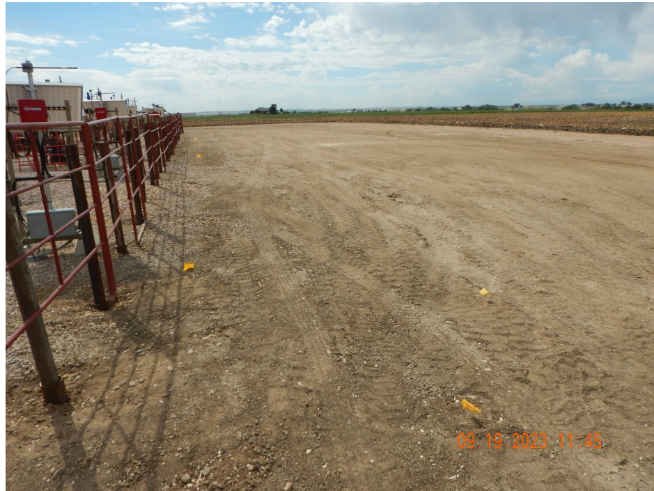
Photo 6. Photo taken from the northern well location along the western wellheads, facing South. See comments under Photo 4.