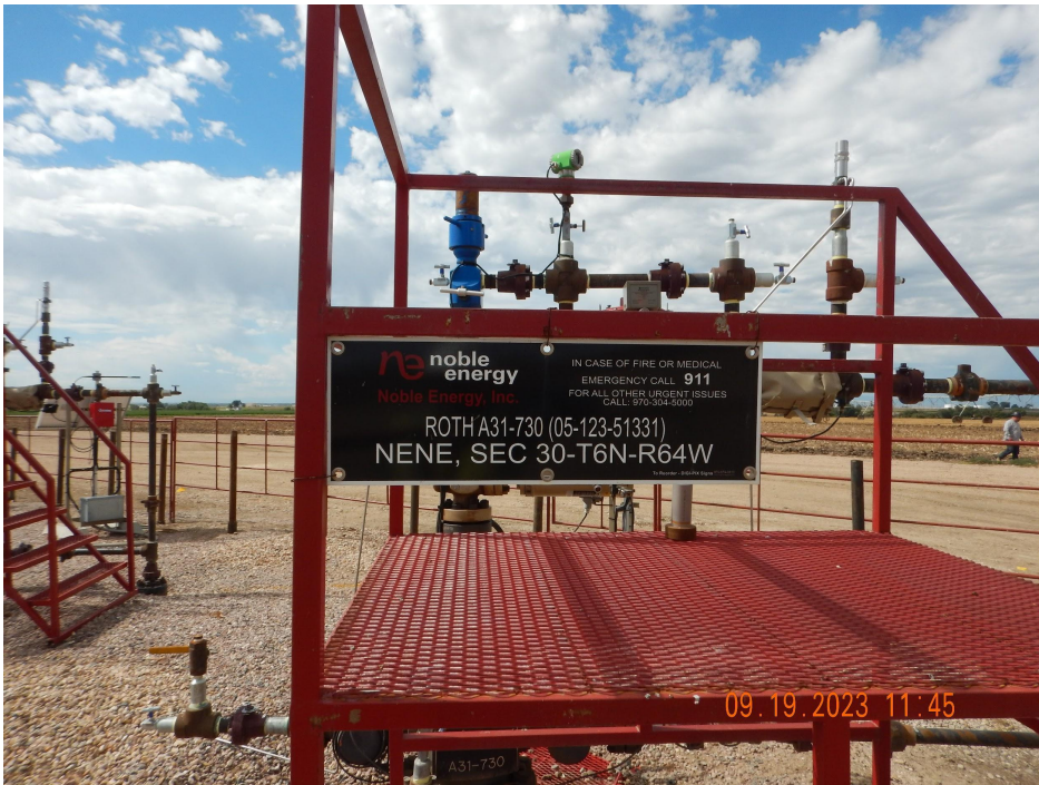
Photo 3. Photo taken from the well location of a wellhead signage.