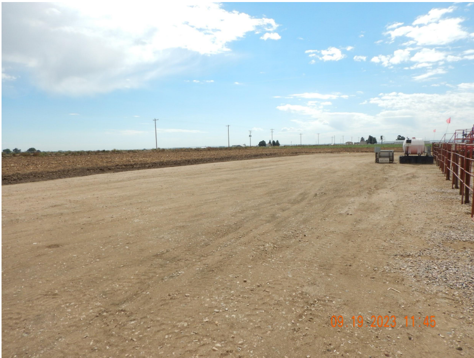
Photo 5. Photo taken from the northern well location along the eastern wellheads, facing South. See comments under Photo 4.