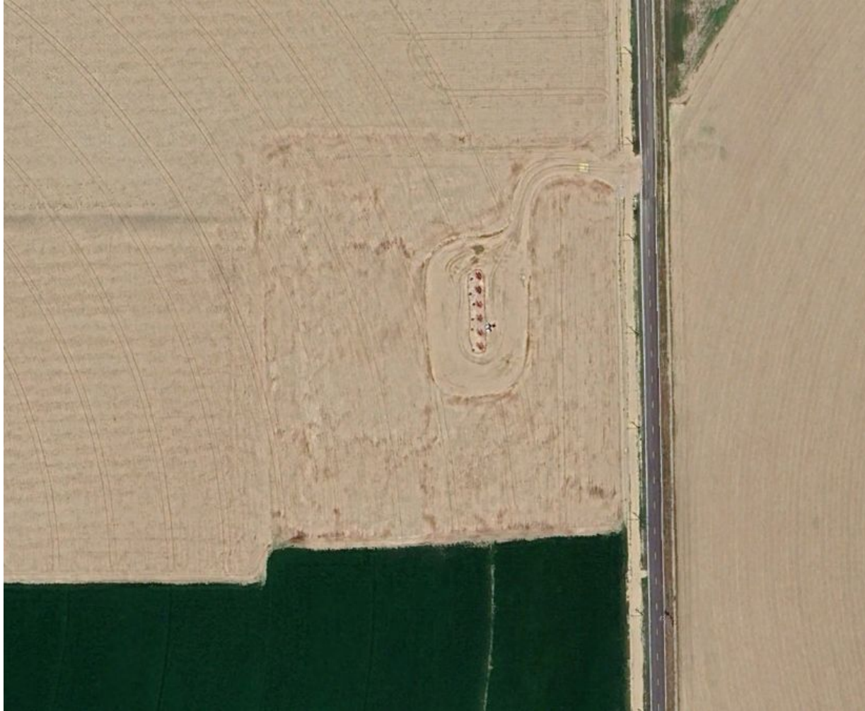
Photo 2. Google Earth aerial imagery taken on 5/29/2023 illustrating that interim reclamation has been performed.