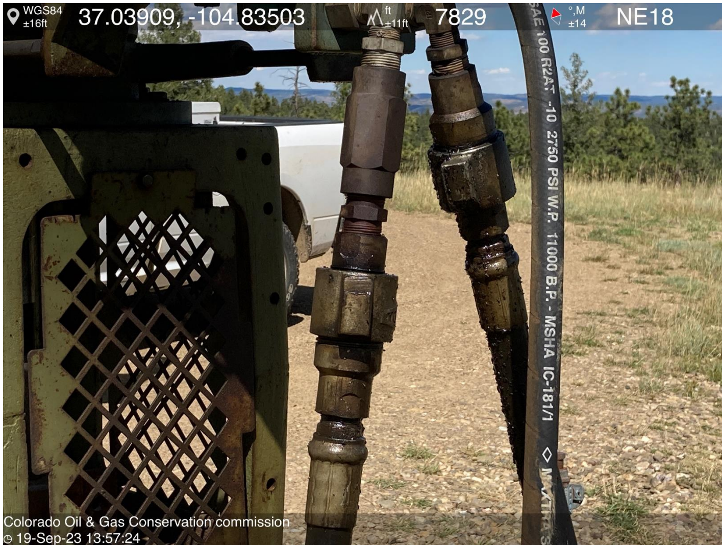
PHOTO 4: QUICK CONNECTIONS ON DYDRO HOSES ARE LEAKING. Conduct maintenance on equipment, cleanup stained material and review self inspection processes. COMPLY WITH RULE 1002,(2).D. CA DATE 9-30-2023.