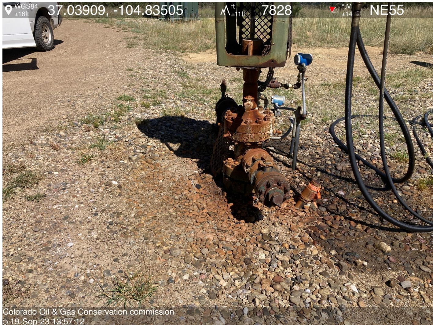
PHOTO 6: RUST COLORED IMPACTED SOIL APPEARS TO BE FROM ROD PACKING LEAKING OVER MULTIPLE EVENTS. Conduct maintenance on equipment, cleanup stained material and review self inspection processes. COMPLY WITH RULE 1002,(2).D. CA DATE 9-30-2023.