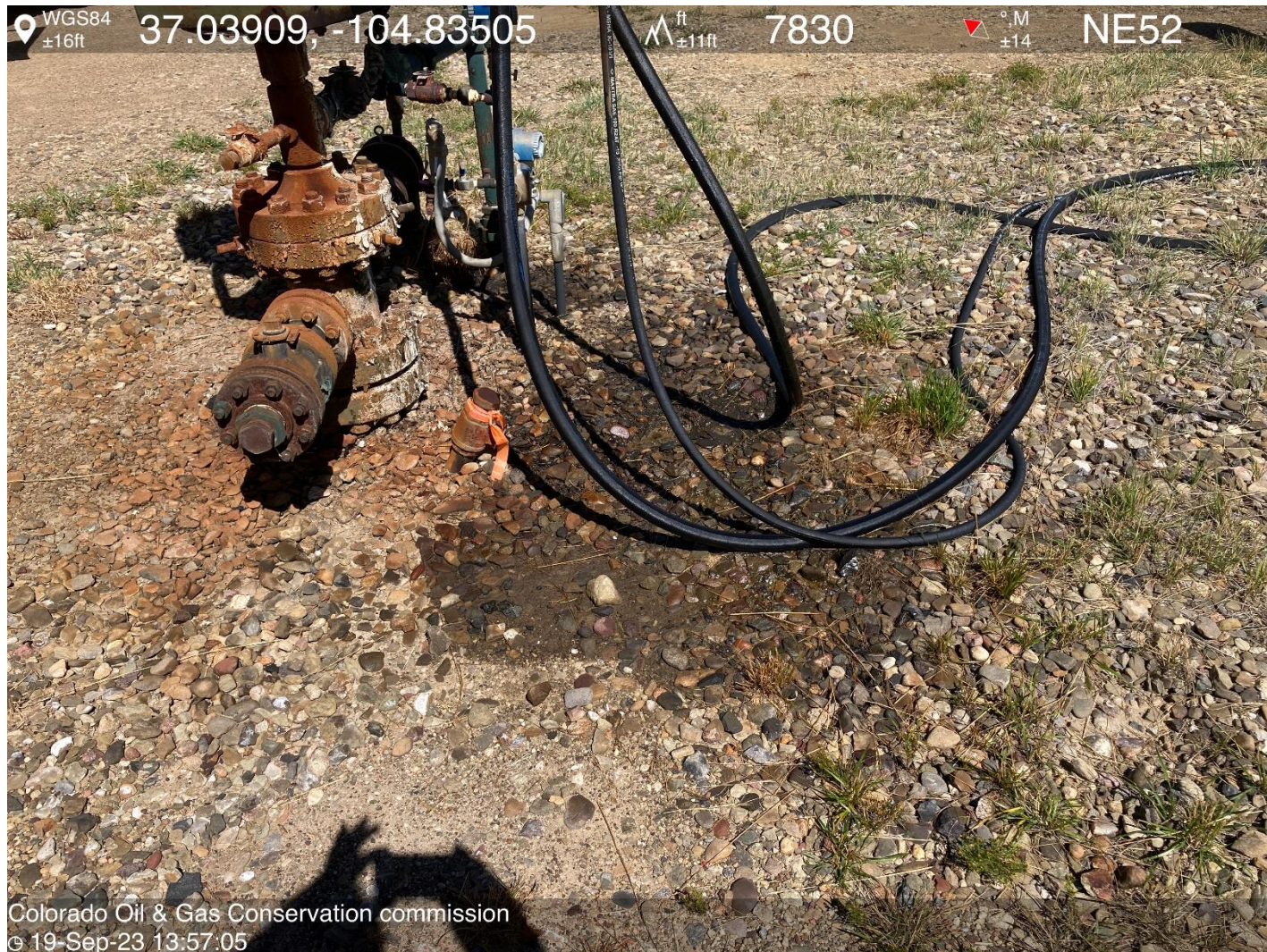
PHOTO 5: AREA OF IMPACTED SOIL UNDER DYDRO QUICK CONNECT HOSED. Conduct maintenance on equipment, cleanup stained material and review self inspection processes. COMPLY WITH RULE 1002,(2).D. CA DATE 9-30-2023.