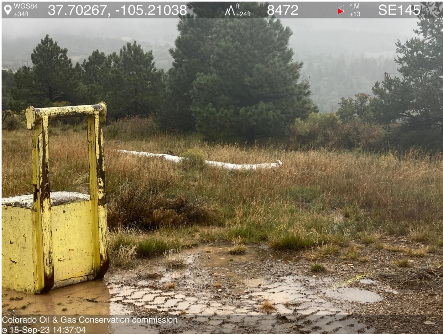
PHOTO 4: Unused equipment. Sells line removed from well head laying behind Sheep Mountain Unit 3-15B Temporary Abandoned well. Comply with Rule 606. THIS IS THE SECOND NOTICE FOR THIS CA, IMMEDIATE ACTION IS REQUIRED.