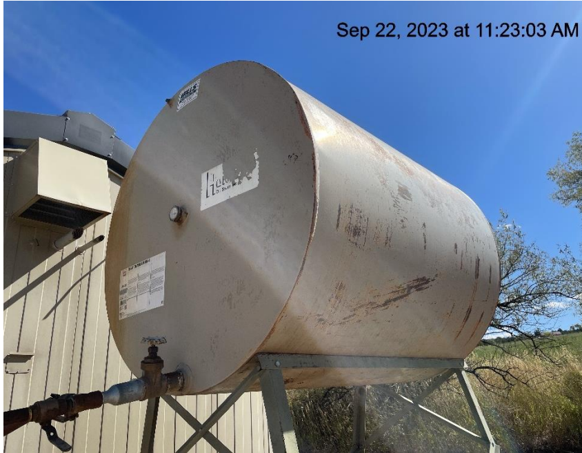
Photo # 276 Tank not properly labeled/missing required information