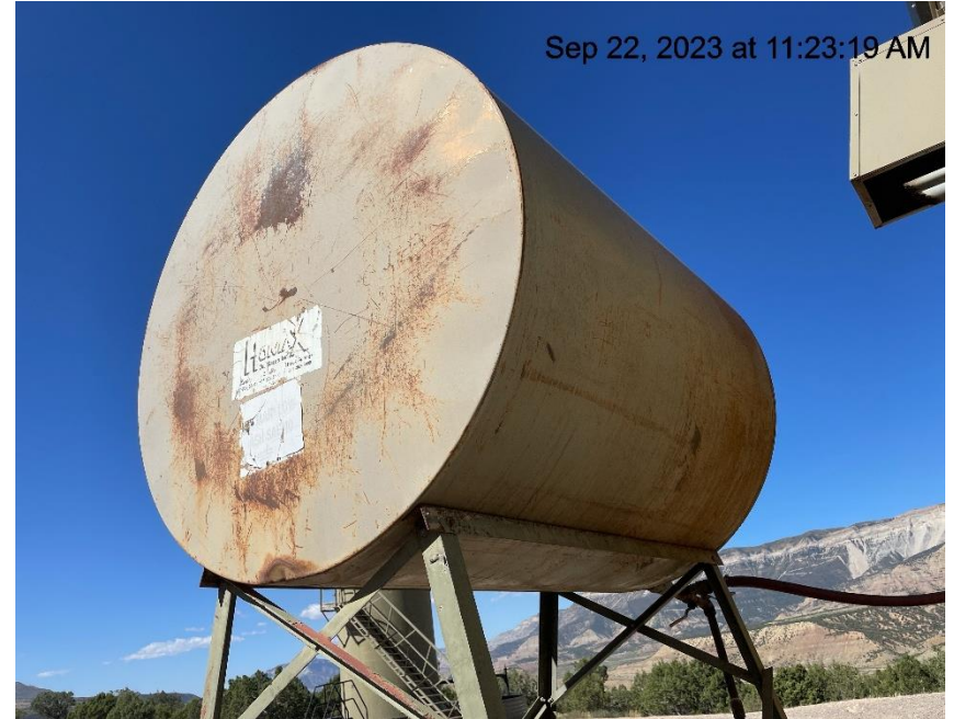
Photo # 277 Tank not properly labeled/missing required information