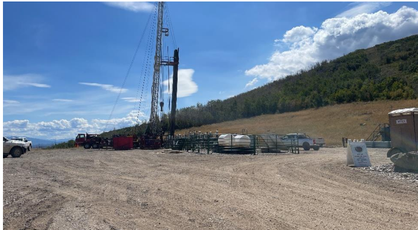
North West corner of location.