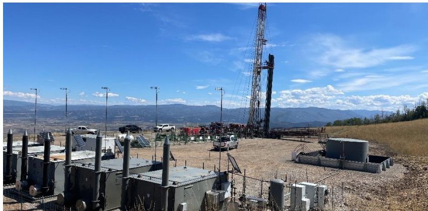
South West corner of location.