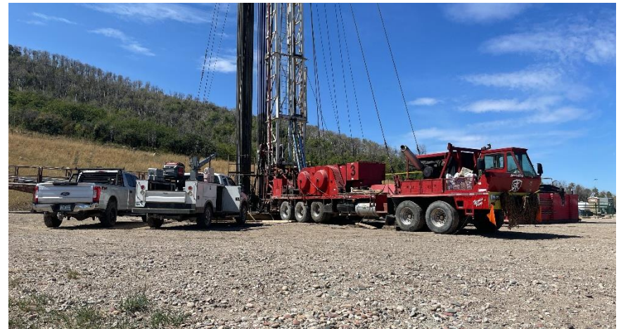
North East corner of location.