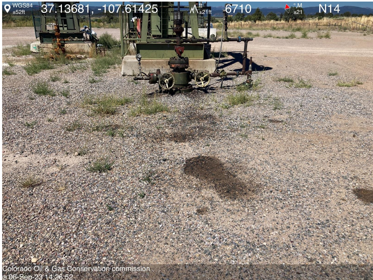
PHOTO 10: Oily waste appears to be from rod box impacting soil near wellhead. Securely fasten all valves, pipes, fittings, and Production Facilities to ensure good mechanical condition, inspect at regular intervals and maintain in good mechanical condition and dispose of impacted materials per Rule 608.e. ca date 10-6-2023.