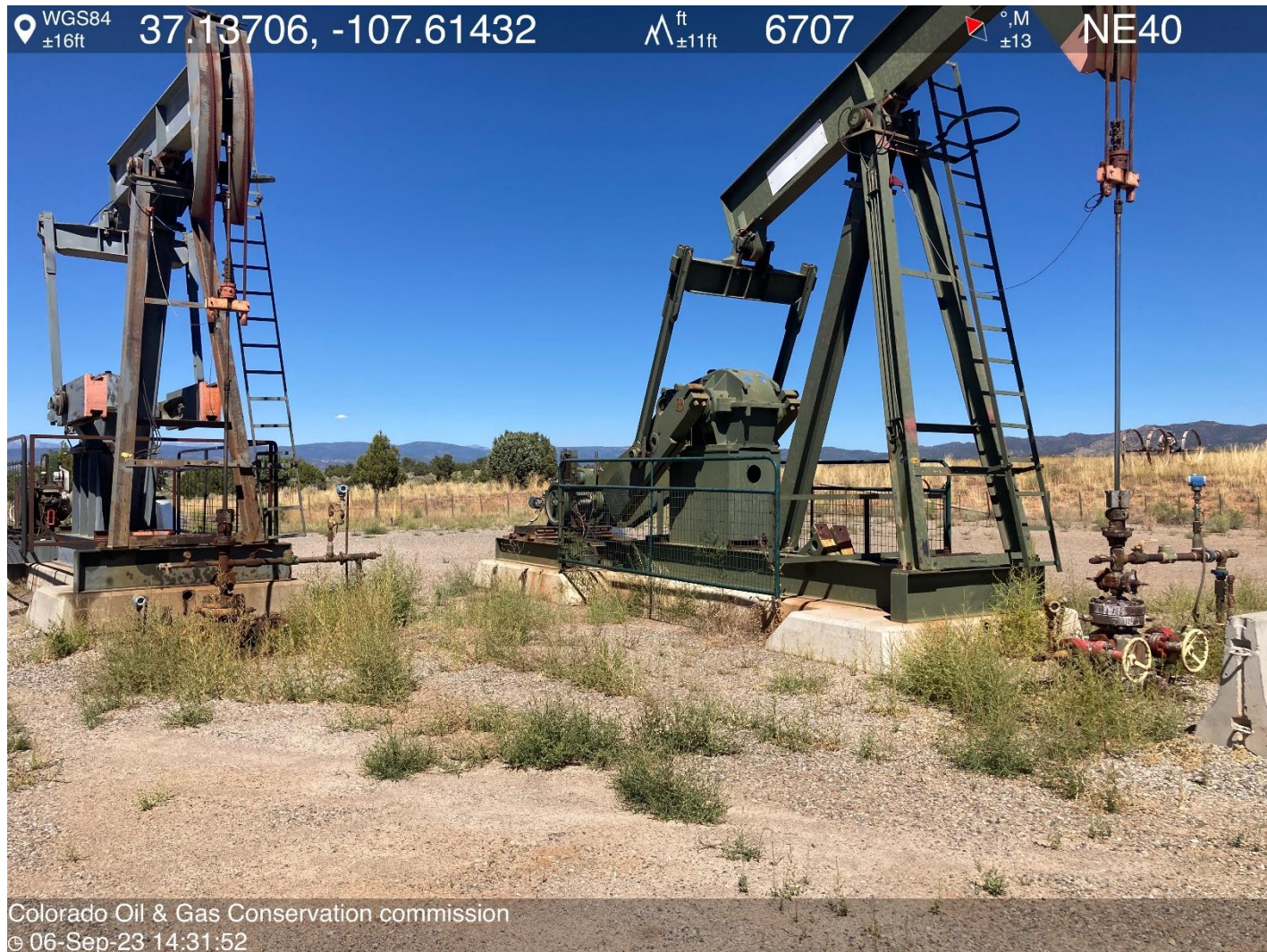
PHOTO 6: WEED MAINTENANCE AROUND PUMP JACKS. MAINTIAN WEEDS PER RULE 606. CA DATE 10-6-2023.