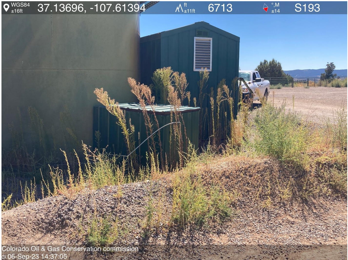
PHOTO 12: Tall weeds on and inside berms. Maintain berms/ remove weeds along with there root structures per rule 605.a. ca date 10-6-2023.