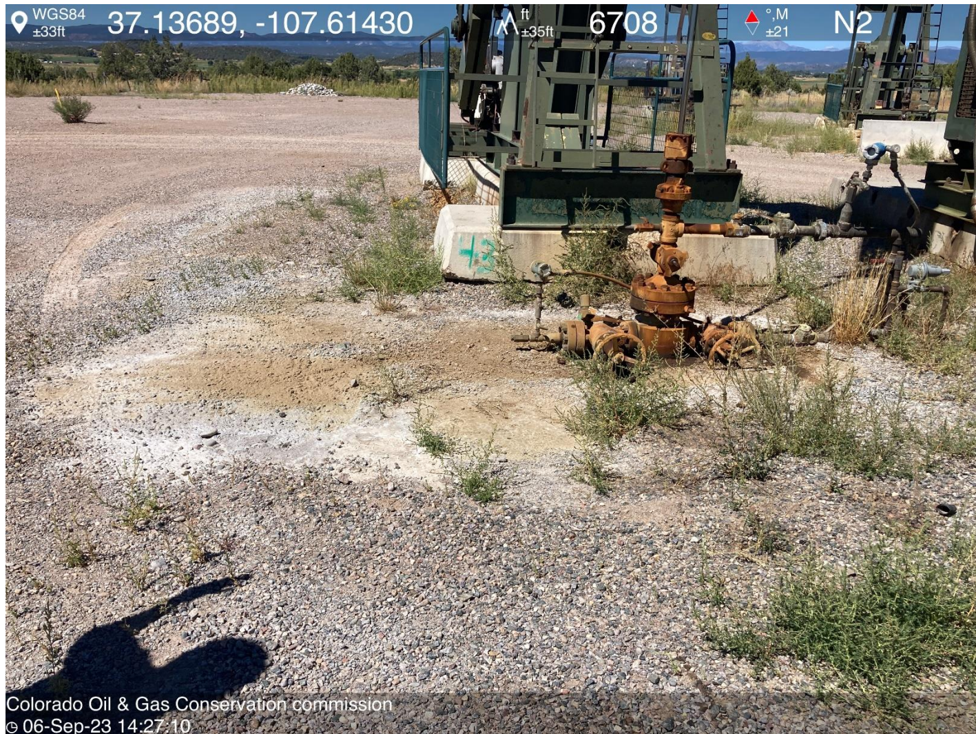
PHOTO 7: WEED MAINTENANCE AROUND PUMP JACKS. MAINTIAN WEEDS PER RULE 606. CA DATE 10-6-2023.