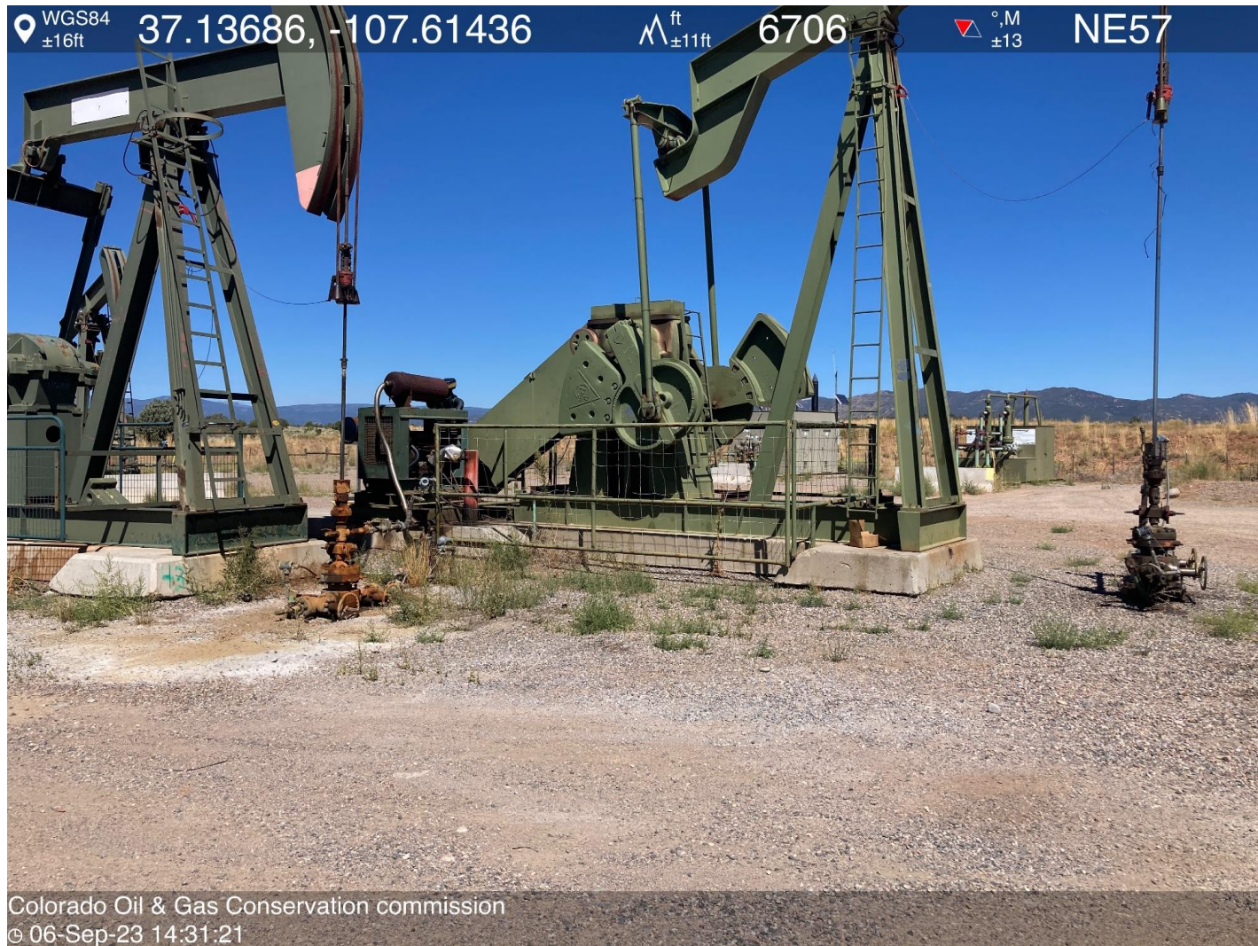
PHOTO 4: WELLHEAD AND EQUIPMENT. NO WELL SIGN IDENTIFYING EACH WELL. POST SIGN PER RULE 605 10-6-2023.