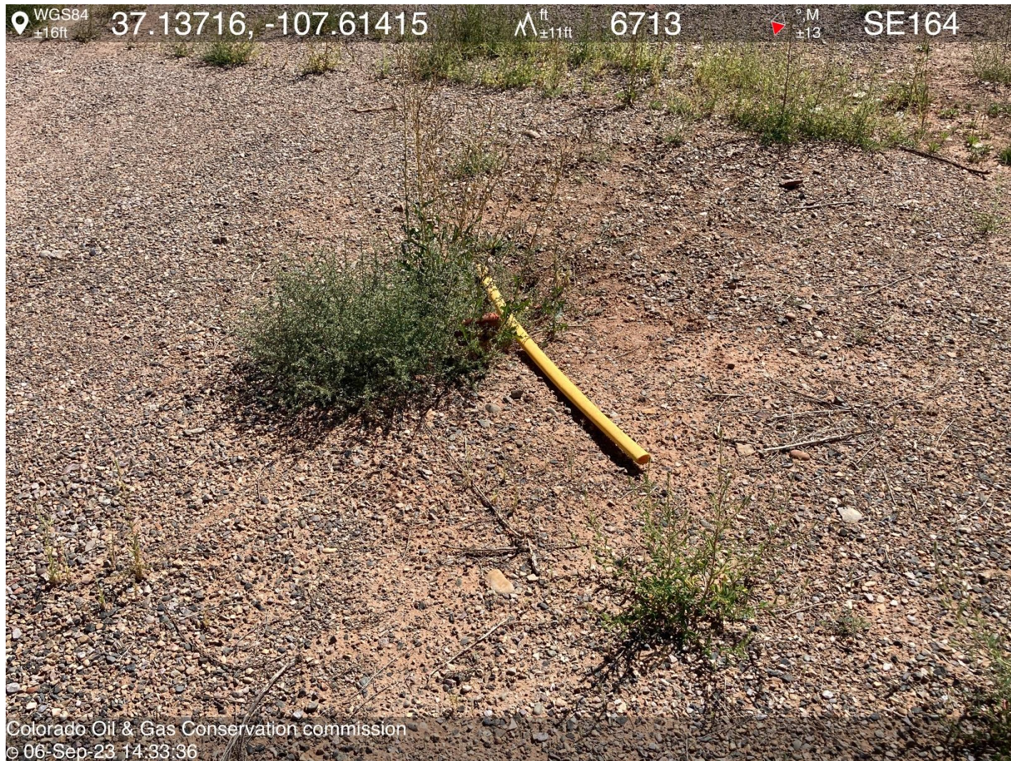
PHOTO 14: There are several anchor markers down or missing throughout location. Install proper guy line markers per Rule 1003.a ca date 10-6-2023.