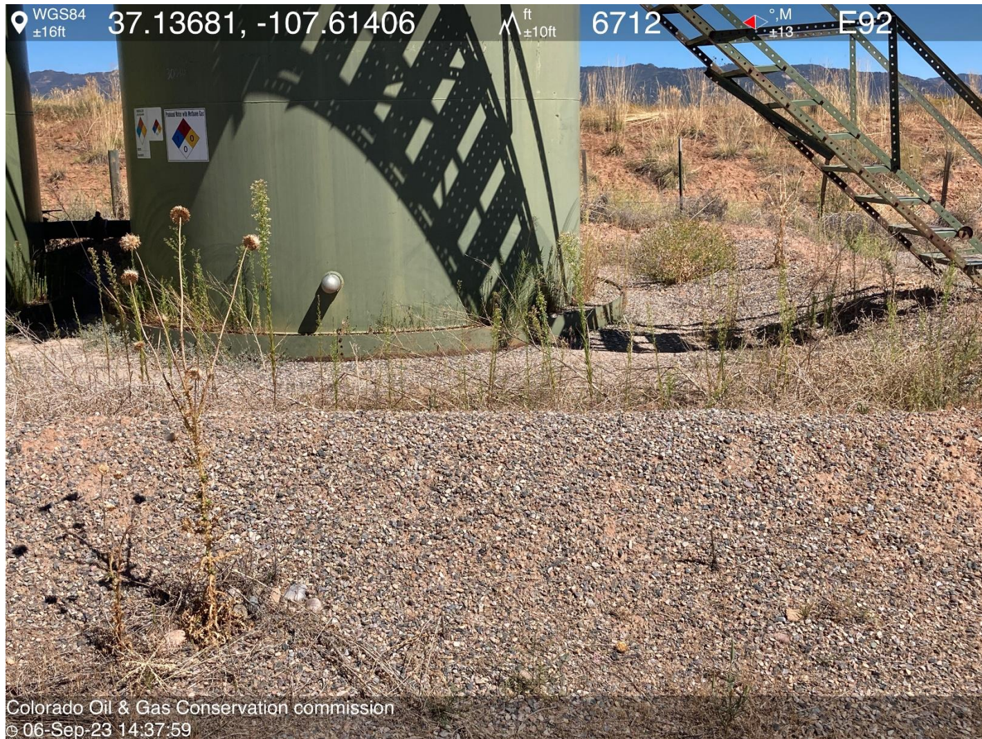
PHOTO 13: Tall weeds on and inside berms. Maintain berms/ remove weeds along with there root structures per rule 605.a. ca date 10-6-2023.