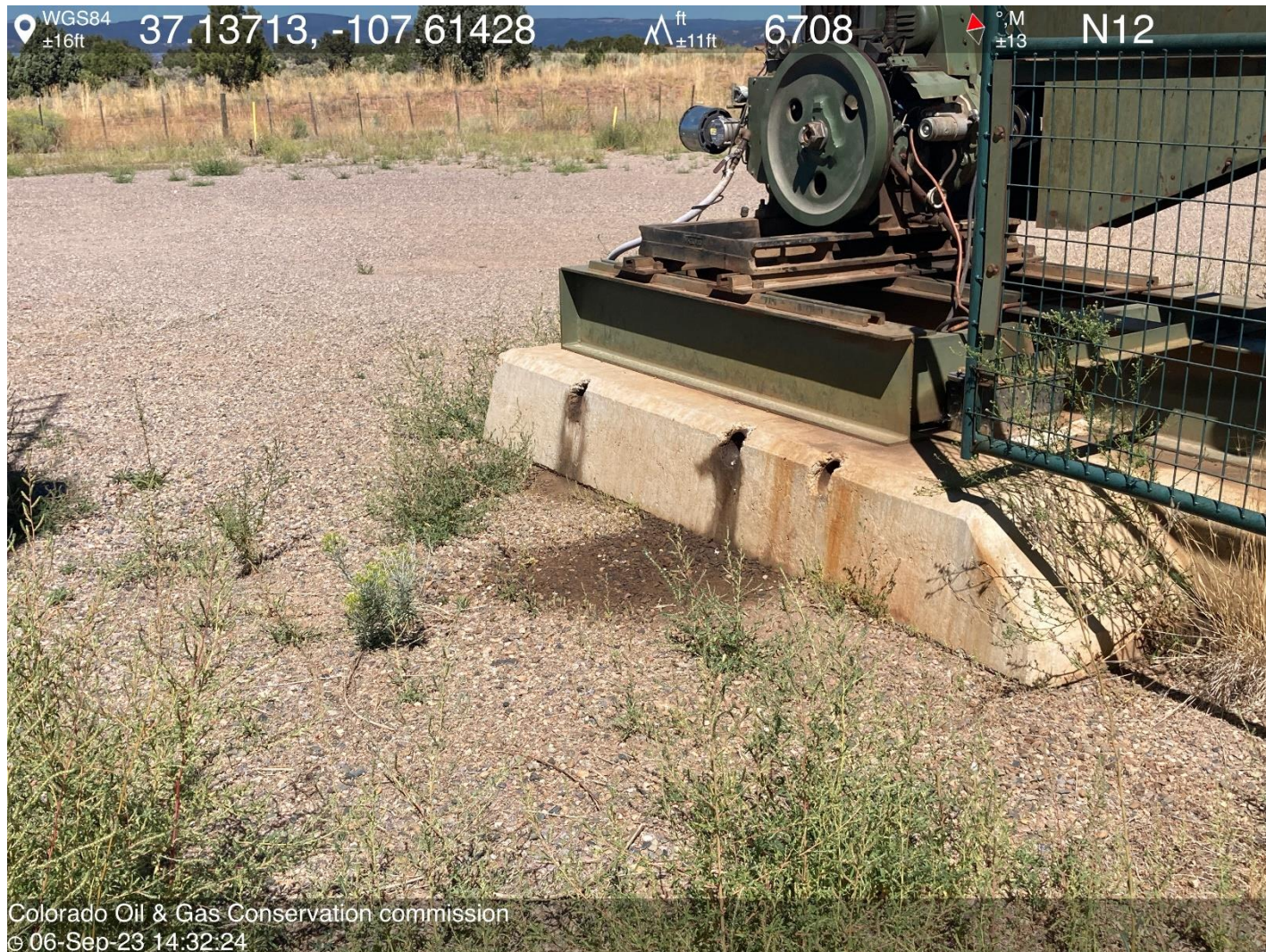
PHOTO 11: Oily waste appears to be from pump jack prime mover is impacting soil near prime mover. Securely fasten all valves, pipes, fittings, and Production Facilities to ensure good mechanical condition, inspect at regular intervals and maintain in good mechanical condition and dispose of impacted materials per Rule 608.e. ca date 10-6-2023.