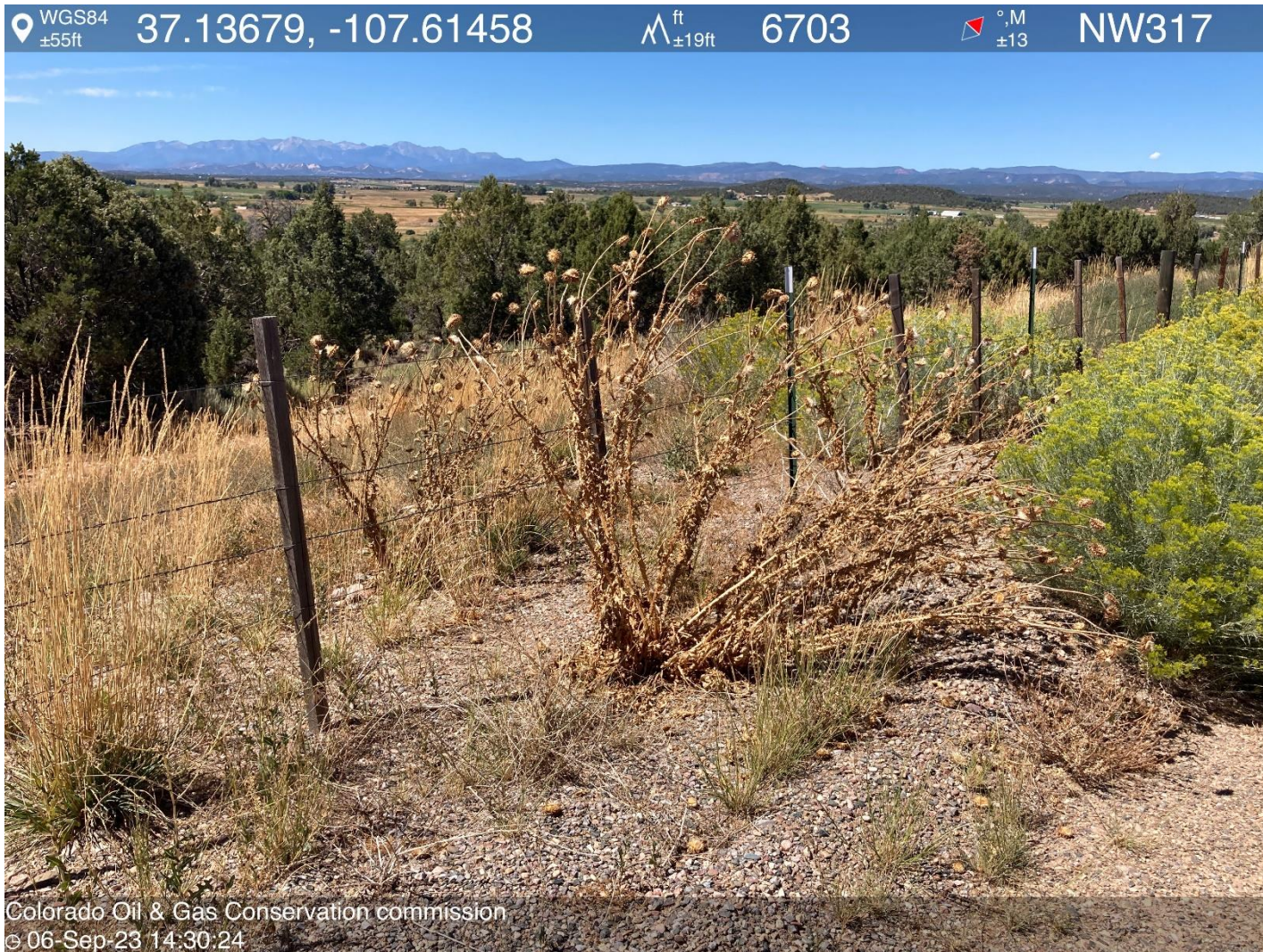
PHOTO 16: Noxious weeds ca from previous inspection appear to have been poisoned however they have been left on and around location . Properly bag and dispose of noxious weeds per rule 1003.