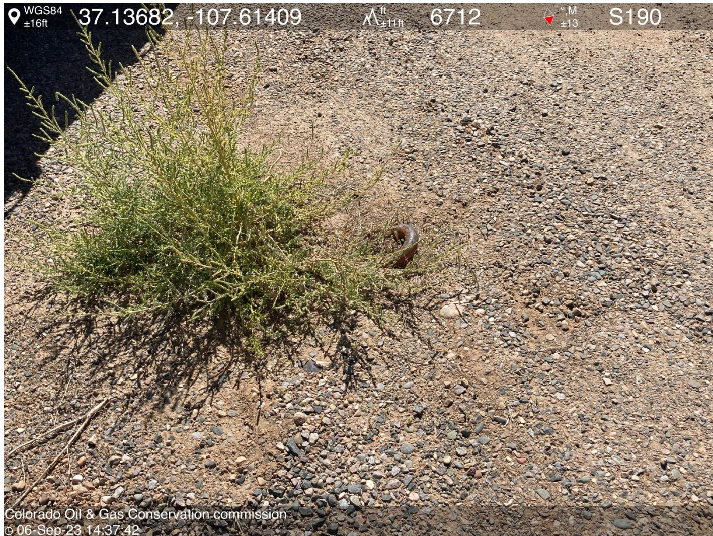
PHOTO 15: There are several anchor markers down or missing throughout location. Install proper guy line markers per Rule 1003.a ca date 10-6-2023.