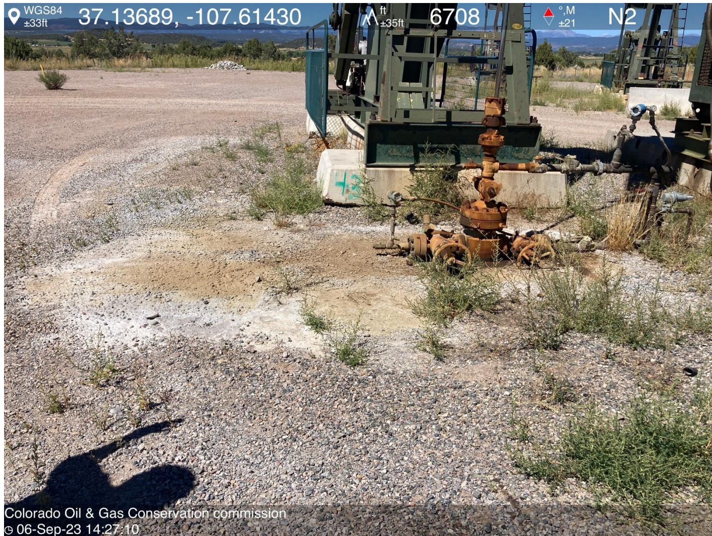
PHOTO 9: Produced water spill from the wellhead has left a salt/mineral impacted area around the wellhead. Securely fasten all valves, pipes, fittings, and Production Facilities to ensure good mechanical condition, inspect at regular intervals and maintain in good mechanical condition and dispose of impacted materials per Rule 608.e. ca date 10-6-2023.