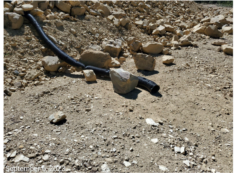
Photo 3: Slope drains have not been constructed with a properly engineered and armored outlet.