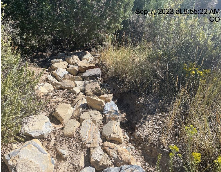
Photo # 8503 Rip Rap needs maintenance/erosion & transport of sediment