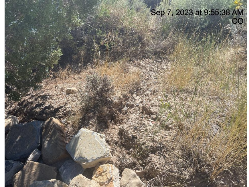
Photo # 8504 Rip Rap needs maintenance/erosion & transport of sediment