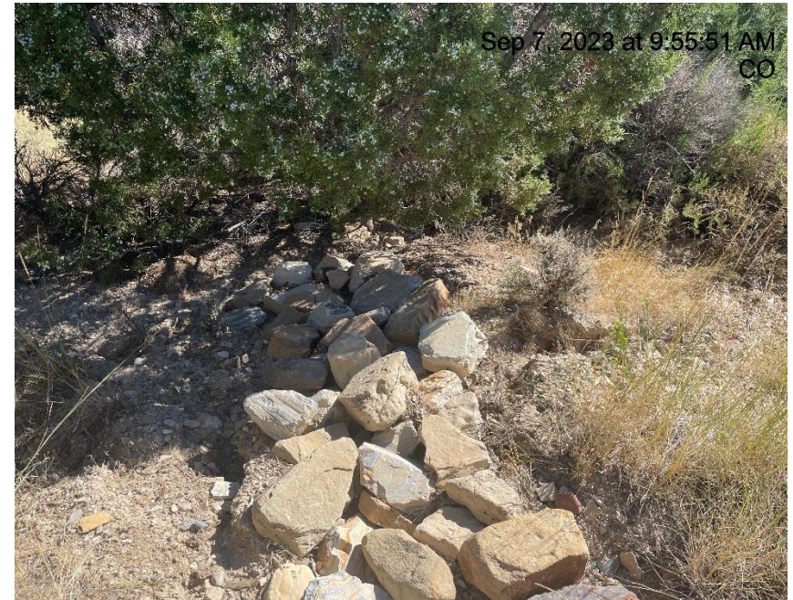
Photo # 8506 Rip Rap needs maintenance/erosion & transport of sediment