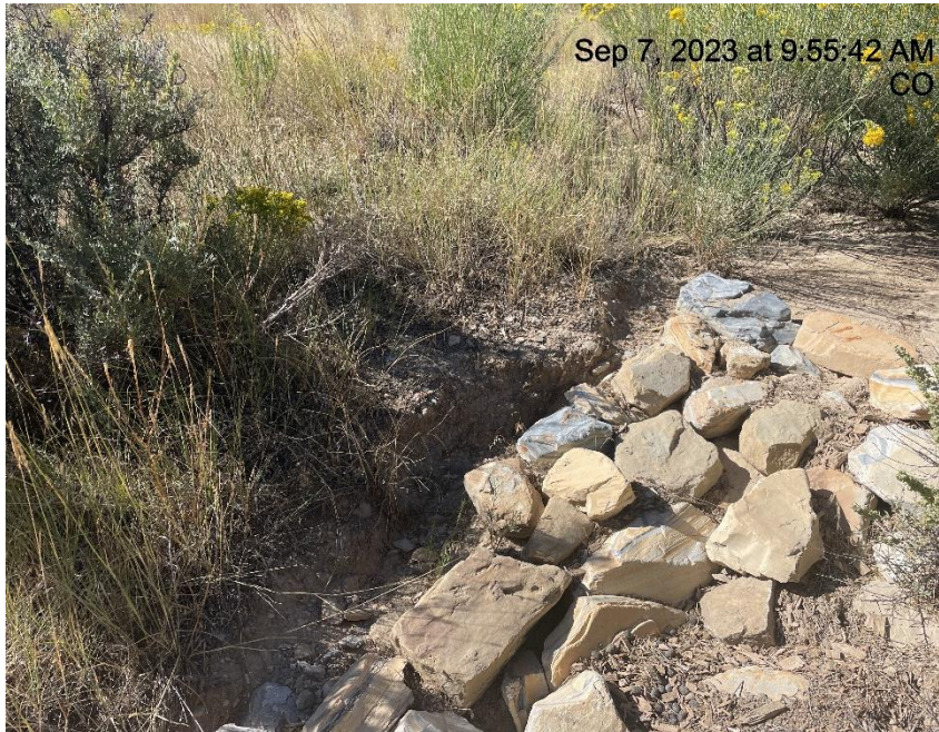
Photo # 8505 Rip Rap needs maintenance/erosion & transport of sediment