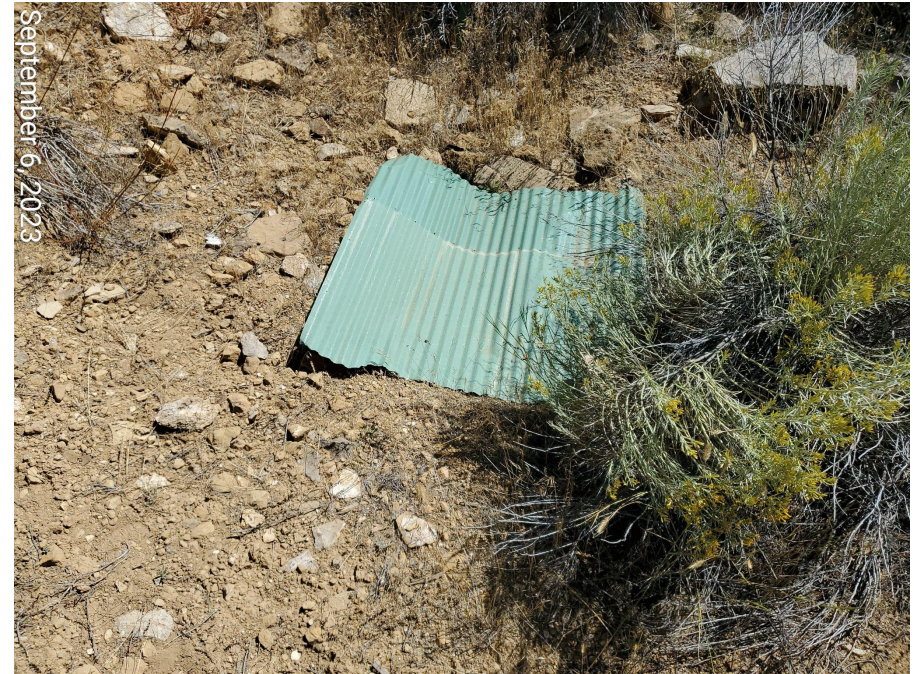
Photo 2: Photo taken from the northeastern corner of the Location. Photo left example showing anchors have not been properly identified with a marker of bright color not less than 4 feet in height. Photo right shows trash debris next to marker.