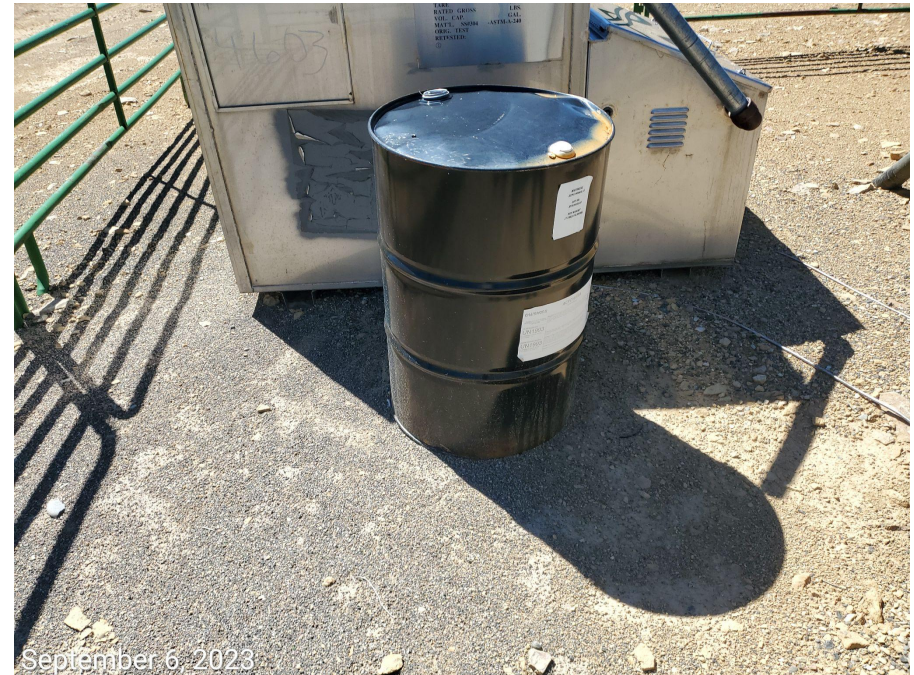
Photo 4: Photos taken from the well. Photo left shows signage does not comport with ECMC requirements. Photo right shows unused barrel of “Paraffin” stored on Location.