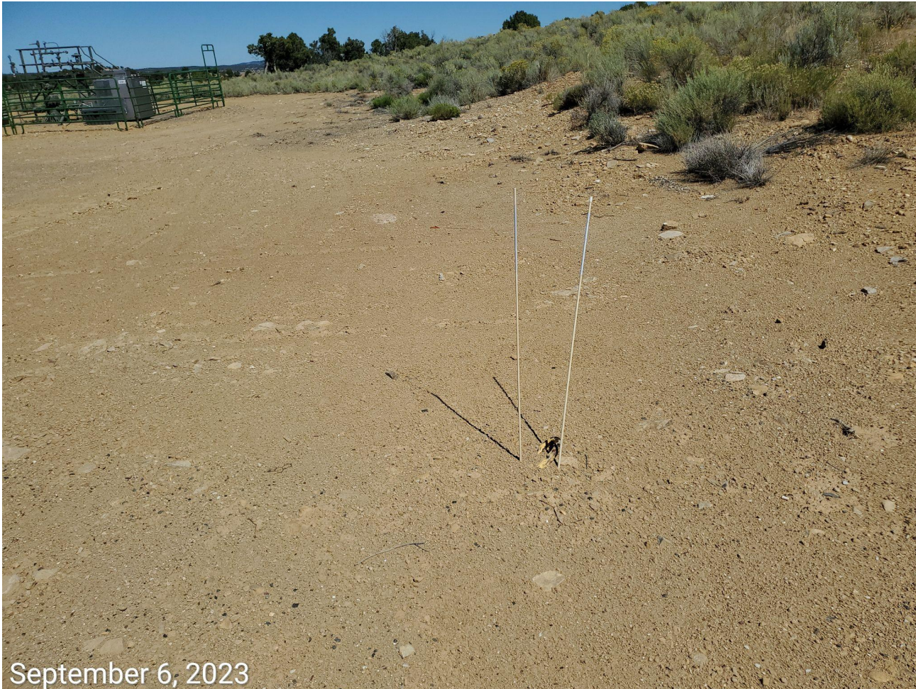
Photo 3: Photo example showing anchors have not been properly identified with a marker of bright color not less than 4 feet in height. Marker for the SW anchor missing.