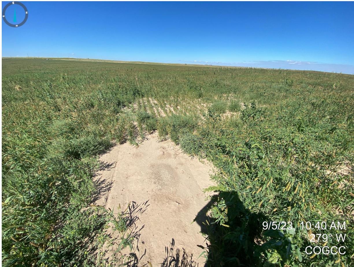
Photo 5. Bare/exposed soils and undesirable vegetation (e.g. russian thistle and kochia) observed throughout the reclaimed area.