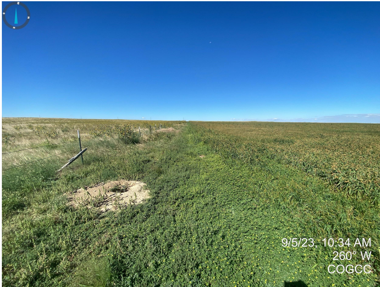
Photo 3. Facing west from the easternmost point of the access road; see comments in Photo 1.