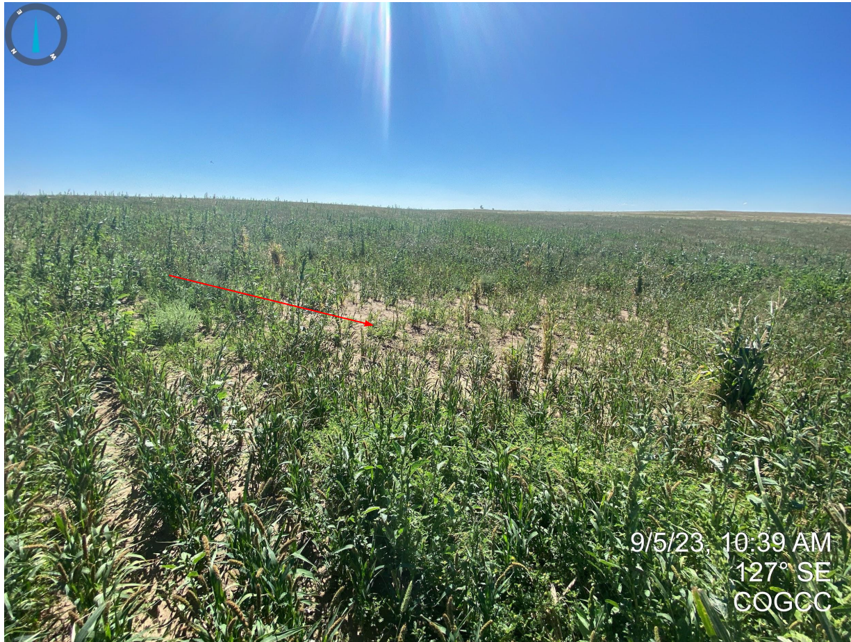
Photo 4. Taken from the former location, near the well. Non-uniform vegetative cover resulting in stunted crop growth and areas of bare/exposed soils.