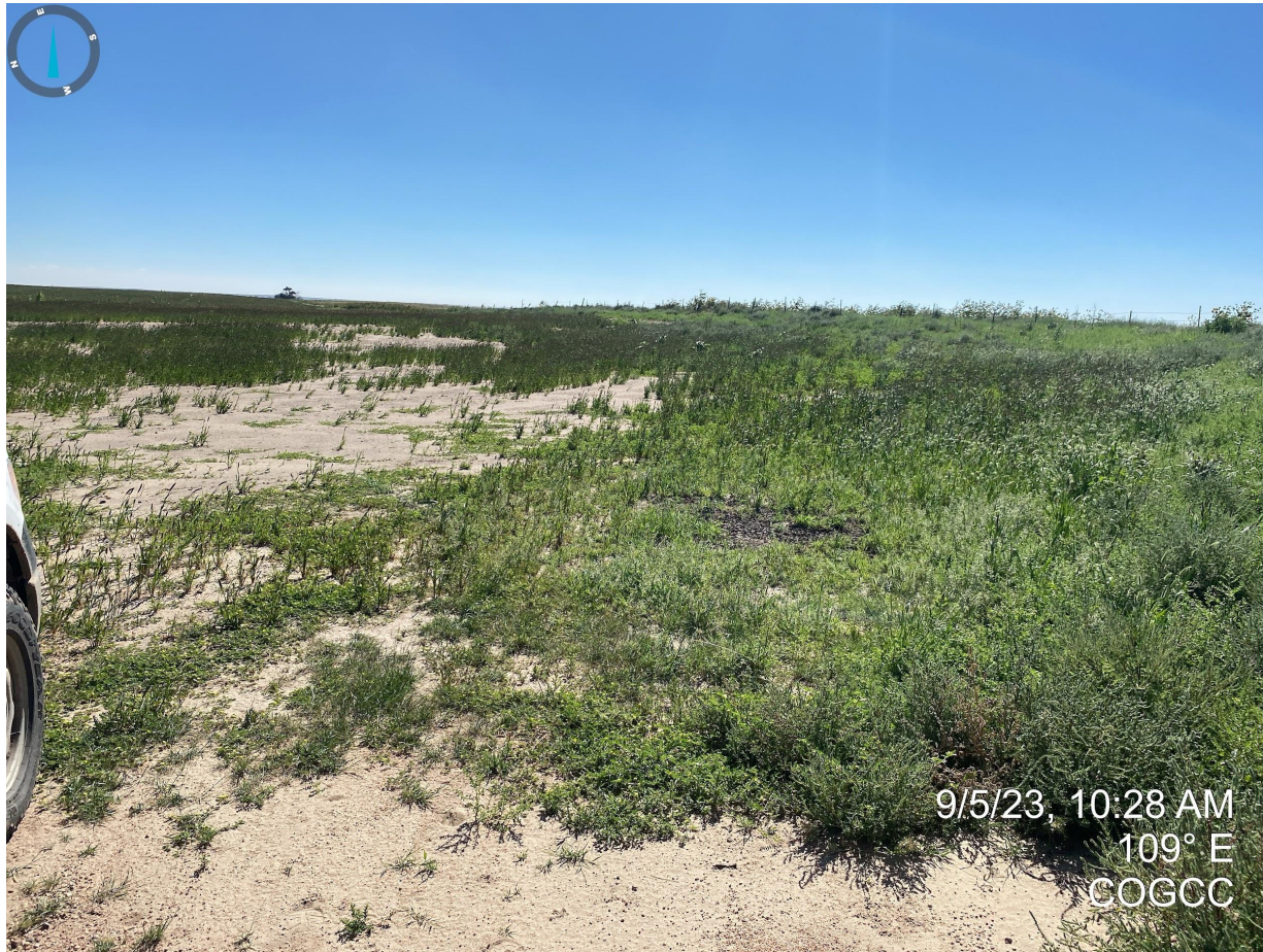
Photo 1. Taken from the entrance to the former location. It does not appear the former access road has been reclaimed with evidence of bare/exposed soils and undesirable vegetation. Additional reclamation activities are required for the former access road.