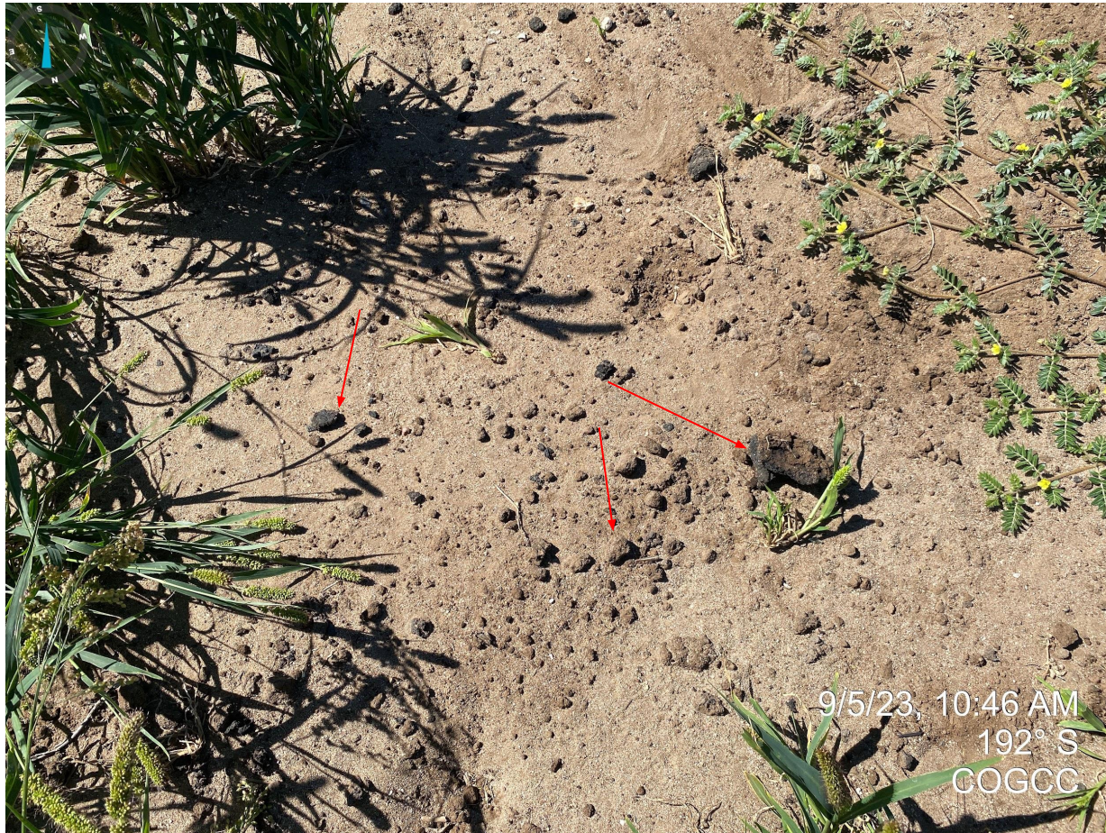
Photo 11. Stained soils (w/hydrocarbon odors) observed near the former pit location.