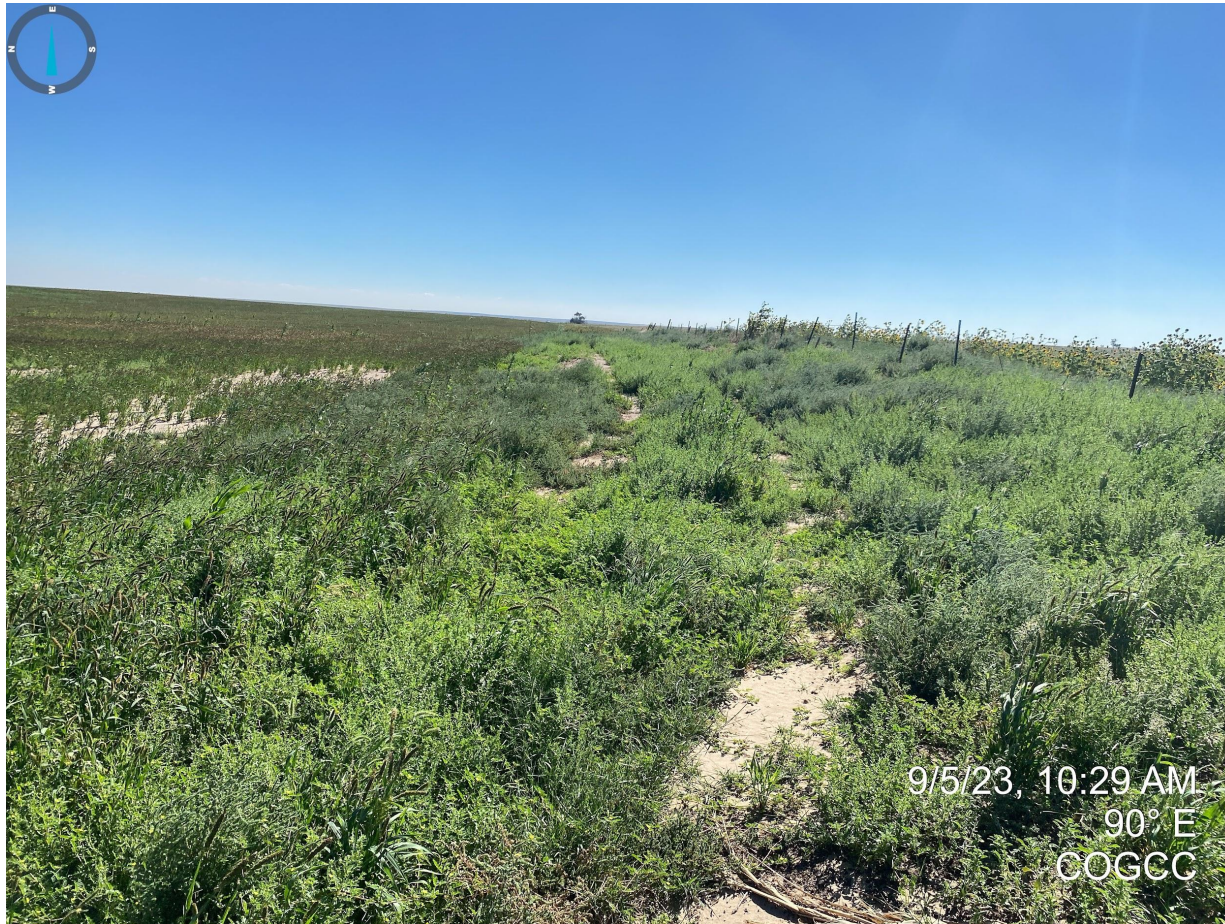
Photo 2. Taken from the former access road. See comments in Photo 1.