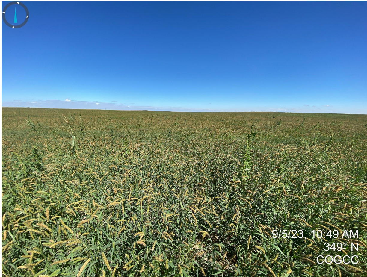
Photo 12. Reference area photo taken west of the location.

Inspection Photos Location Name: Wood 1 Location ID: 394686