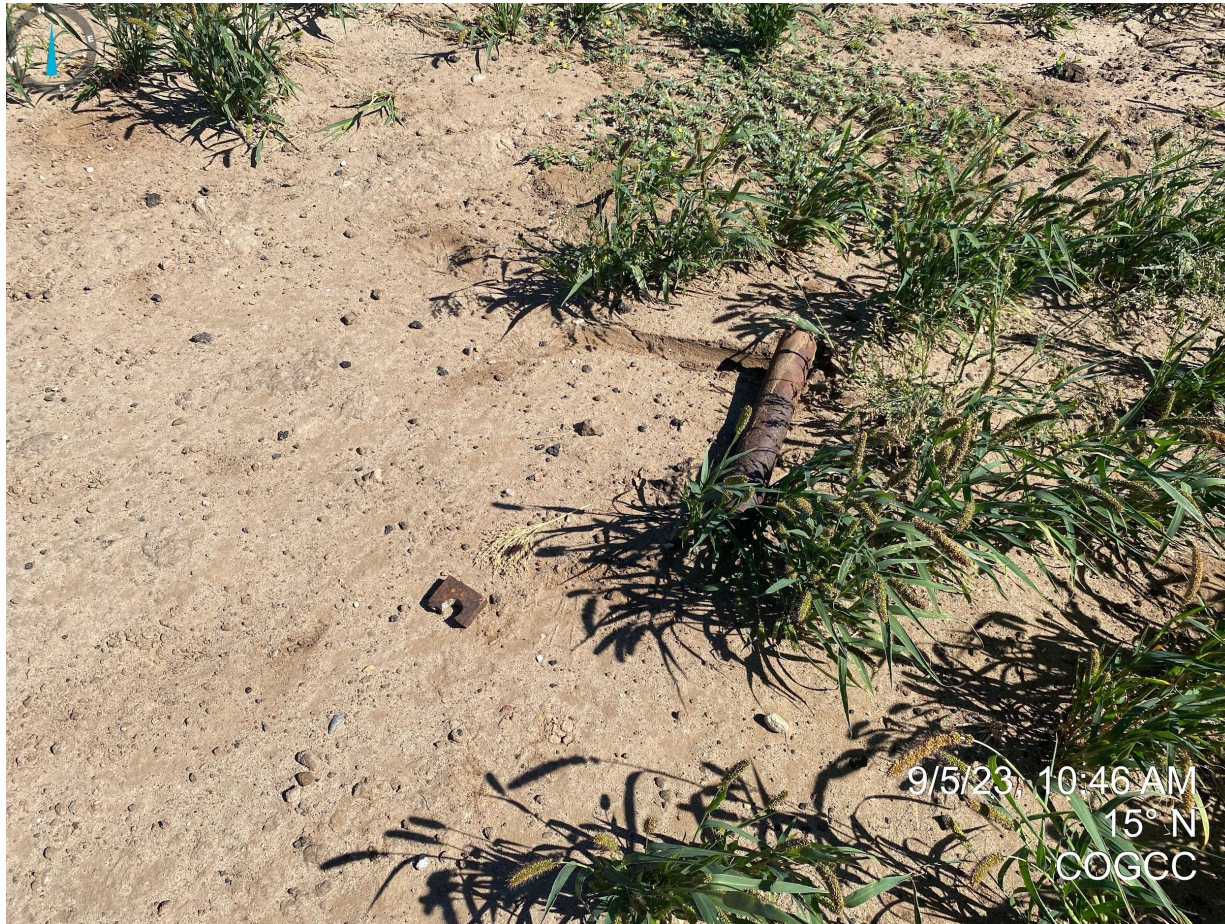
Photo 10. Debris remains on location.

Inspection Photos Location Name: Wood 1 Location ID: 394686