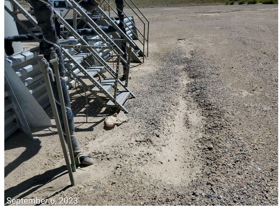
Photo 11: Subsidence concerns observed on the west end of the battery facility.