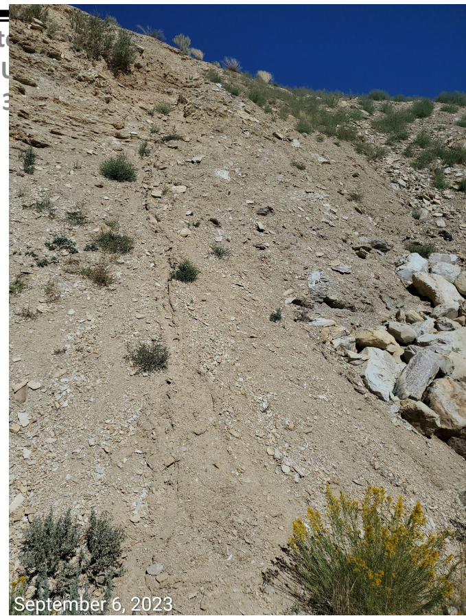
Photo 6: Photos taken from the northeastern cut slopes of the Location. Slopes lack stabilization.