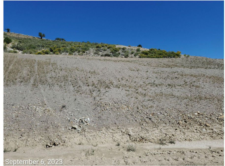
Photo 7: Photos taken from the slopes on the eastern interim areas of the Location. Operator has implemented hydromulch in conjunction with surface roughening. Hydromulch show signs of disrepair.