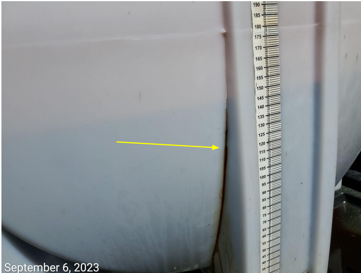
Photo 5: Continued from photo 4. Arrow shows crack within tank resulting in spill.