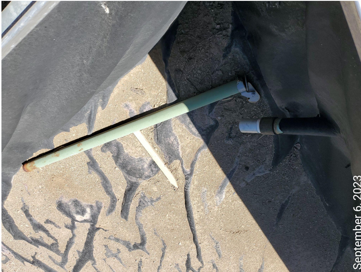
Photo 9: Unused pipe stored within the containment BMP of the battery facility.