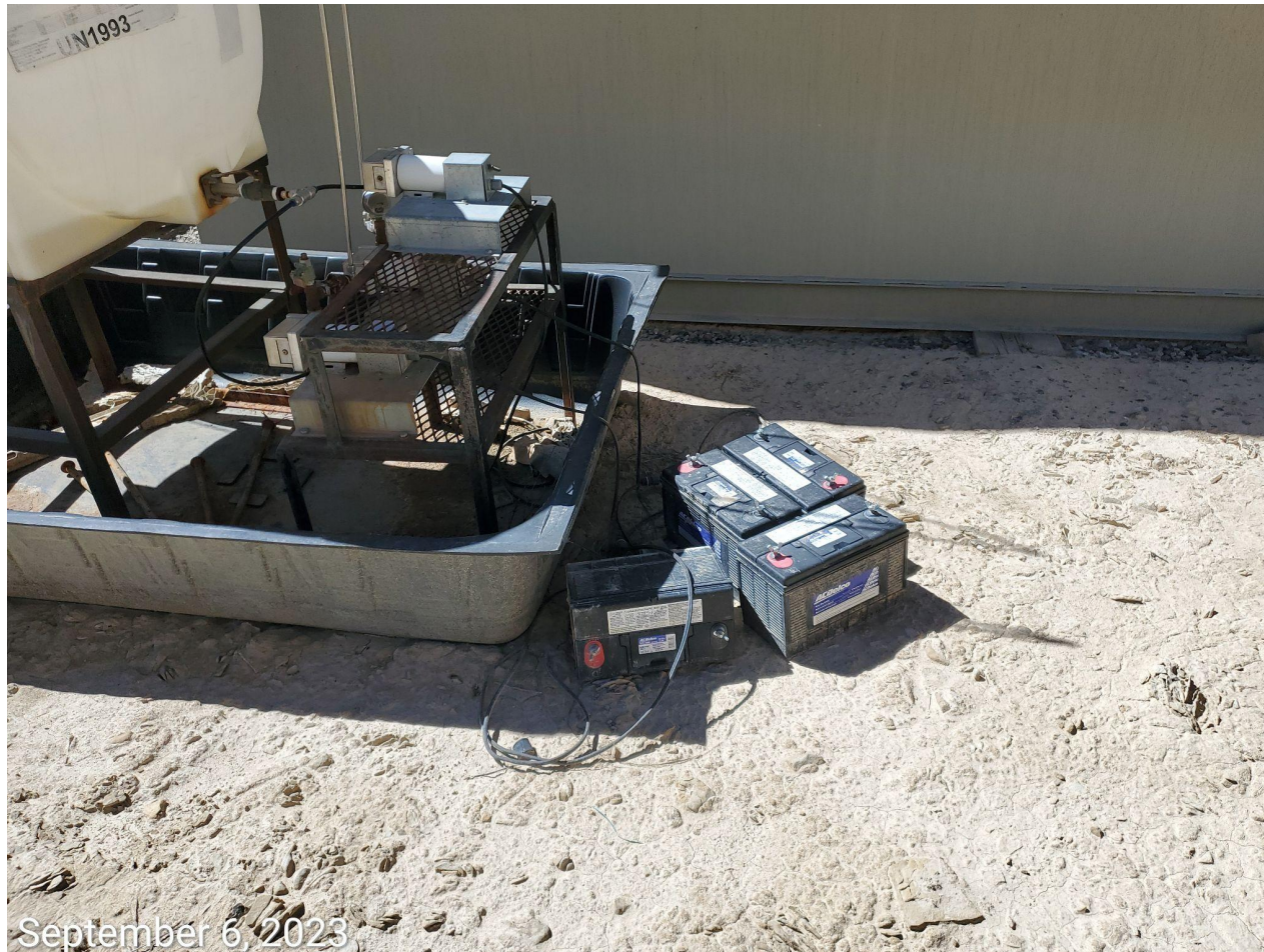
Photo 8: Unused batteries improperly stored on Location. Methanol tank also appears to be unused.