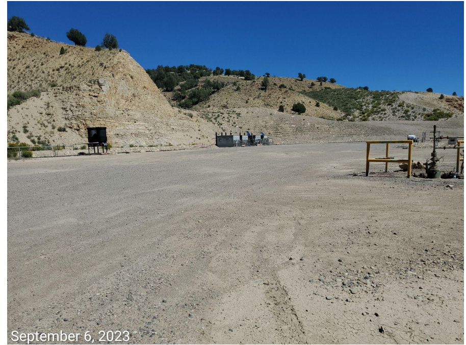
Photo 1: Photos 1-2 taken from the west end of the Location. Photos provide an overview of the Location from north, northeast, southeast to south.