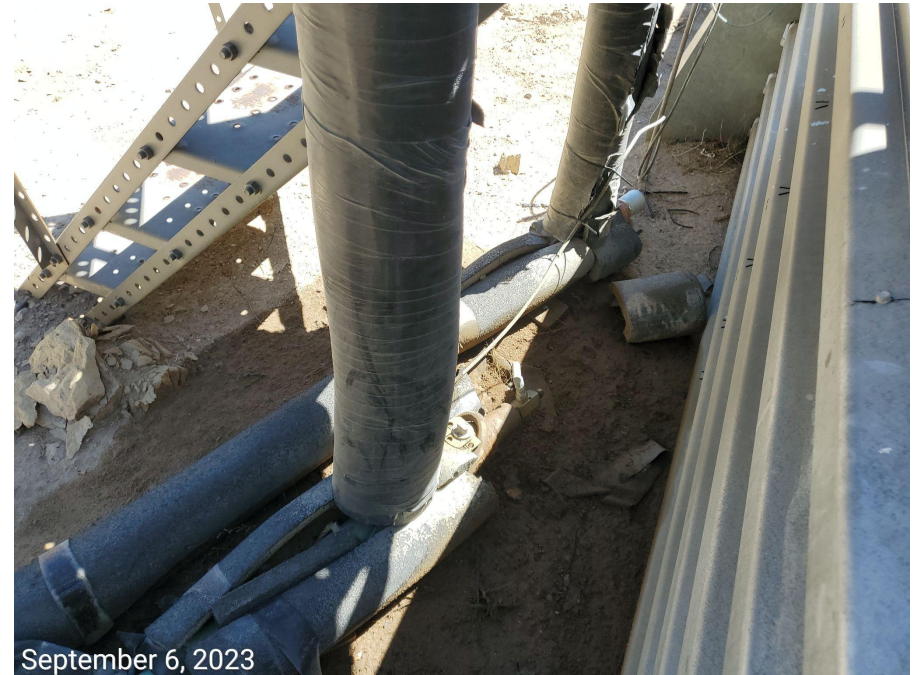
Photo 10: Photos taken from the east end of the tank battery facility. Photo shows stained soils.