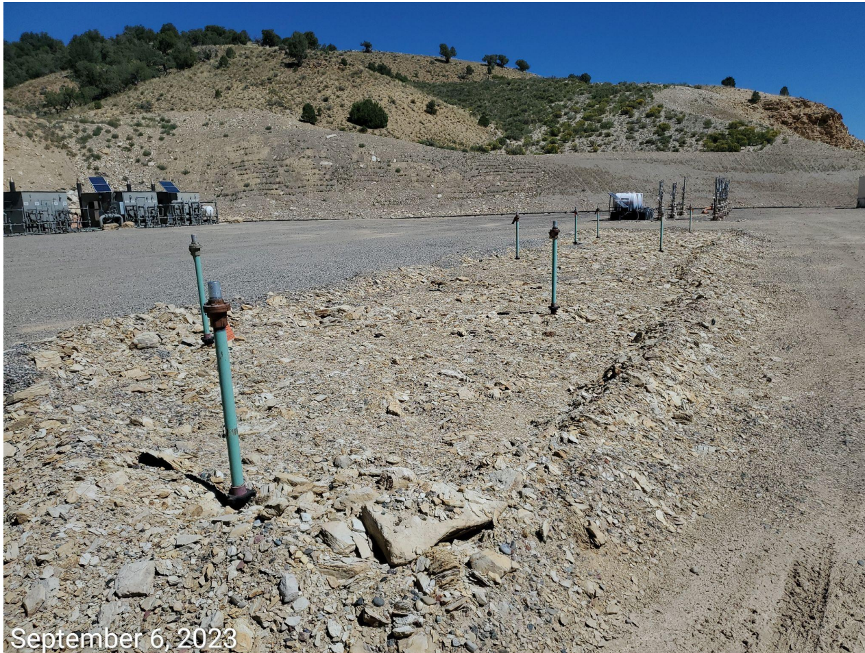
Photo 3: Photo shows riser equipment associated with abandoned wells remain on the Location.