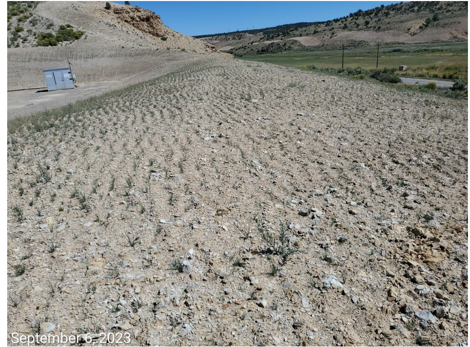
Photo 12: Photos examples of the interim areas of the Location. Interim reclamation “in process”.