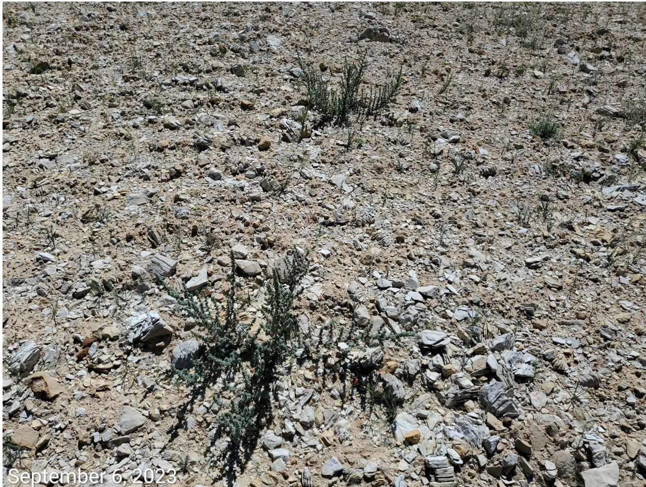
Photo 13: Photo example of Halogeton observed on the interim areas. Weeds were observed in low densities, though spread throughout the entire interim areas.