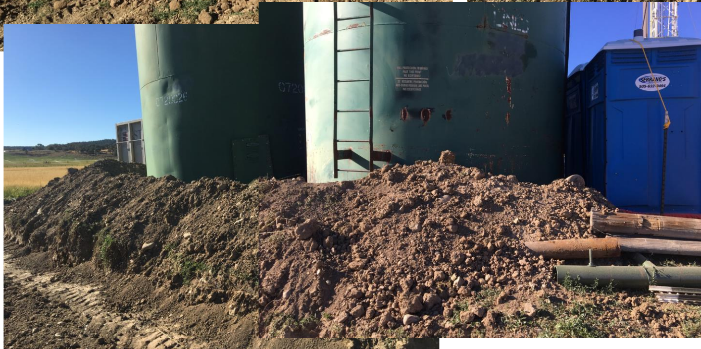
TANK SECONDARY CONTAINMENT