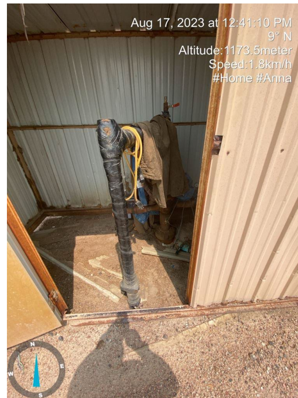
2. Wellhead in a metal shed