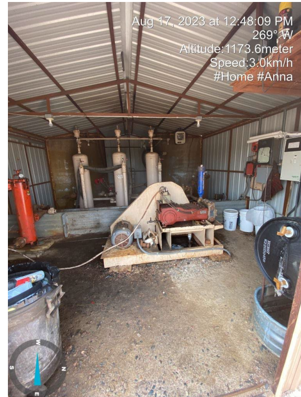
2. Triplex pump in metal shed