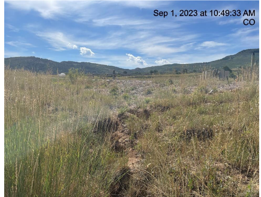
Photo # 7997 Erosion & transport of sediment/insufficient BMP's (NW corner of location)