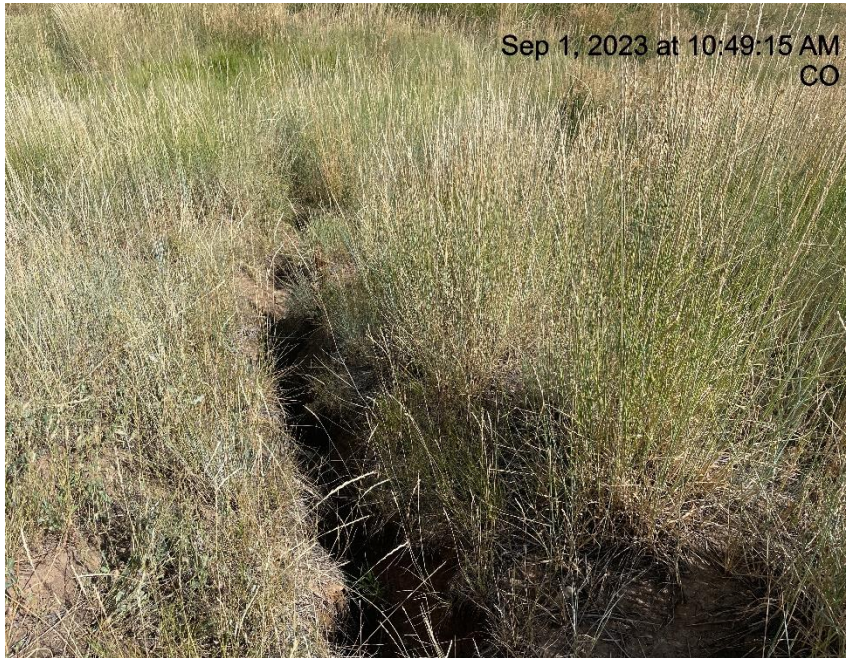
Photo # 7994 Erosion & transport of sediment/insufficient BMP's (NW corner of location)