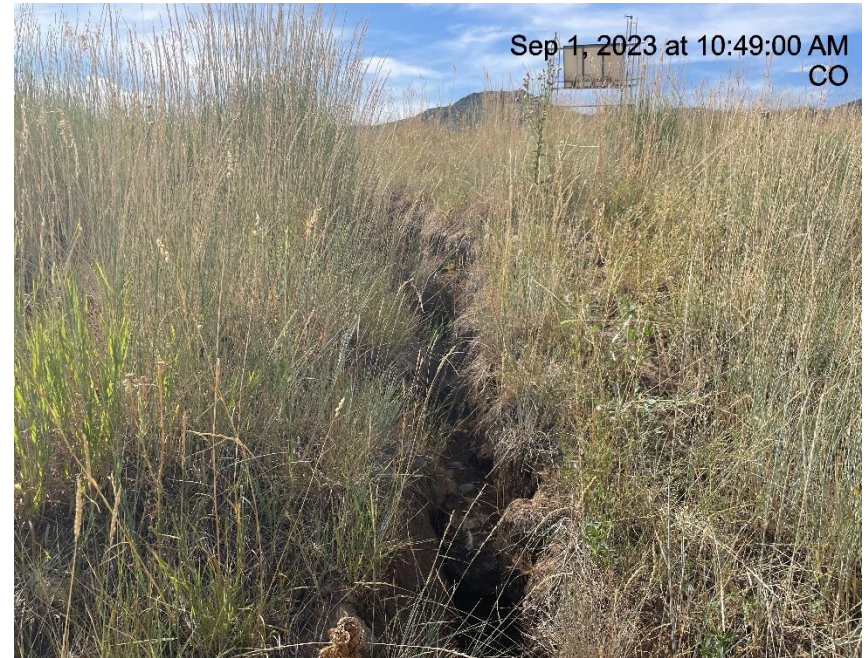
Photo # 7993 Erosion & transport of sediment/insufficient BMP's (NW corner of location)