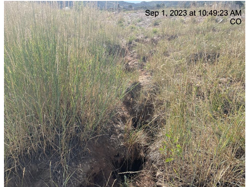
Photo # 7995 Erosion & transport of sediment/insufficient BMP's (NW corner of location)