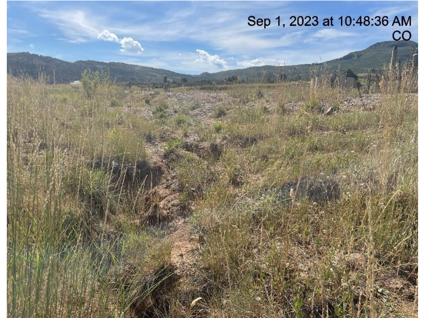
Photo # 7990 Erosion & transport of sediment/insufficient BMP's (NW corner of location)