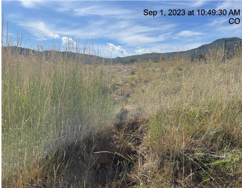
Photo # 7996 Erosion & transport of sediment/insufficient BMP's (NW corner of location)