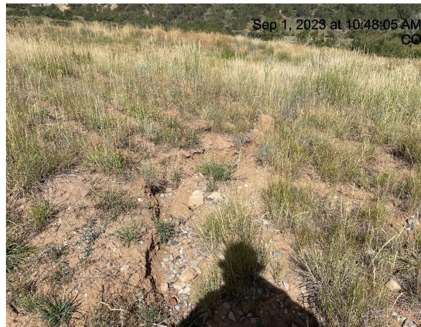
Photo # 7988 Erosion & transport of sediment/insufficient BMP's (NW corner of location)