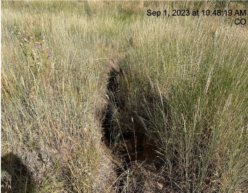
Photo # 7989 Erosion & transport of sediment/insufficient BMP's (NW corner of location)