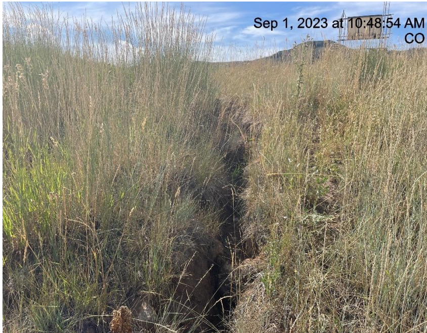
Photo # 7992 Erosion & transport of sediment/insufficient BMP's (NW corner of location)