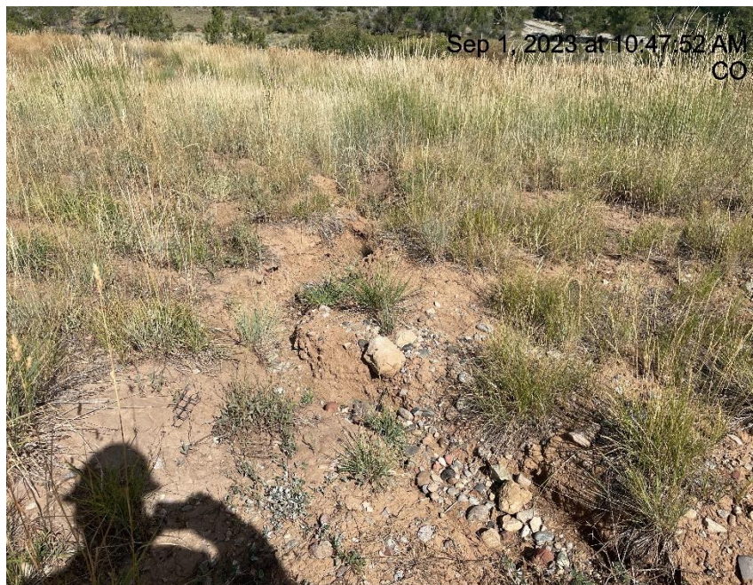
Photo # 7986 Erosion & transport of sediment/insufficient BMP's (NW corner of location)