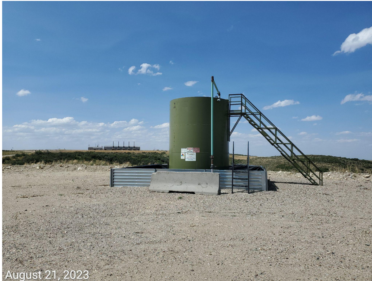
Photo 2: Signage at the tank battery not posted, or not conspicuous.