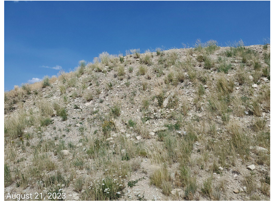
Photo 6: Photos examples of interim areas where additional work may be required to achieve uniform vegetation.