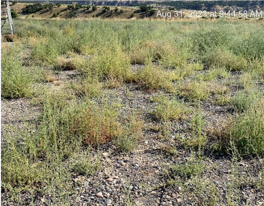
No weed maintenance