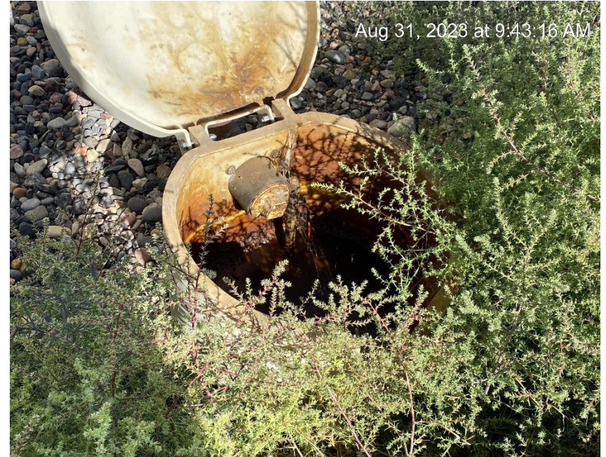
Open end loadline. Valve left open