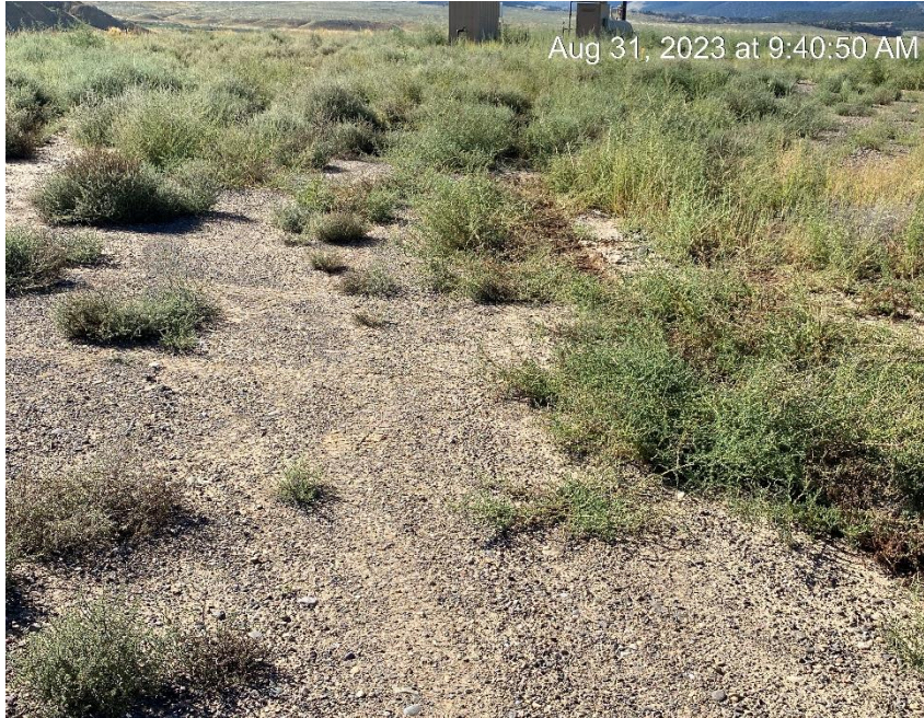
Entrance to location