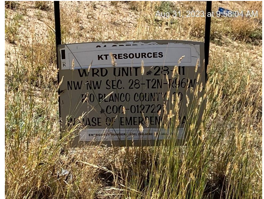
As entrance signs are replaced additional information will be required