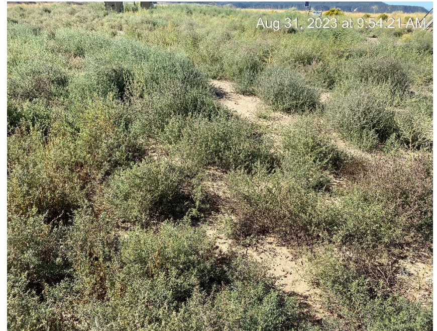
Weeds covering location