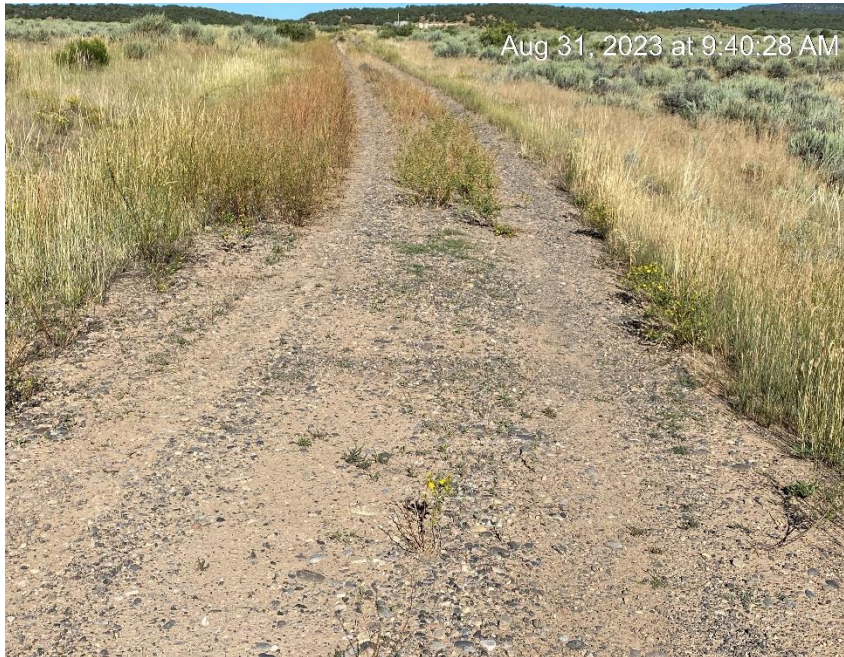
Access road to location