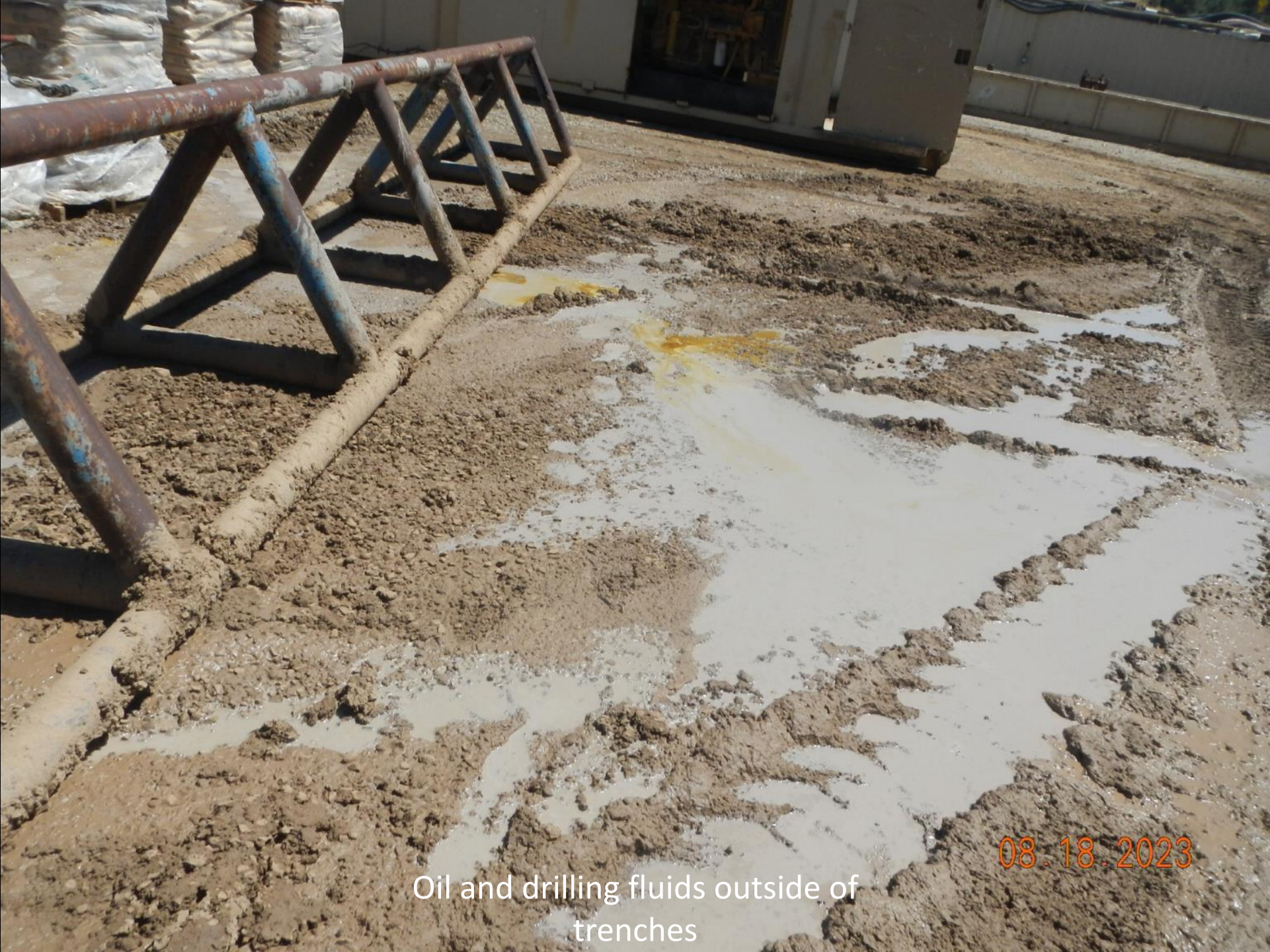
Oil and drilling fluids outside of trenches