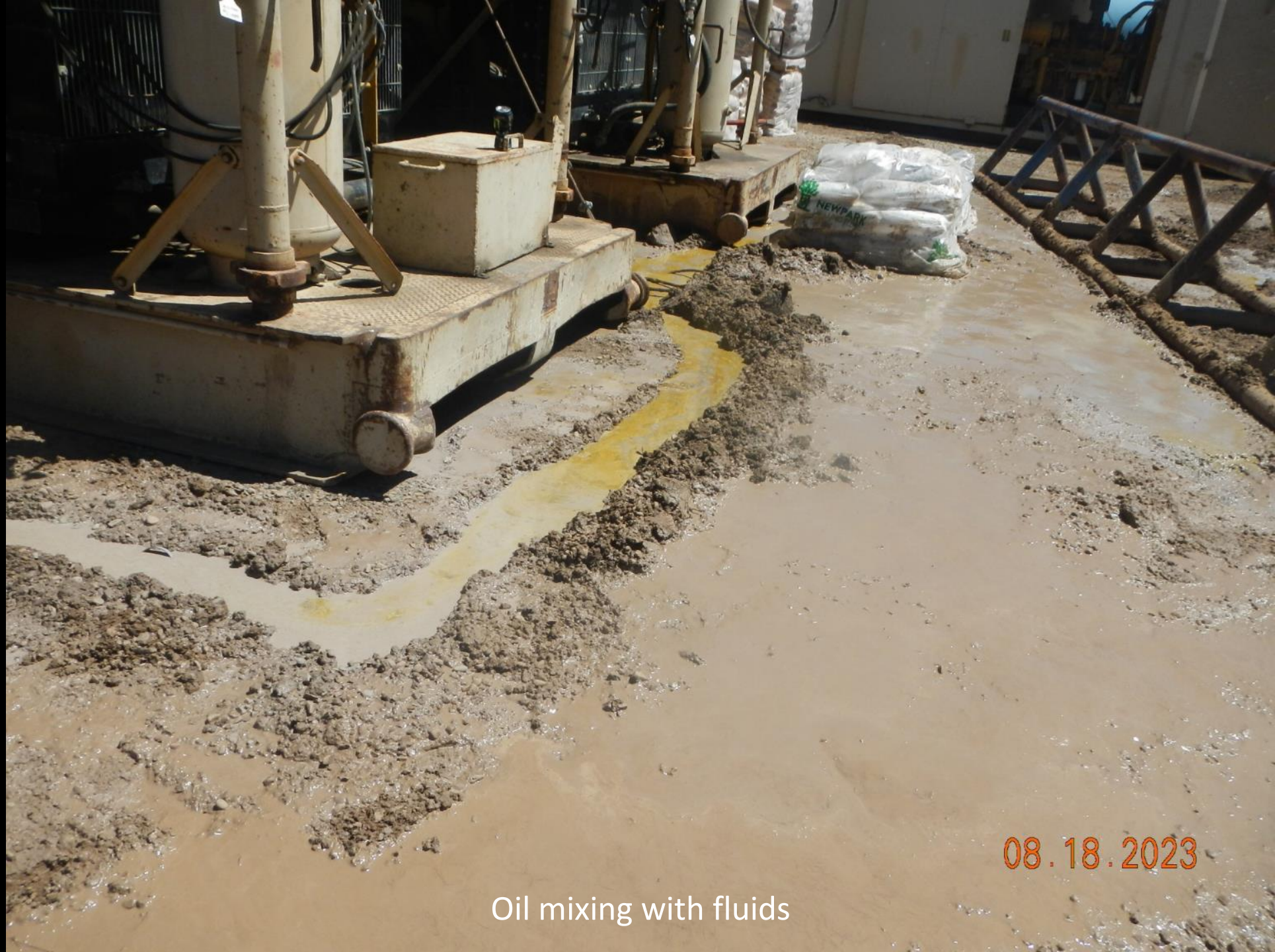
Oil mixing with fluids