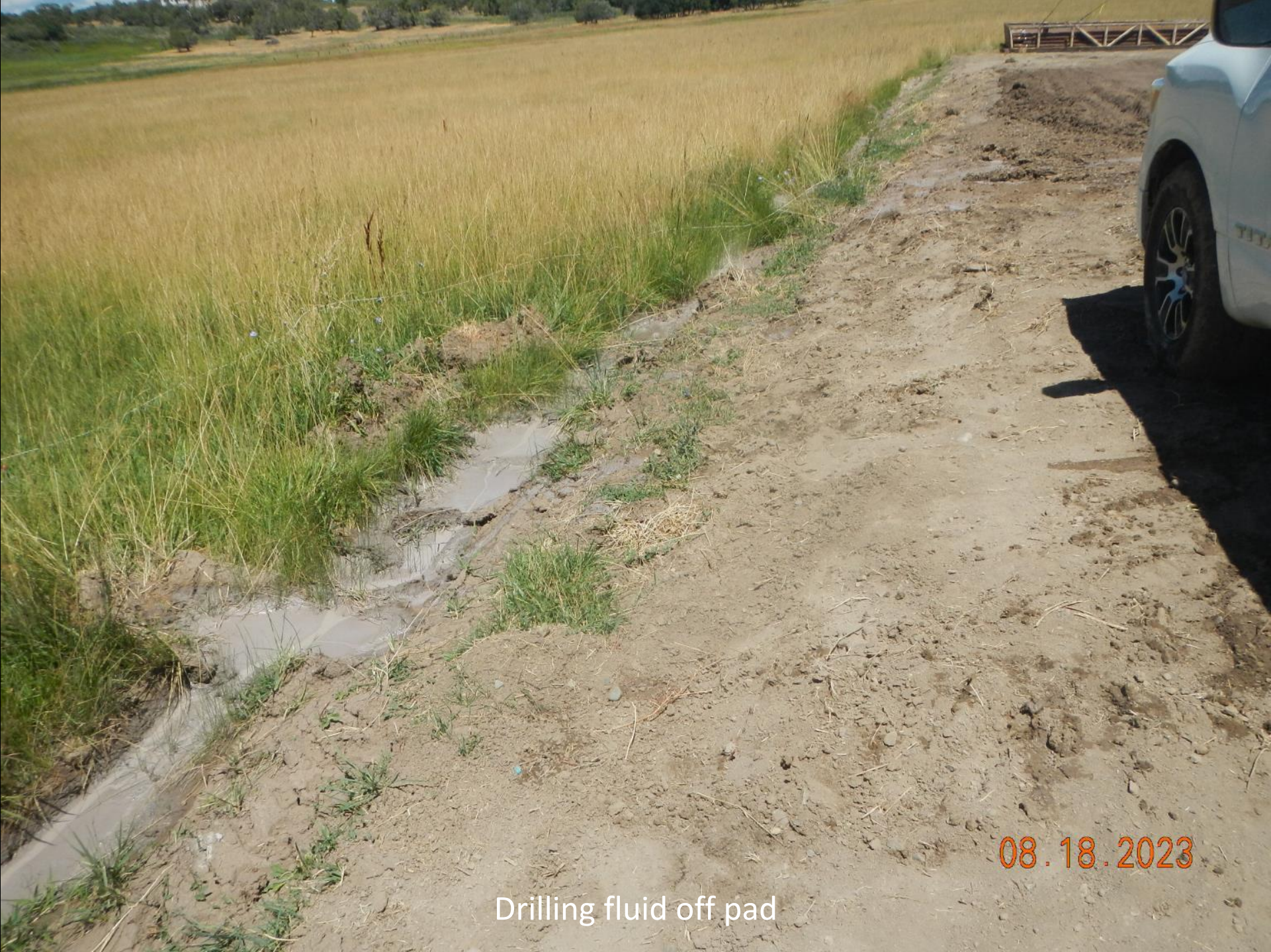
Drilling fluid off pad