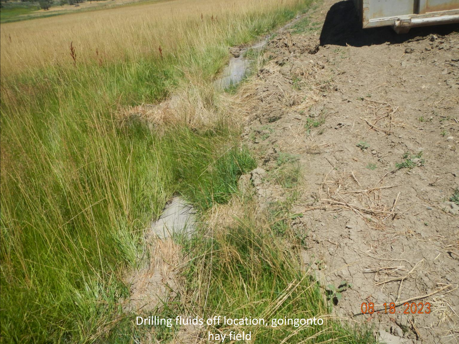
Drilling fluids off location, going onto hay field